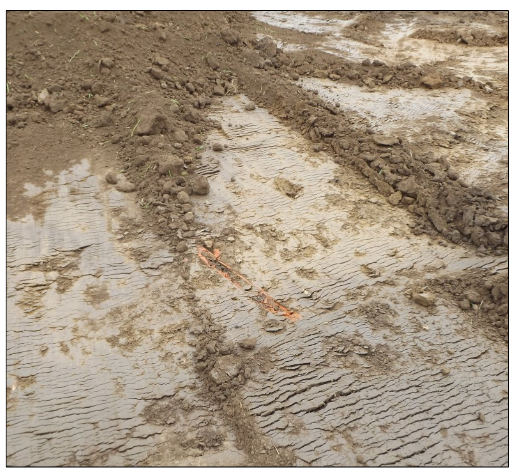
Plate 2. Example of the remains of land drains