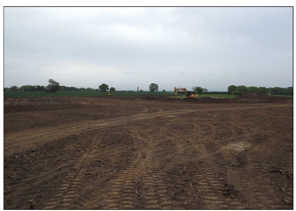
Plate 1. General view of site, looking south-east