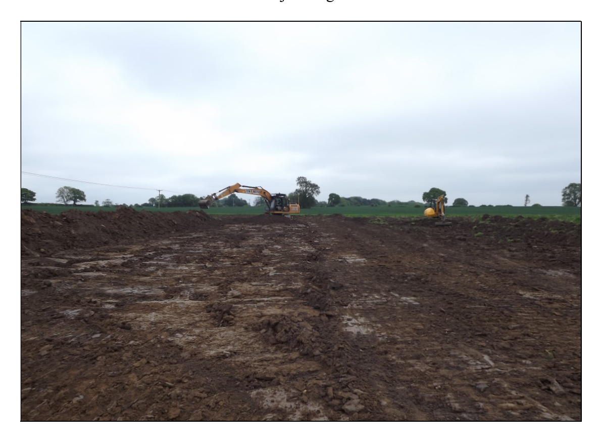
JB Archaeology Ltd