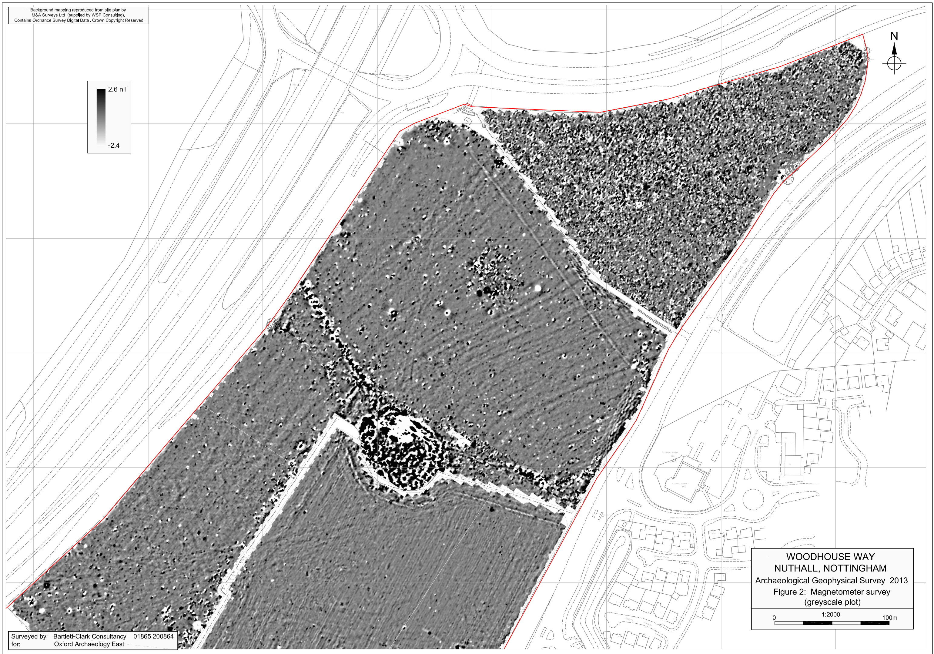
WOODHOUSE WAY NUTHALL, NOTTINGHAM Archaeological Geophysical Survey 2013 Figure 2: Magnetometer survey (greyscale plot) 0 1:2000 100m

Surveyed by: Bartlett-Clark Consultancy 01865 200864 for: Oxford Archaeology East