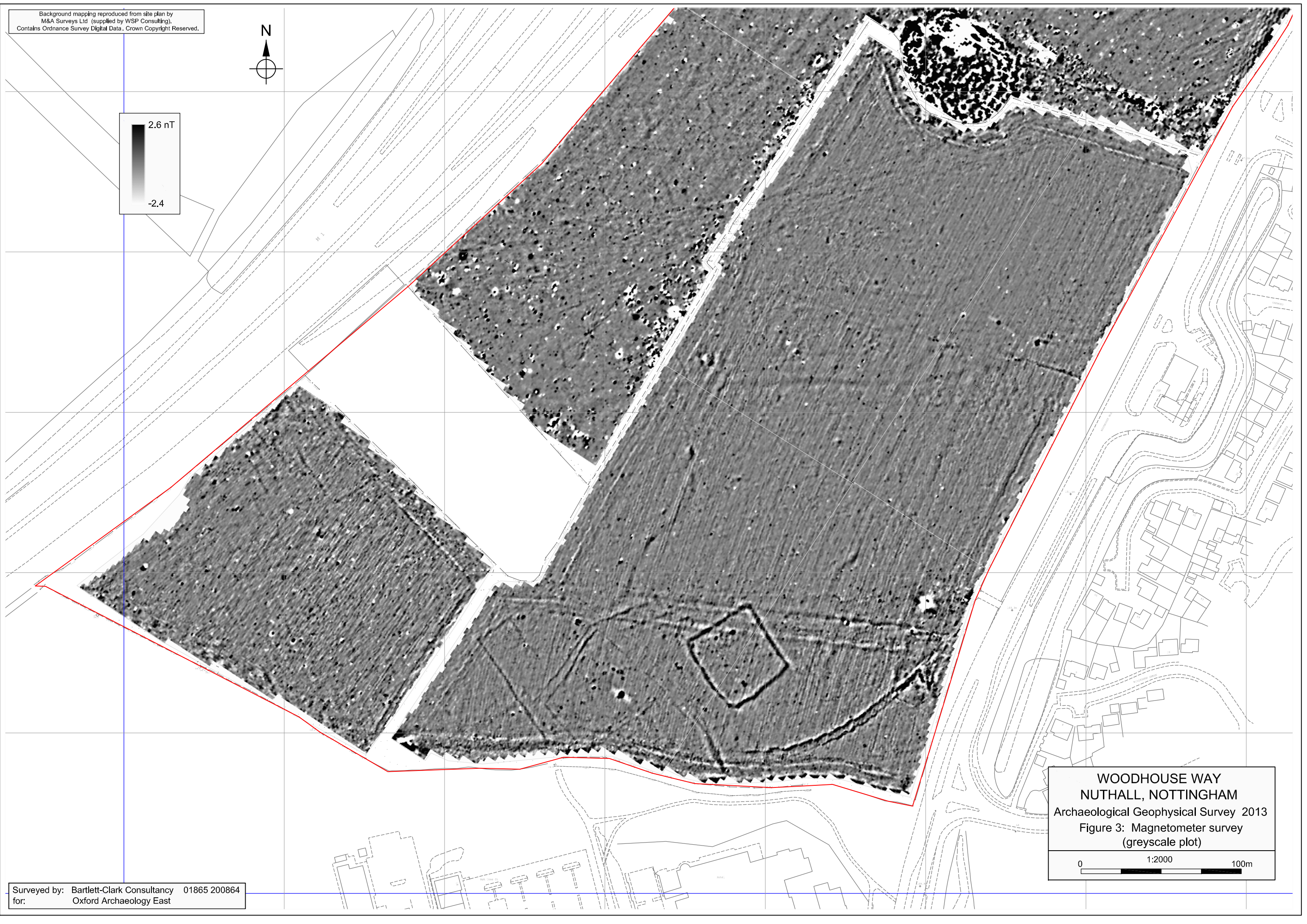
WOODHOUSE WAY NUTHALL, NOTTINGHAM Archaeological Geophysical Survey 2013 Figure 3: Magnetometer survey (greyscale plot) 0 1:2000 100m

Surveyed by: Bartlett-Clark Consultancy 01865 200864 for: Oxford Archaeology East