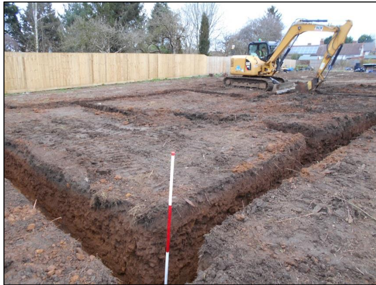
Fig 3: Foundation trenches of the first plot completed. The scale standing in the trench is an upright 2m rod. Three quarters of the depth dug is natural ironstone