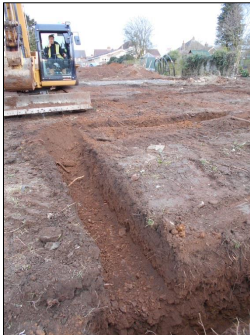
Fig 4: The second plot during machining. Note the ironstone natural geology only just below the modern surface