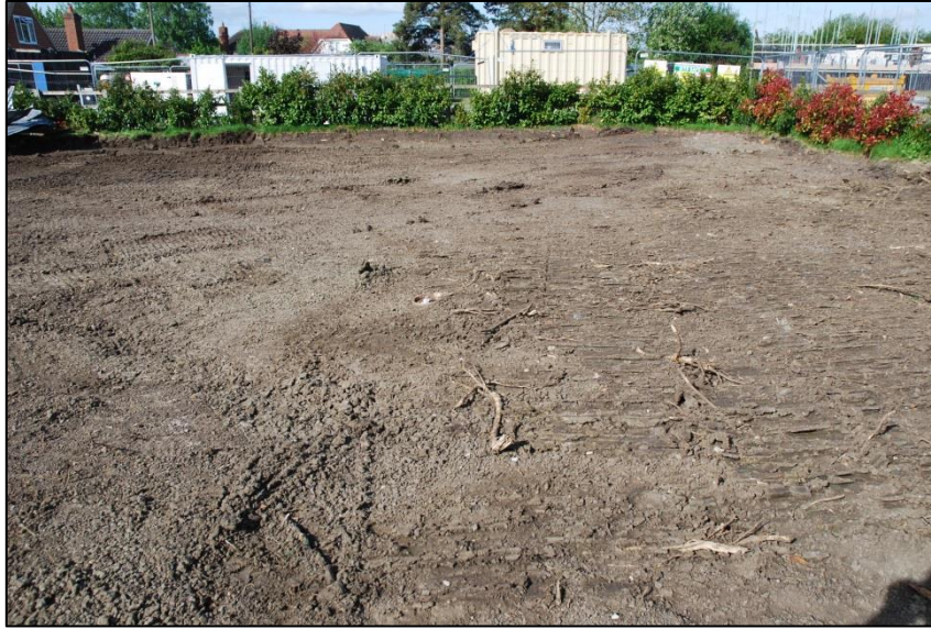
Fig 3: The site stripped of topsoil, looking west

Since this work did not in all areas reliably expose the natural substrate and left a thin topsoil horizon at the base of the topsoil in places, the digging of foundation trenches was then monitored. These cut into certain clay geology mostly to a depth of c1.8m but in places up to 3m. This work was carried out by a 7-ton tracked excavator fitted with a toothless 600mm bucket.