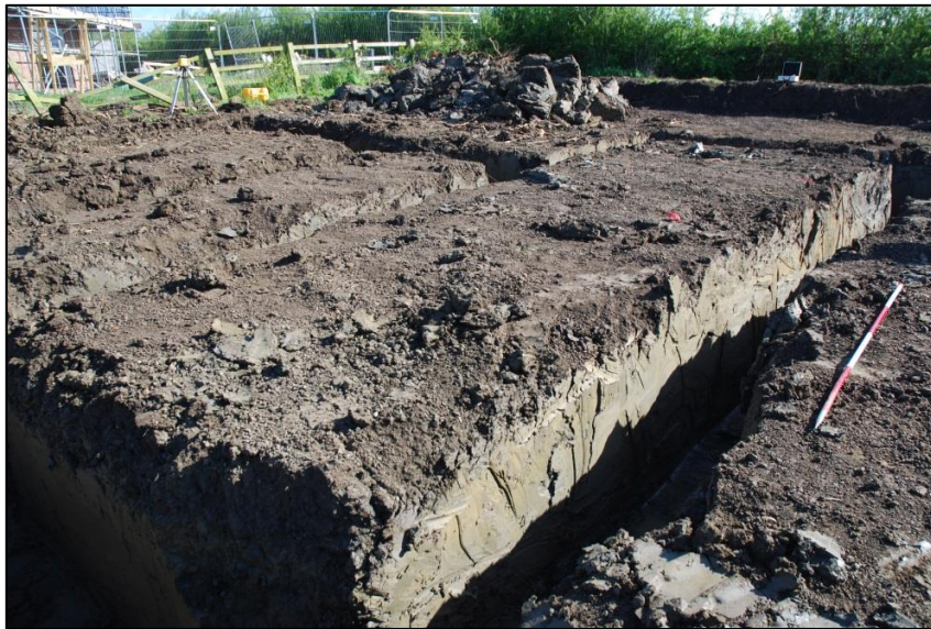
Fig 4: Foundation trenches on the northern plot, looking east, prior to concrete-pouring, scale 2m

Since this work did not in all areas reliably expose the natural substrate and left a thin topsoil horizon at the base of the topsoil in places, the digging of foundation trenches was then monitored. These cut into certain clay geology mostly to a depth of c1.8m but in places up to 3m. This work was carried out by a 7-ton tracked excavator fitted with a toothless 600mm bucket.