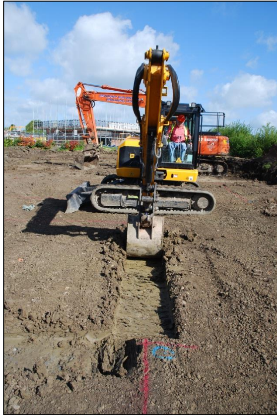
Fig 5: Digging the foundation trenches on the southern plot, looking north.