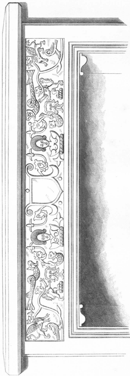
STONE MANTEL PIECE AT STREAT PLACE.