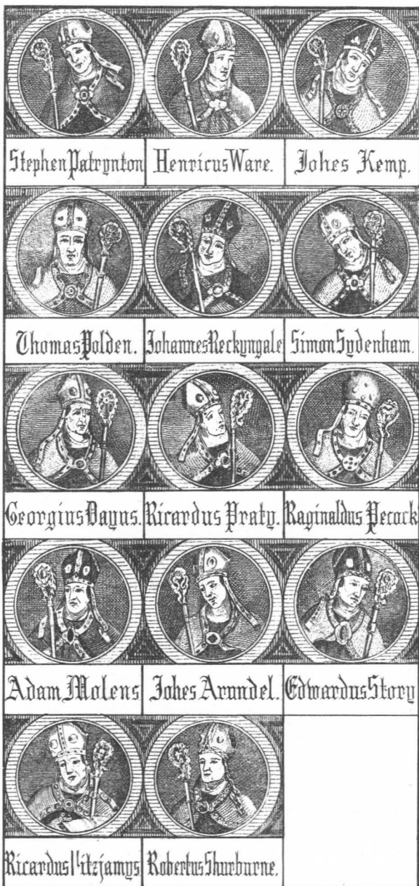
BISHOPS OF CHICHESTER, from PATRYNTON to SHURBURNE.