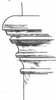
Capitals of Arcades.