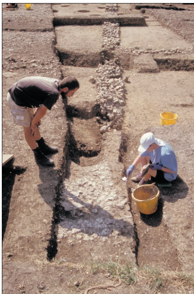
114. David looks down at the chalk floor (600,608; Phase AE) over the robbed-out end of the northern boundary wall.