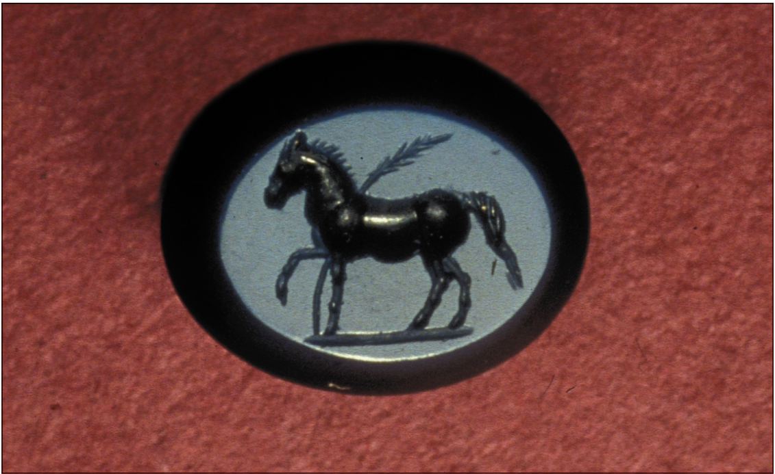
Fig. 237. Intaglio 1. A racehorse, with behind it a palm of victory.