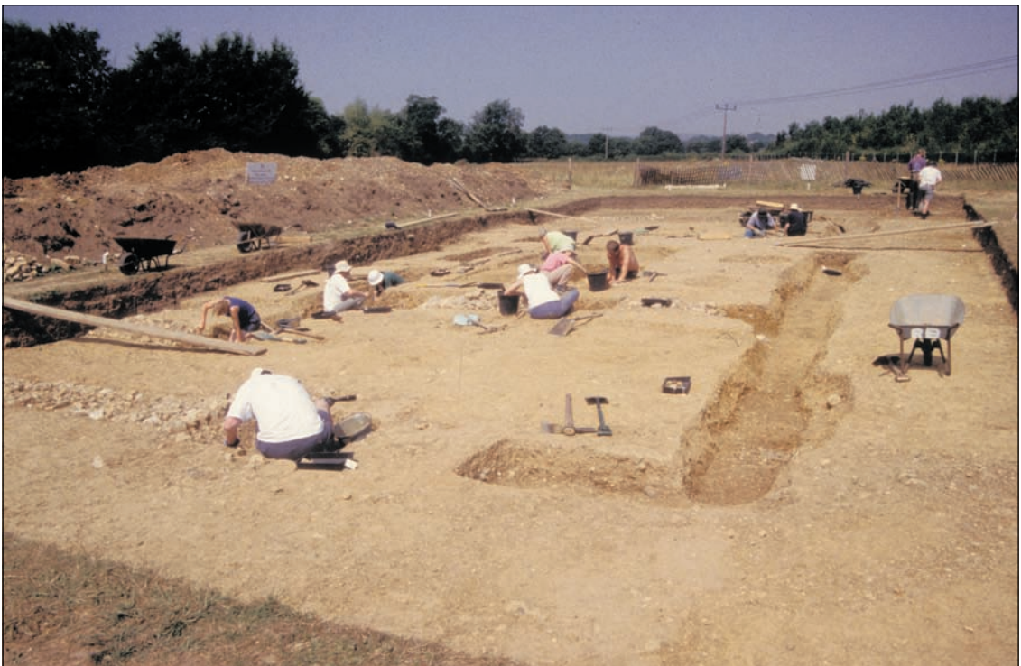
Fig. 46. The south-east corner of Building 3 (context 222); the line of the foundations in this area was heavily robbed in antiquity