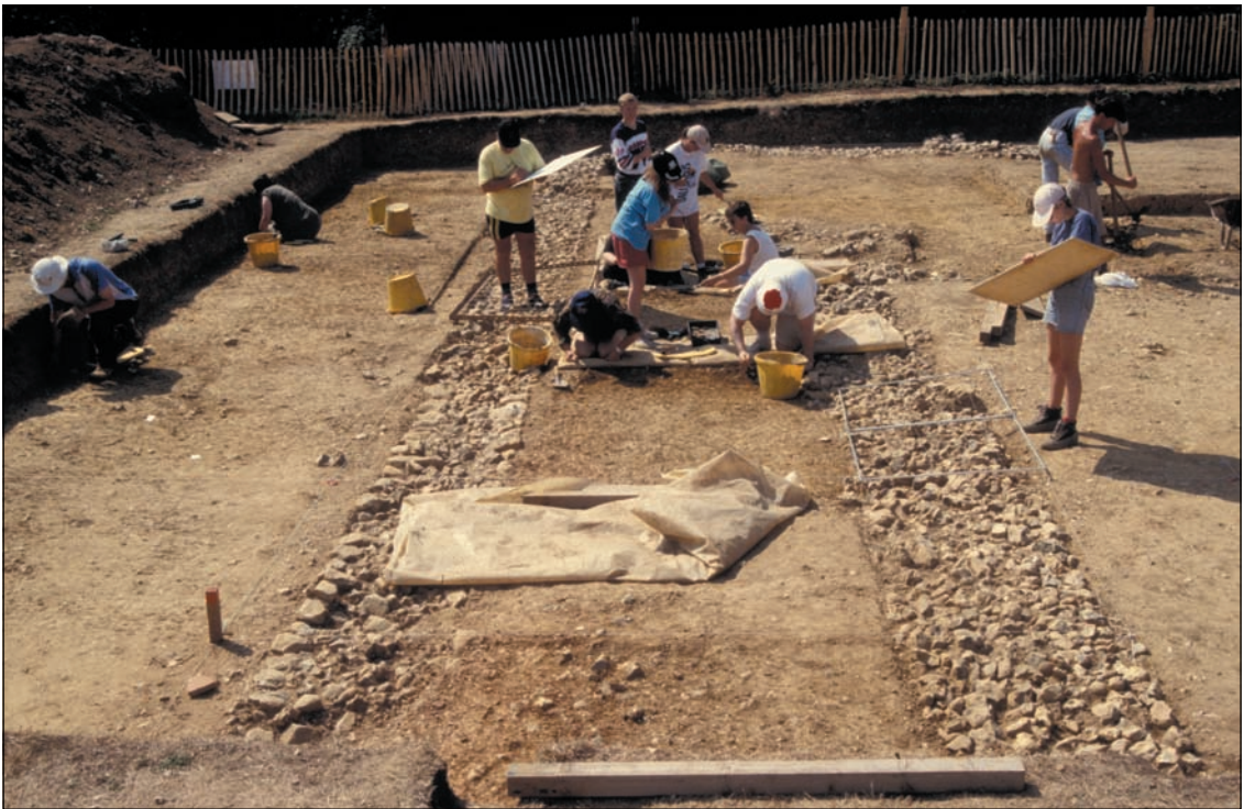
Fig. 14. Robbie and Helen plan the southern walls of Building 3 in 1995.