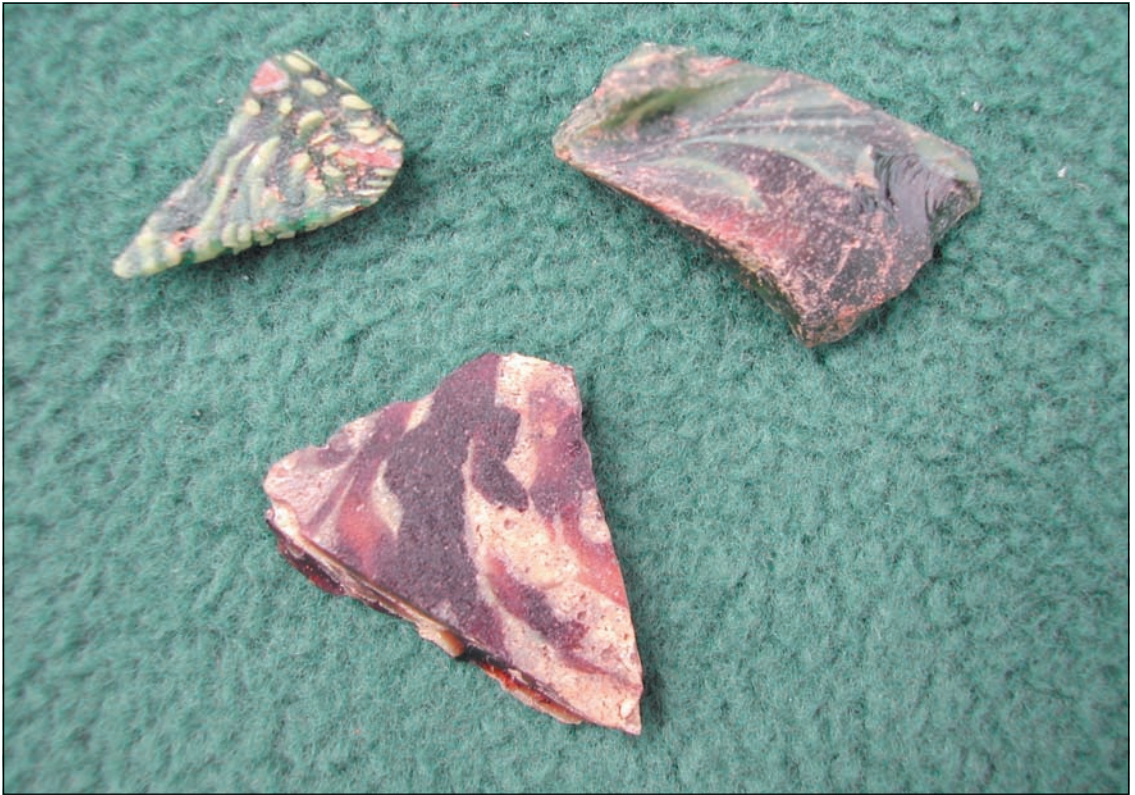
Fig. 233. Polychrome and ground glass fragments – numbers 1,2, and 4 in the Glass Catalogue.