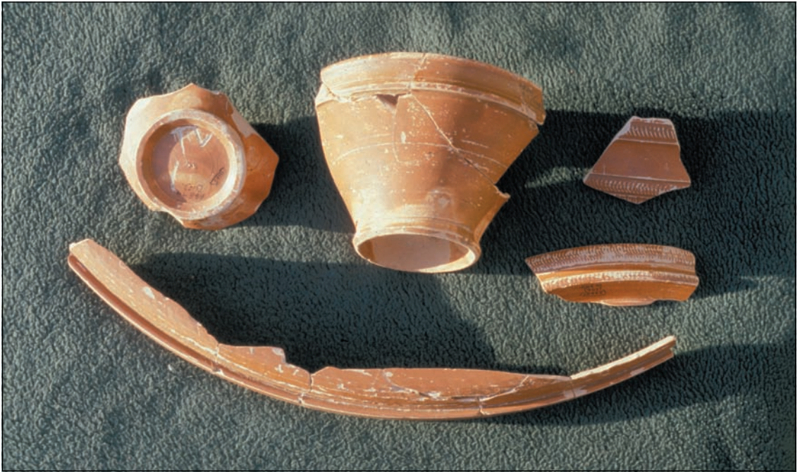
Fig. 190. Arretine ware from the ditch and associated ground surface; note the graffiti TV, presumably the initials of the owner of this cup – SF 11115.