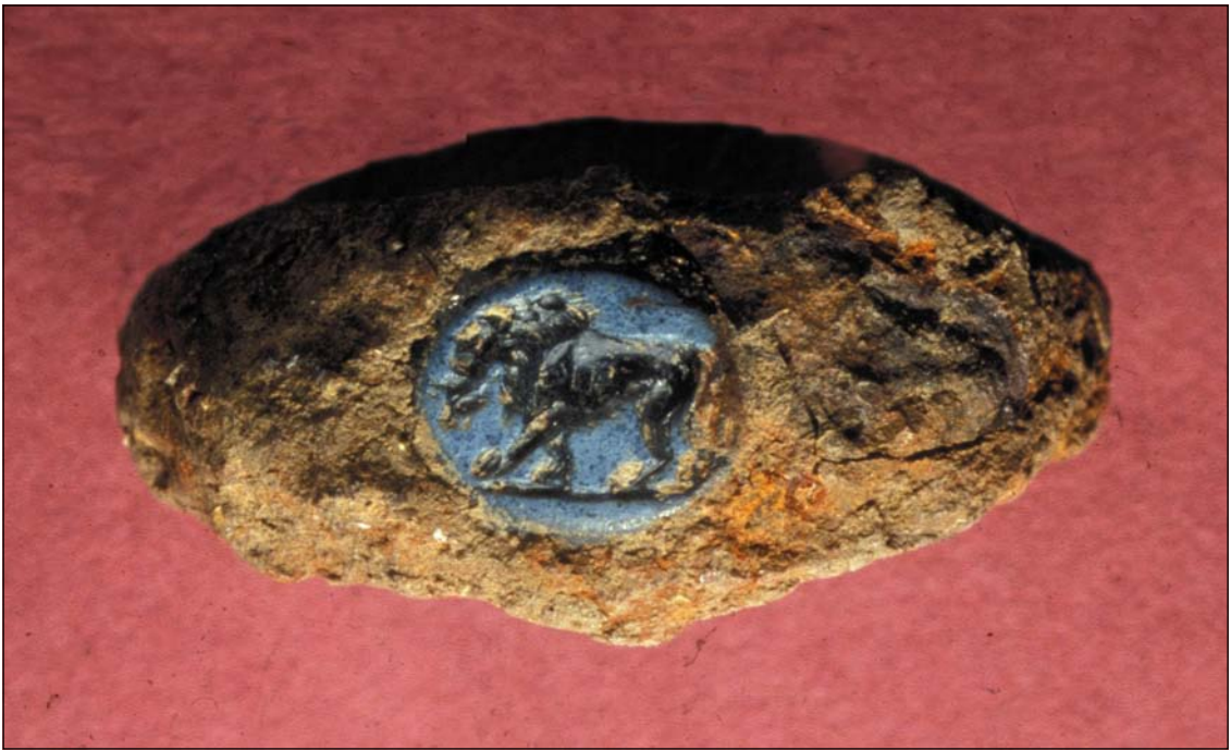
Fig. 238. Intaglio 2. An iron ring with an intaglio depicting a lion with the head of an animal in its jaws.