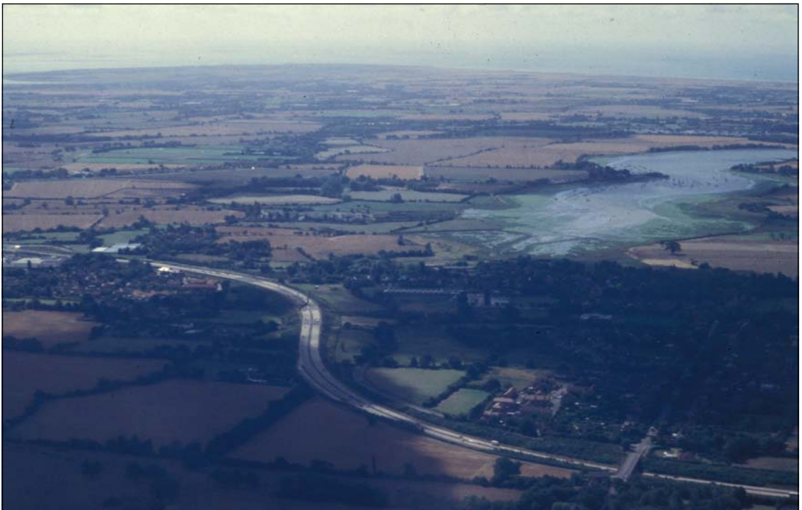
Fig. 5. Aerial photograph of Chichester Harbour from the north; the road at bottom left is the A27. The Palace and our excavation site lie in the centre of the picture between the A27 and the open water.