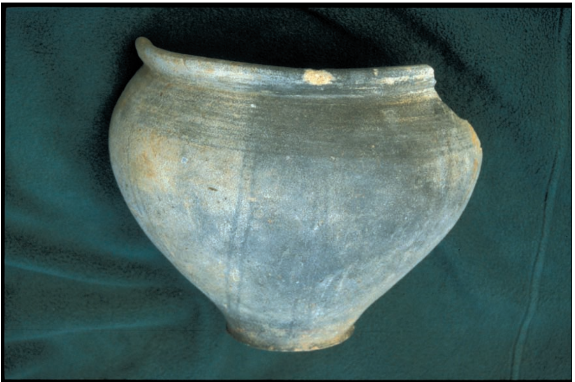
Fig. 81. Nearly complete vessel found in the linear slot of Phase AD.