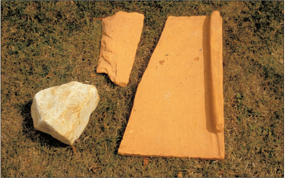
Fig. 120. A typical piece of greensand used to face the walls of Building 3, and a tegula and imbrex from the filling of the central pit of Phase AH.