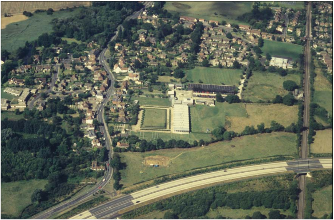
Fig. 4. Aerial photograph of the Palace from the east. The cover building over the North Wing of the Palace is clearly visible, and the location of our excavations in the field between the Palace and the A27 at the bottom.