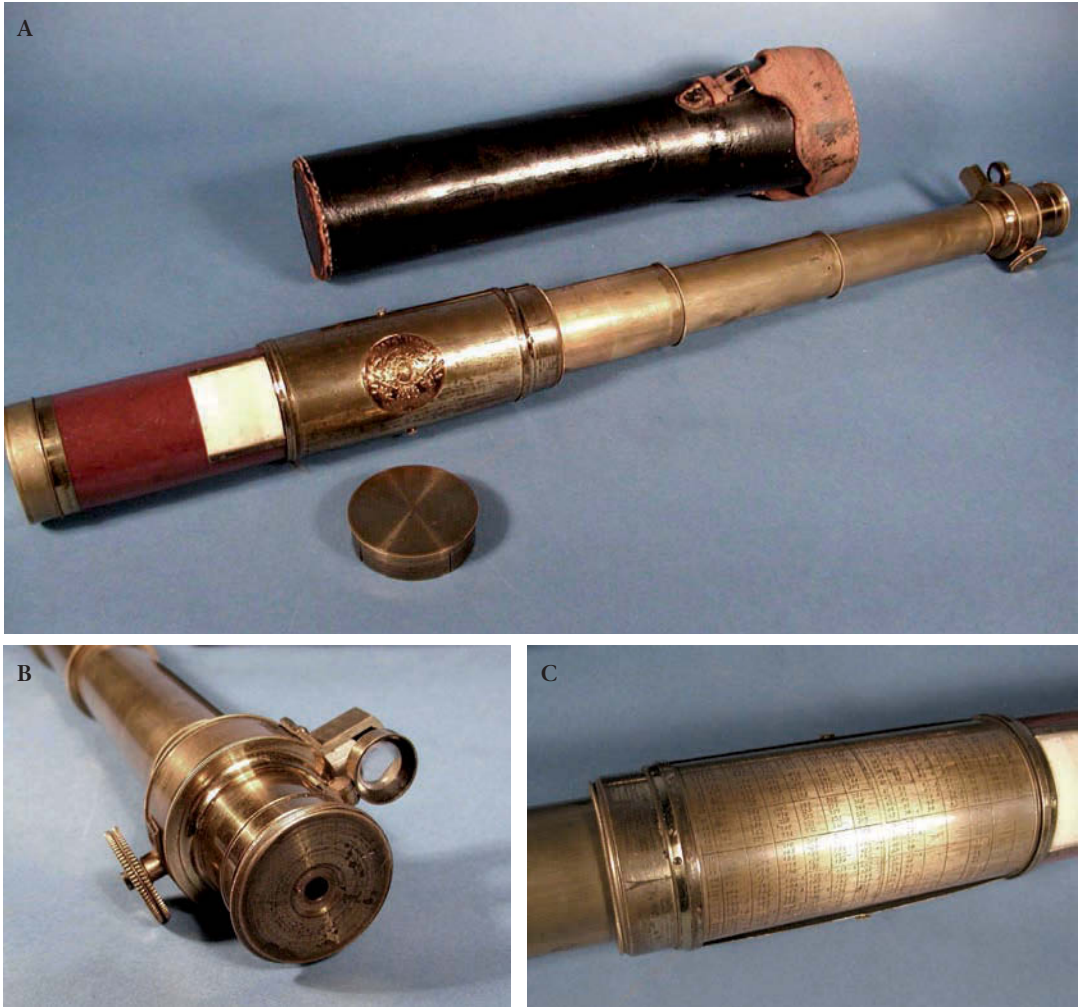
Fig. 2. Patent military and naval telescope, invented by Cater Rand, 1799, and made by William Watkins, London (Collection of M. E. Rudd). (A) The telescope, length extended, about 1040mm. (B) The micrometer built into the eyepiece. (C) The table to calculate the distance of a target of known height from readings by the micrometer.

was already back home, and the Lord Lieutenant was replaced at his own request within a month. 'Had my Lord Camden's administration continued in the country', Burrowes wrote to Pelham a year later, 'I should have had [the school] now more flourishing. I applied to the present Government for that species of encouragement which would have brought it forward but did not succeed.' 38