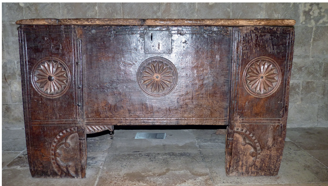
Fig. 1. Chichester chest.

In 1977, the Climping chest appeared in Eames's (1977) major survey of medieval furniture and it was selected for the Age of Chivalry Royal Academy exhibition (Tracy 1987). The Climping chest has