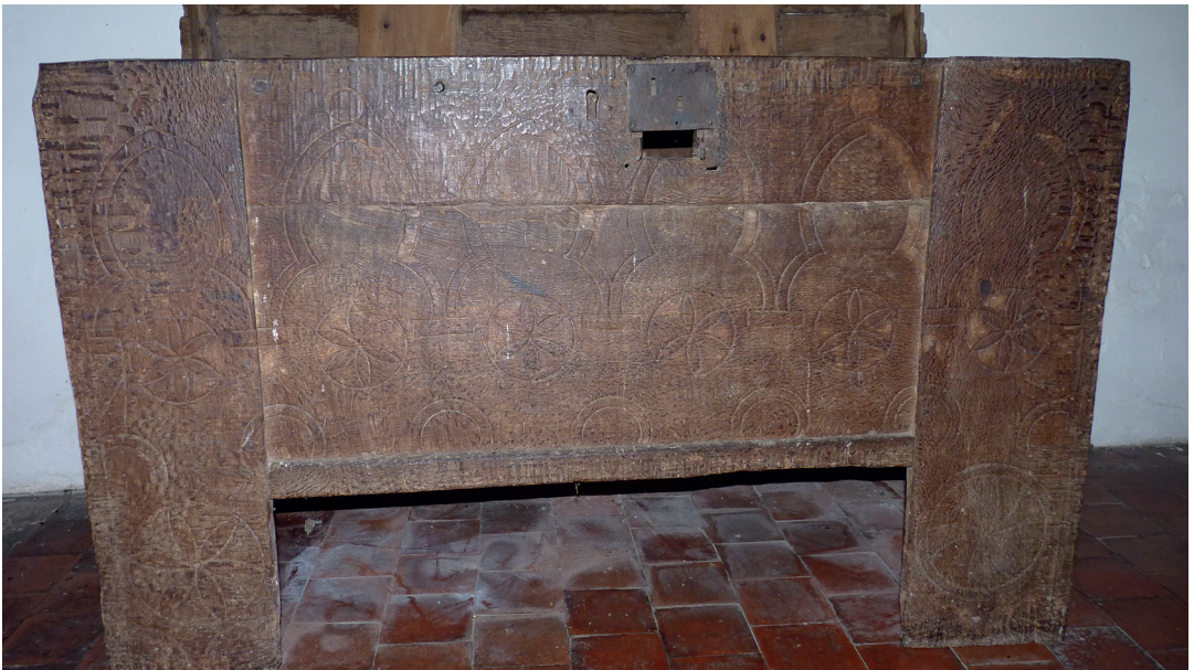
Fig. 13. Wormshill chest, Kent.

How to make sense of these differences? Roundels go back millennia, but their use in painted images, window tracery and woodwork starts in the thirteenth century. Apart from at