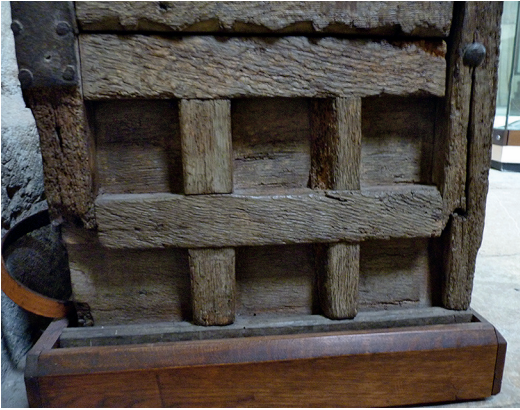
Fig. 6. Climping chest, showing applied grid of 'complete' type.

of the Chichester shape the base generally consists of a series of V-edged boards placed front to back. Chests which are less deep, like the Climping chest, have the same type of base or had one or two long boards placed from side to side. In the Chichester chest there is a 'lip' of canted profile above the groove, which is produced by paring the internal surface of the wall. In the Climping chest the left side has a similar canted lip and the right side has a quarter-round lip. Fig. 7 shows the canted lip on the Bosham chest.