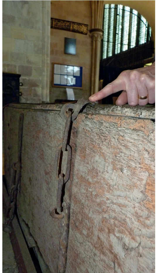
Fig. 10. Climping chest, security chains.

The façade of the Chichester chest has a rectangular triple frame extending across its whole width, with three 20cm star roundels with 16 rays and double rings (Fig. 11). The moulded frame is produced with a scratchstock, a shaped blade held in a stock (Chinnery 1979, 192). The front feet are carved with lunettes with bosses and pilaster, and nailhead borders, a spandrel survives on the left and the rear feet have an openwork lunette with boss. The