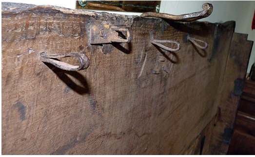
Fig. 8. Stedham chest showing staples for sliding bolt lock.