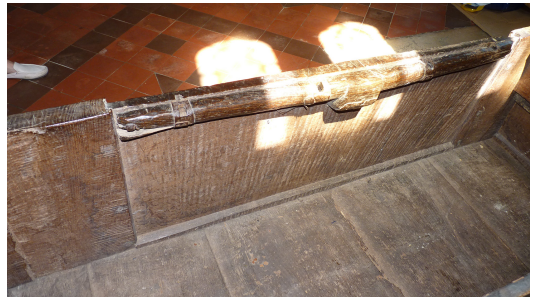
Fig. 7. Bosham chest showing wooden bolt cover, canted lip and base boards.

Locks It is generally thought that 'church chests' had three locks in line with the 1199 and 1308 edicts to this effect. There is no doubt that many medieval chests did and still do have three locks. But it does