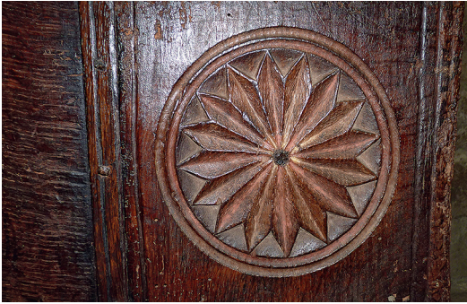
Fig. 11. Chichester chest, right hand roundel showing contrasting colours.

is then removed. It is thus possible that the whole façade was originally painted. (The façade is in good condition so the open worm tracks are not the result of abrasion.) The overall effect is likely to have been very impressive and would have fitted in with the colourful décor of the Cathedral, assuming the chest was made for it, for example there is evidence of roundel decoration in the Lady Chapel (Salzman 1935, 115–16).