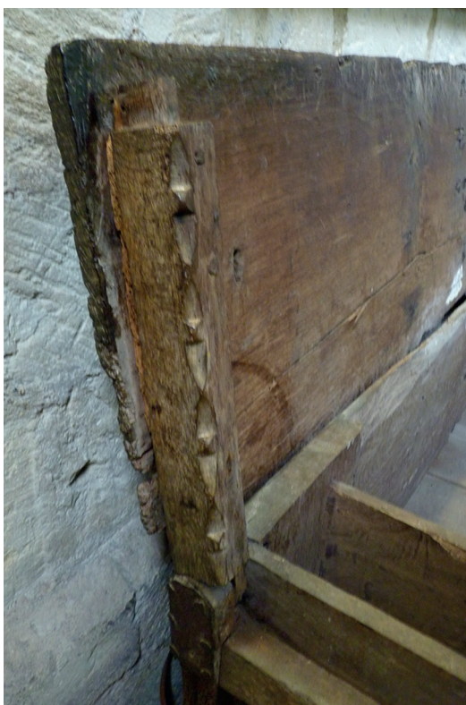
Fig. 4. Climping chest, showing tapered lid and pin hinge with chamfered batten and protective plate.

The front, back and sides of the Chichester chest are nearly twice as thick at the bottom as at the top (4cm against 2cm) which provides more room for the grooves which held the base boards. On the Climping chest the walls are of constant thickness (3cm); the lower edges at the front and back are broken off but they probably had grooves too. The original base boards in both chests are now missing. In other chests in Sussex and Kent