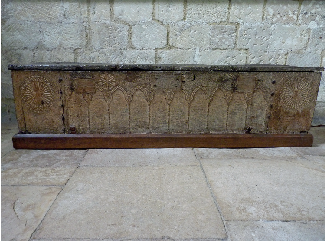
Fig. 2. Climping chest.