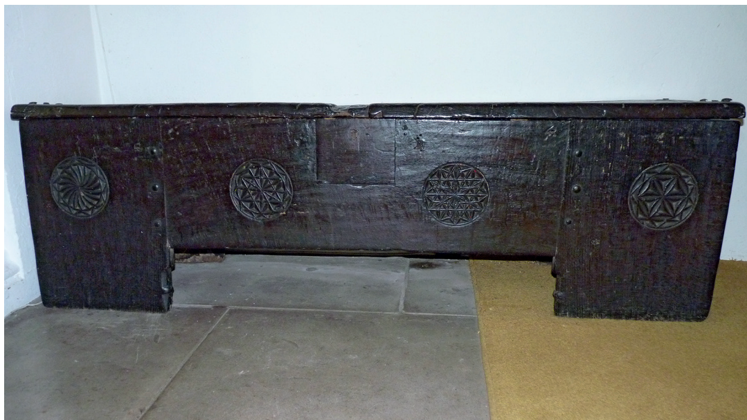
Fig. 14. Midhurst chest.

Climping and Buxted, the Sussex chests with carved façades are striking in having roundels as their sole decoration. 10 When picked out in colour these motifs would have stood out strongly. Roundels were also used to fill the gaps in designs with gothic arcading. The chest at Ewerby, Lincs, dendro-dated to c. 1350, has a fully-carved façade with intersecting gothic arcading and roundels with geometric designs or rosettes in the interstices (Simpson and Litton 1996). North German chests have similar designs a few decades before this (Roe 1902, 36–47, Stülpnagel, 2000, 148–177, Sherlock 2011, Pickvance 2014). So far there are insufficient dendro dates to plot the development of façade design and its regional variations. The fact that the Climping chest, which combines roundels and gothic arcading, has a later dendro date than the Chichester chest, is in line with the trend towards increasing complexity of façade carving seen on the Kent chests between 1240 and 1340.