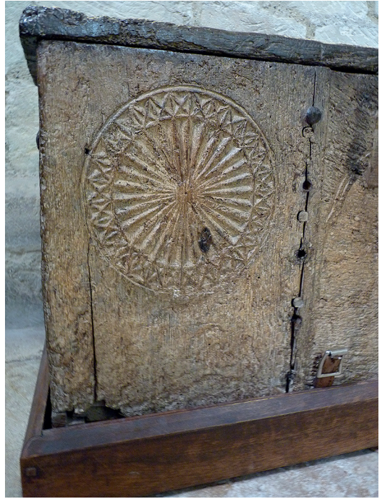
Fig. 12. Climping chest, left hand roundel.