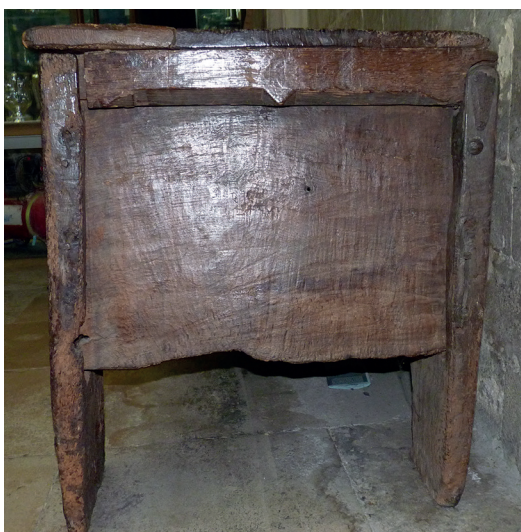
Fig. 5. Chichester chest, showing inward sloping side, chamfered batten and protective plate.