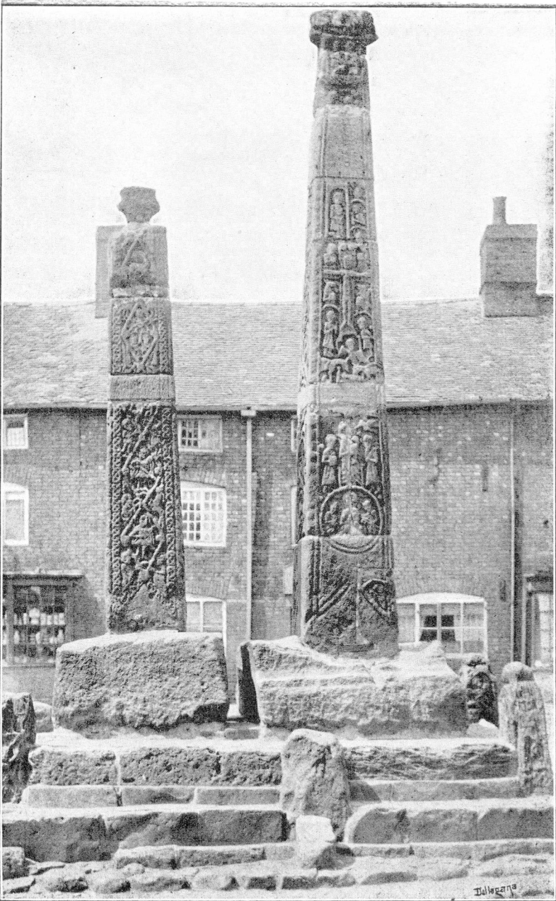
Crosses at Sandbach South side, facing the Market Square