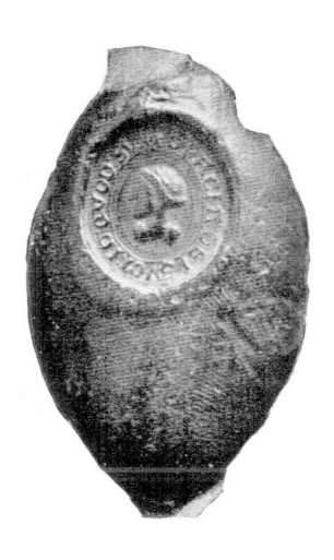
No. 4, Page 18, IV.