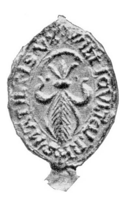
No. 7, Page 34, XXXIII.