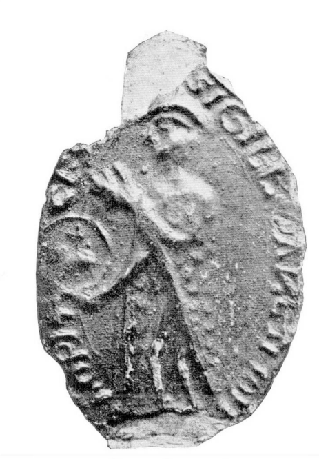
No. 11, Page 21, X.