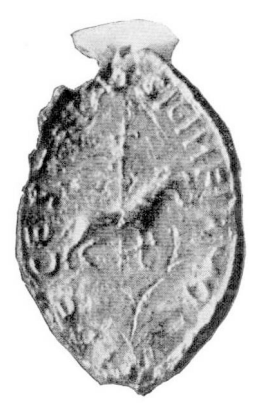
See No. 9 in List of Seals (at end of Paper)