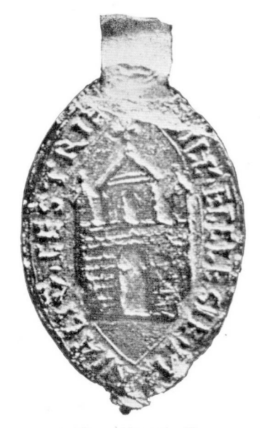
No. 1, Page 16, II.