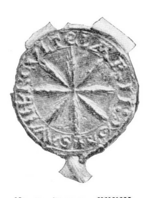
No. 15, Page 33, XXXIII.