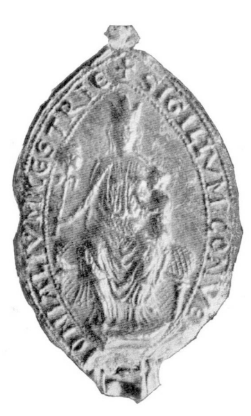
No. 2, Page 28, XXIII.