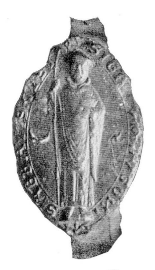
No. 3, Page 18, IV.