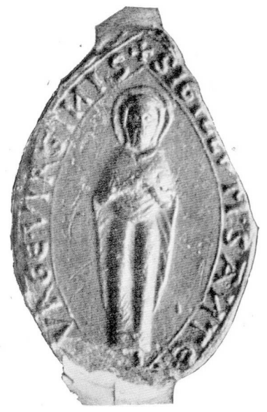
No. 5, Page 18, IV.