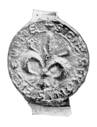
No. 6, Page 20, VIII.