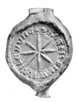
See Nos. 12 and 13 in List of Seals (at end of Paper)