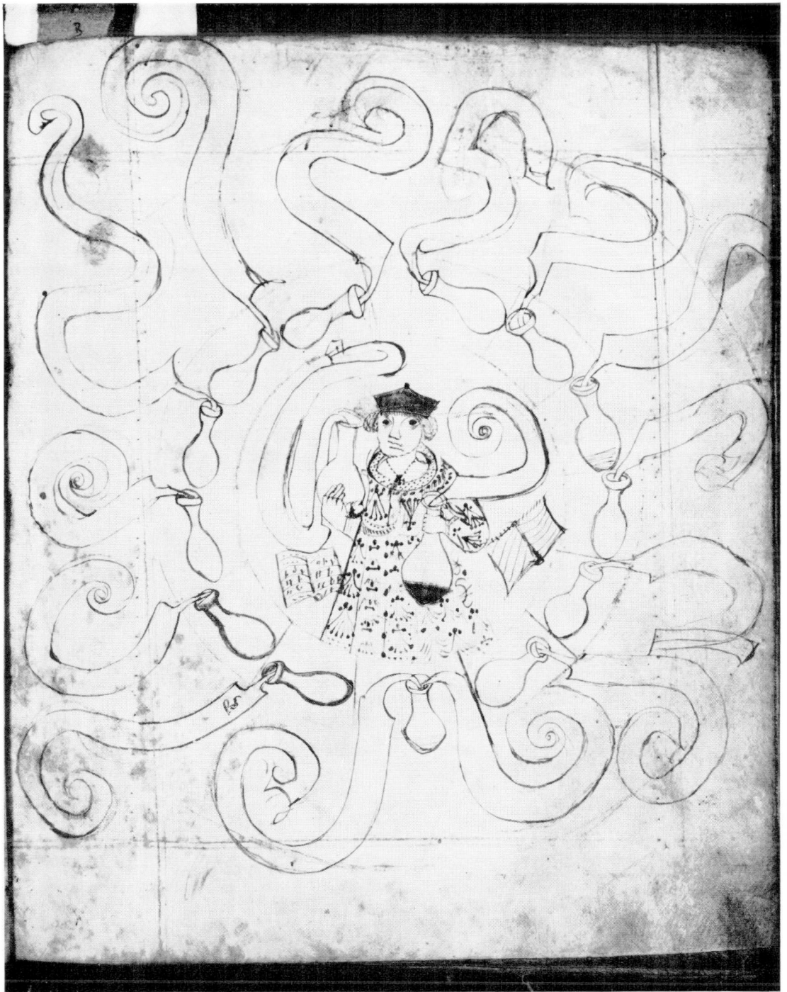
Sketch made about 1550 and used as the frontispiece to the first of the Chester Goldsmiths' minute books.