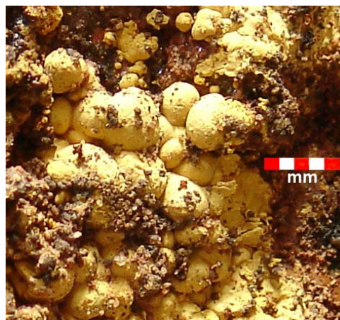
Plate 21 - Context 2200 - Close-up of yellow residue "pustules". Scale : mm.