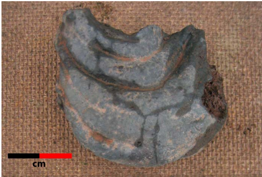
Plate 15 - Context 1987 - Piece of possible tap slag. Scale : cm.