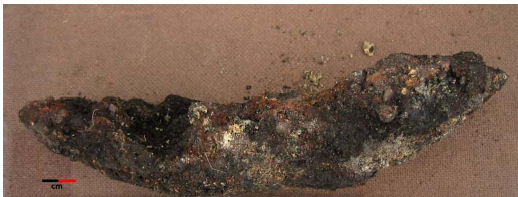
Plate 14: Context 1728 - Large plano-convex hearth bottom. Scale : cm.