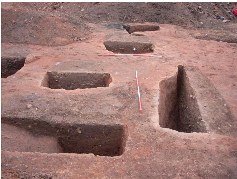
Plate 2: Group of discrete pits, 1938, 1947, 1981, 1982, 2057 and 2104, post-excitation