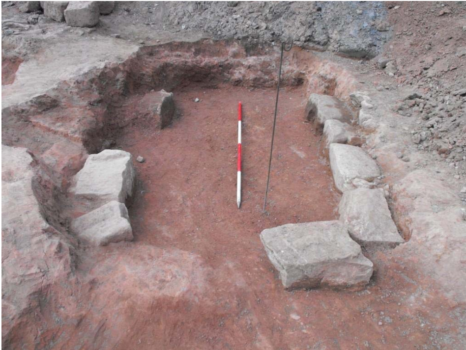
Plate 9: Small, sub-rectangular structure 2328.