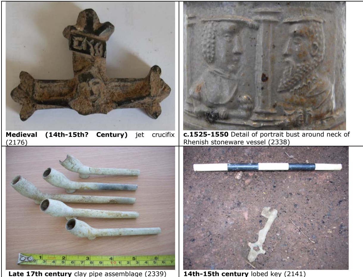
Medieval (14th-15th? Century) jet crucifix (2176)