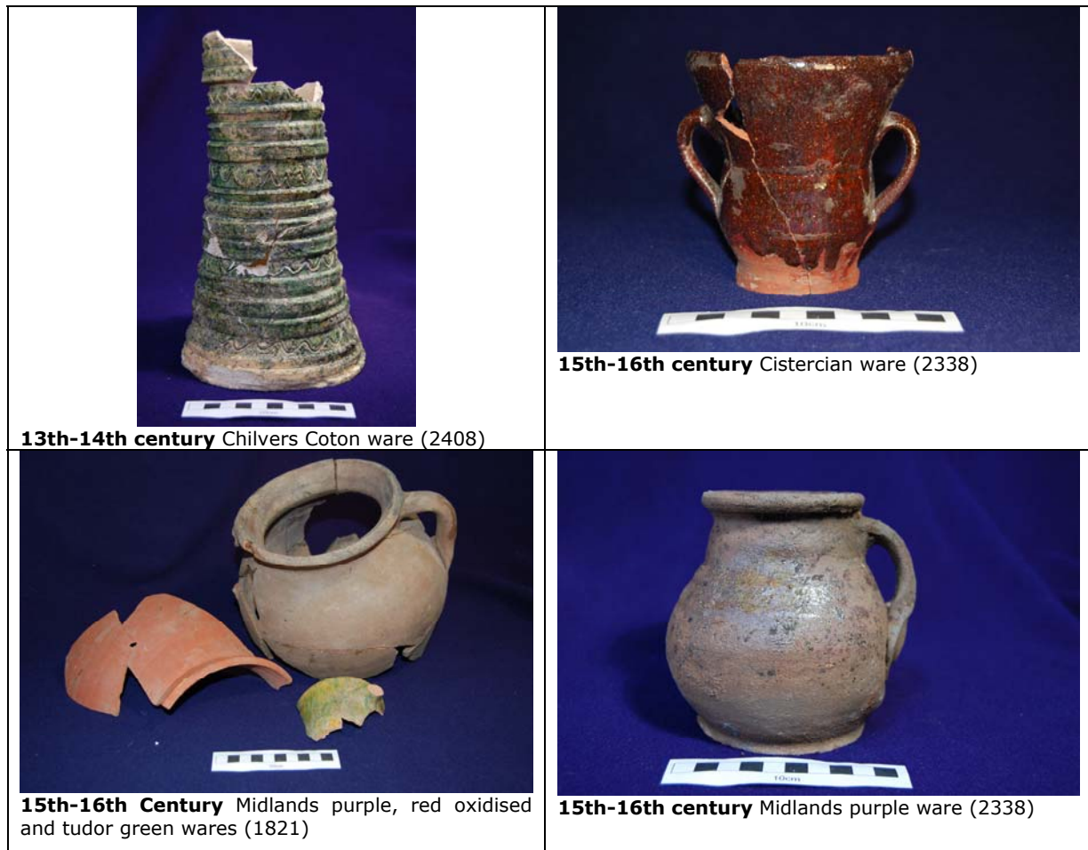
Plate 12: Reconstructed pottery vessels