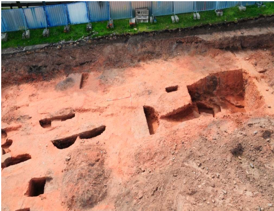
Plate 6: Southern part of site, including quarry pit 1922