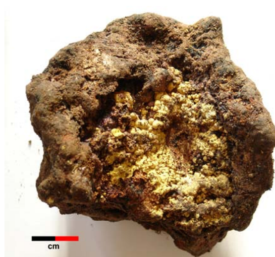
Plate 20 - Context 2200 - Hearth bottom with significant yellow residue. Scale : cm.