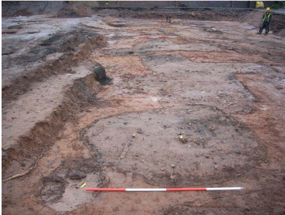
Plate 1: Unexcavated inter-cutting pits