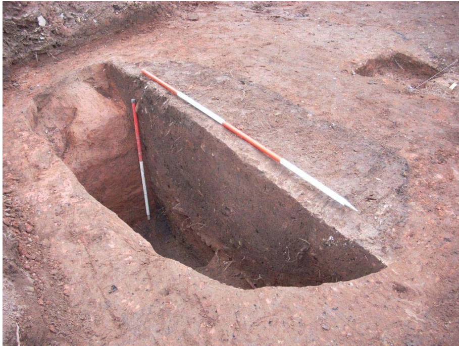
Plate 3: Example of homogenous fills within oval pit 1185