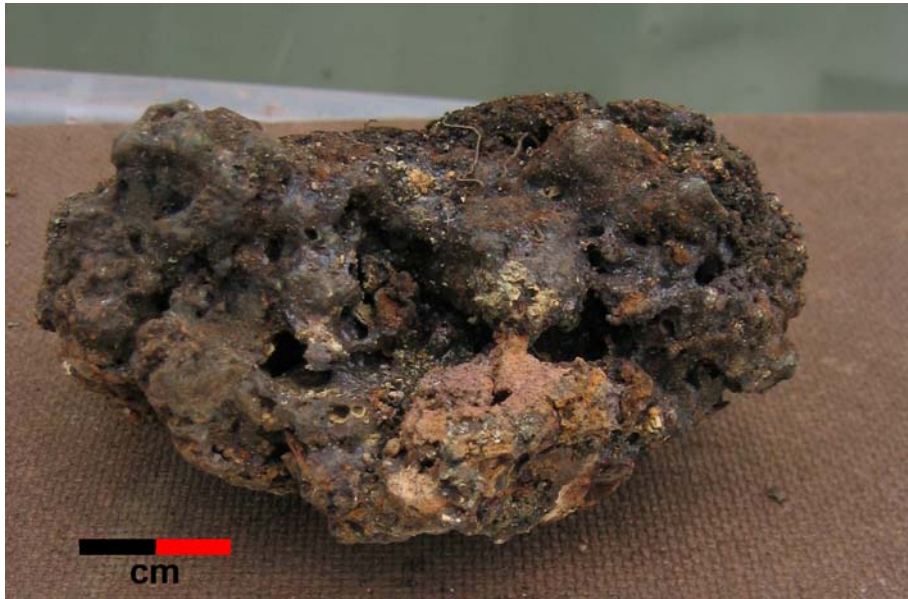
Plate 17 - Context 1728 - Amorphous, undiagnostic slag. Scale : cm.