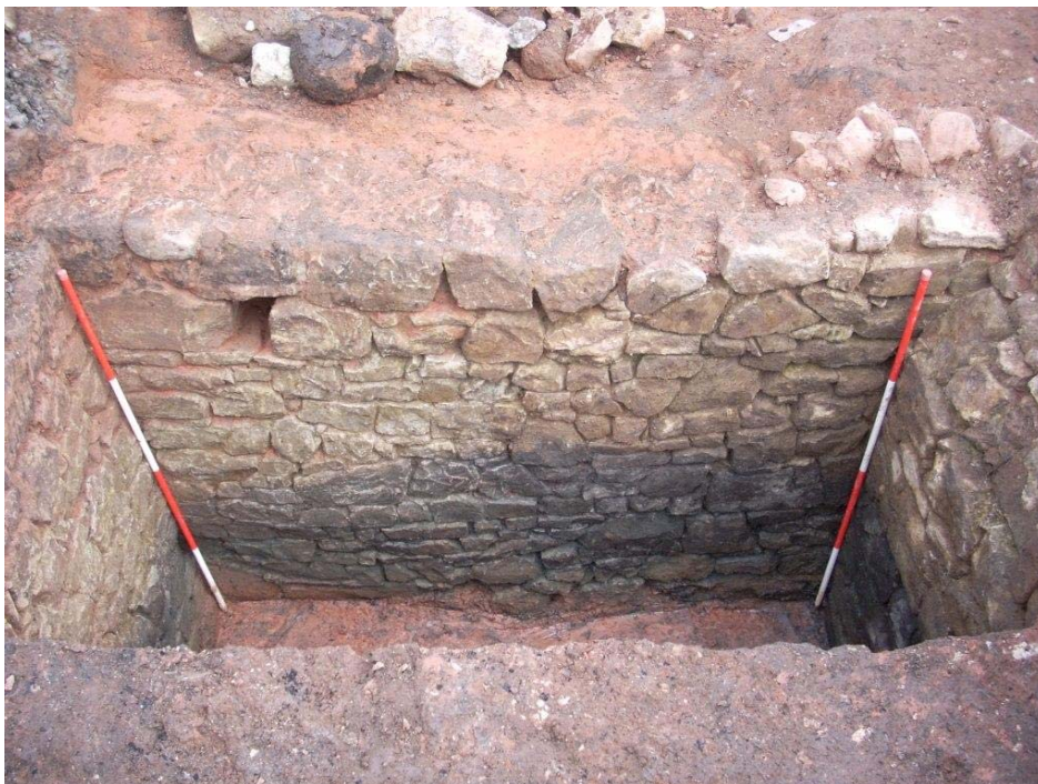
Plate 8: Deposit stained, stone built cess pit E (2338)