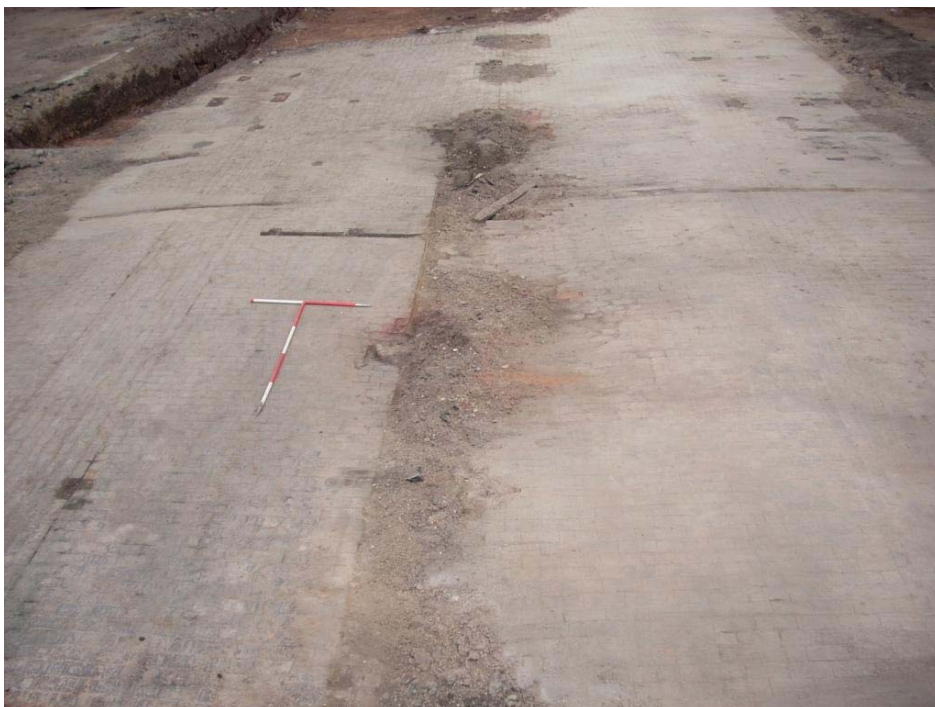
Plate 10: Early 20th century Ribbon Dye Works, floor surface 1080.