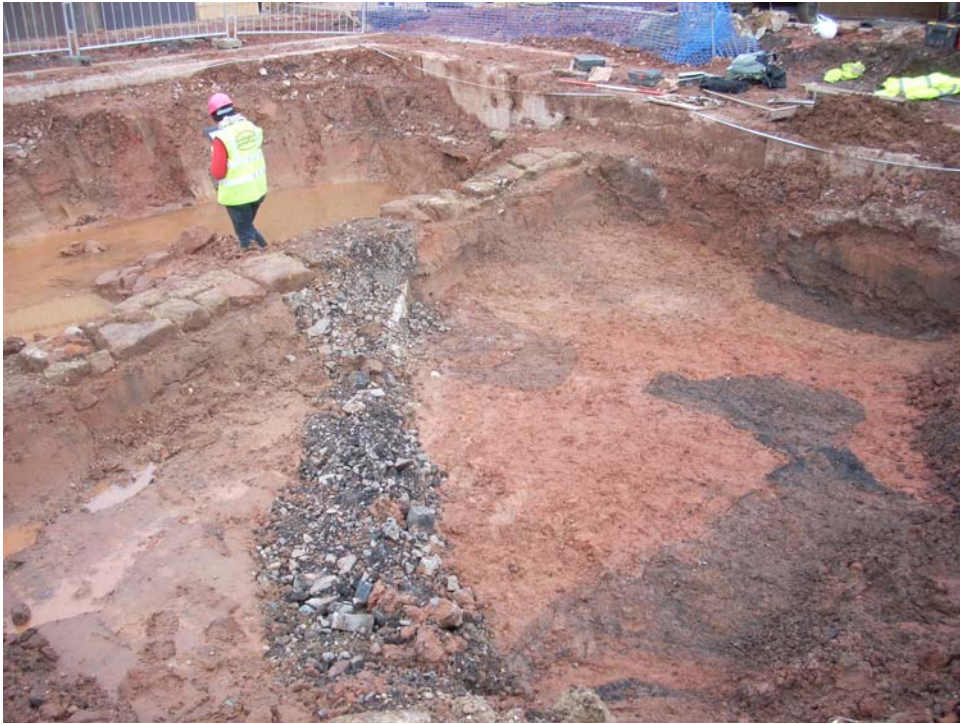
Plate 11: Salvage Recording area