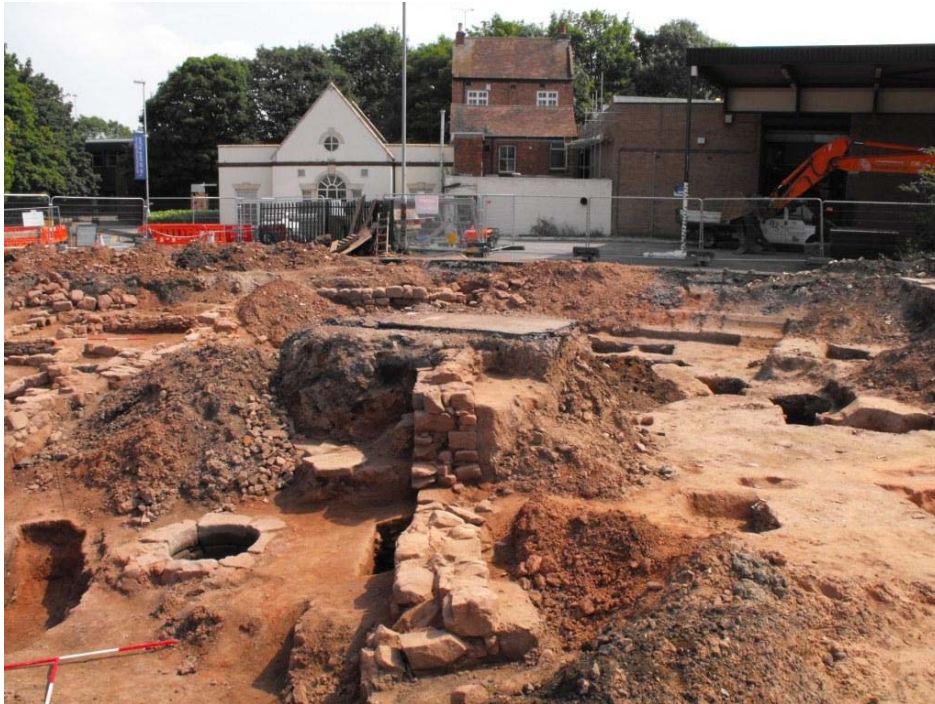
Plate 7: Continuity of medieval and 19th century plot boundaries