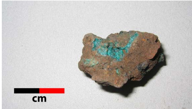
Plate 19 - Context 1562 - Blue / green non-ferrous working slag / corroded object. Scale : cm.