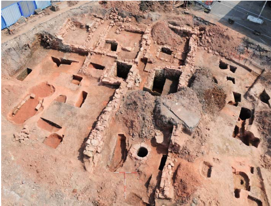
Plate 5: Northern part of site including 14th -15th century buildings and cess pits