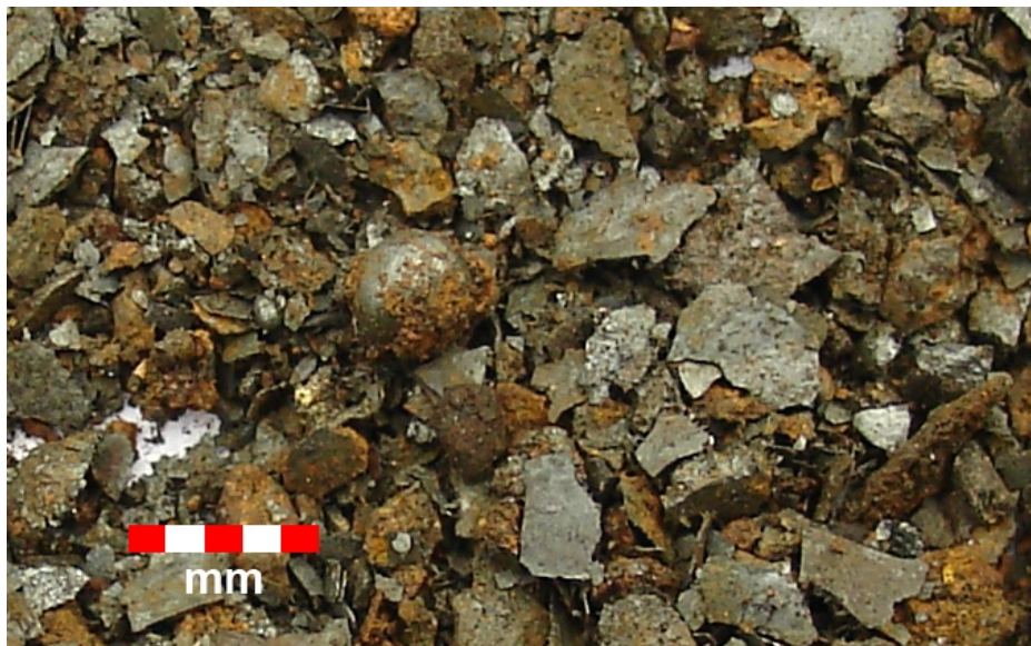
Plate16 - Context 1779 - Flake and spheroidal hammerscale. Scale : mm.