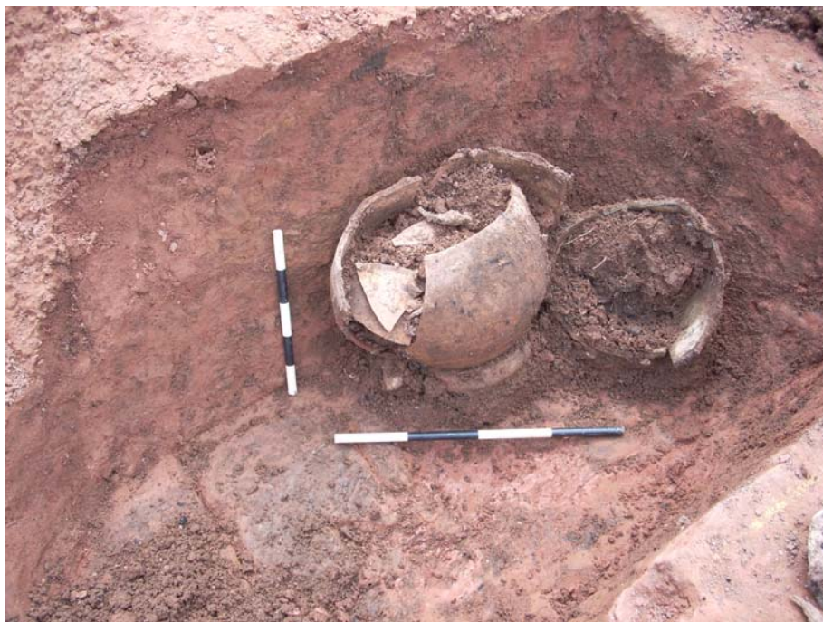
Plate 4: In situ storage pots within pit 1821