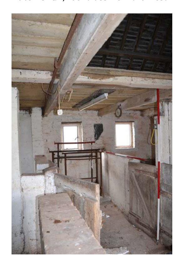
Plate 19: G3 from the north