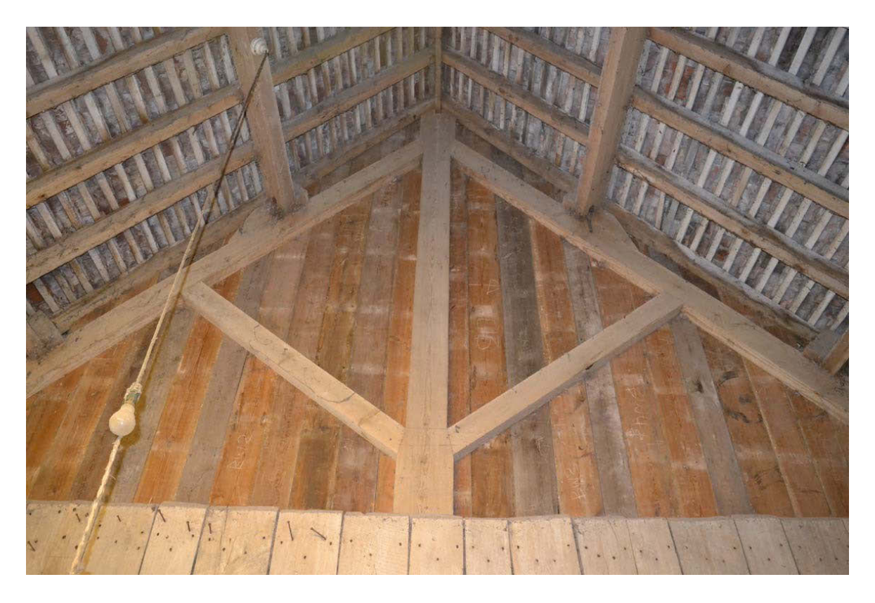
Plate 15: G1, roof truss from the west