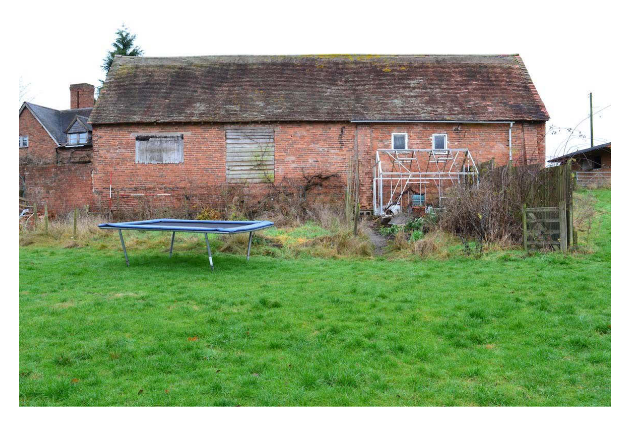
Plate 7: The building from the south