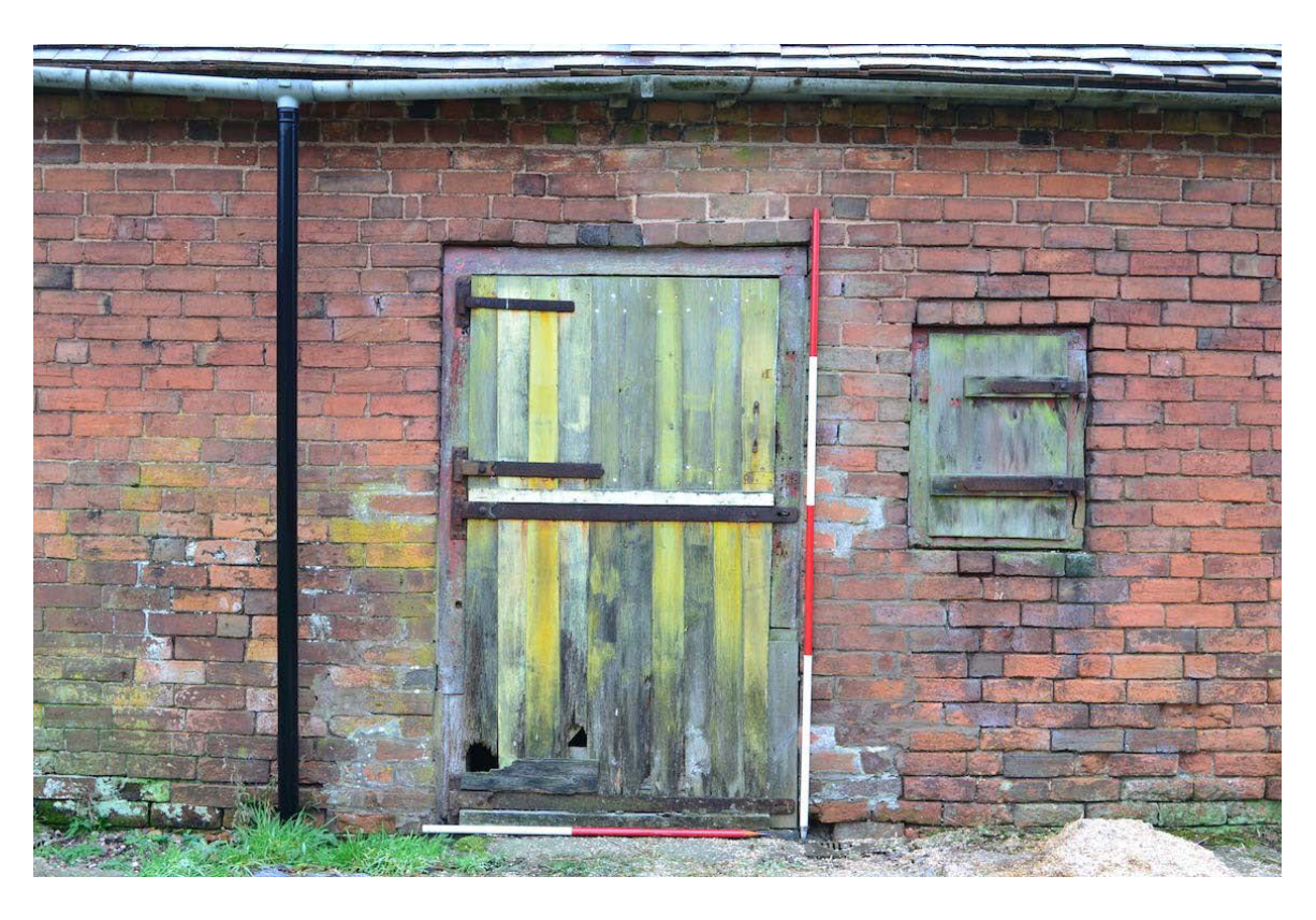
Plate 3: Western doorway and window from the north