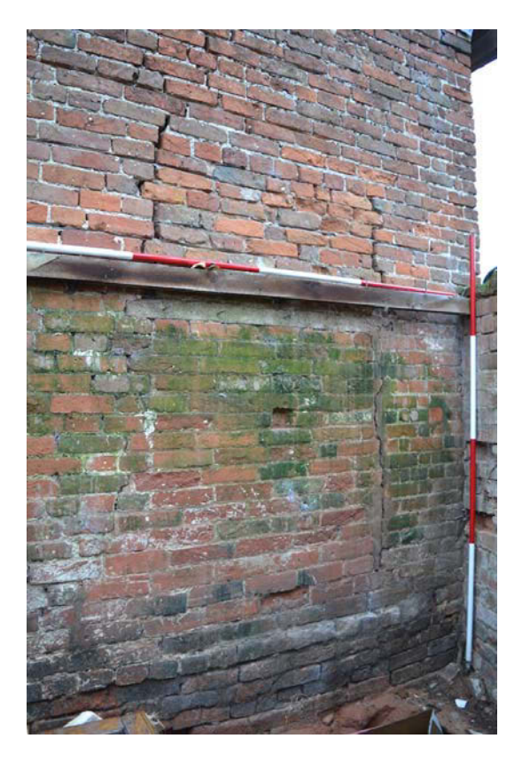
Plate 10: West elevation, anomalies in the brickwork