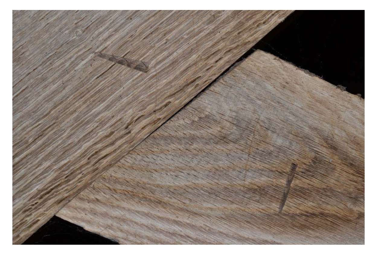
Plate 25: G4, central roof truss, junction of eastern principal and raking strut