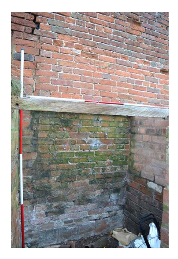
Plate 11: West elevation, anomalies in the brickwork