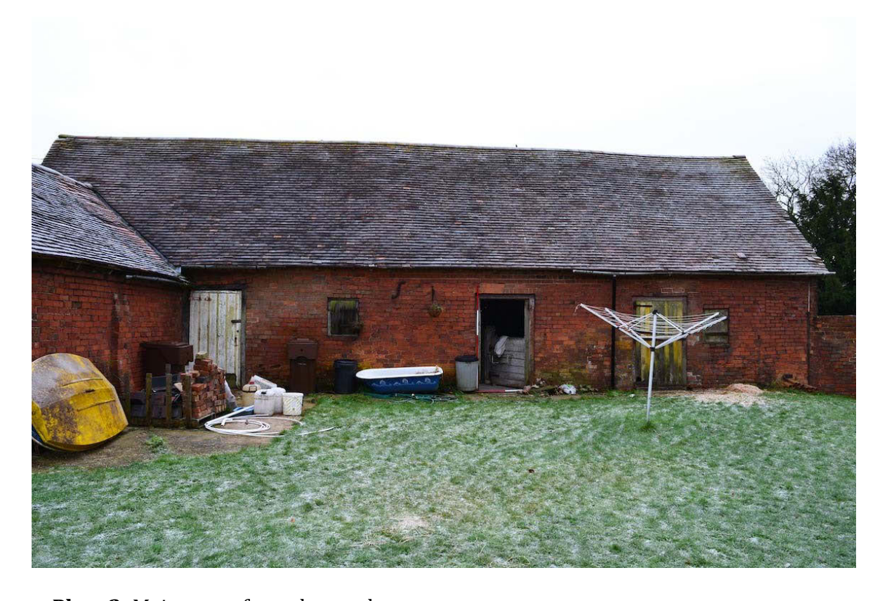
Plate 2: Main range from the north