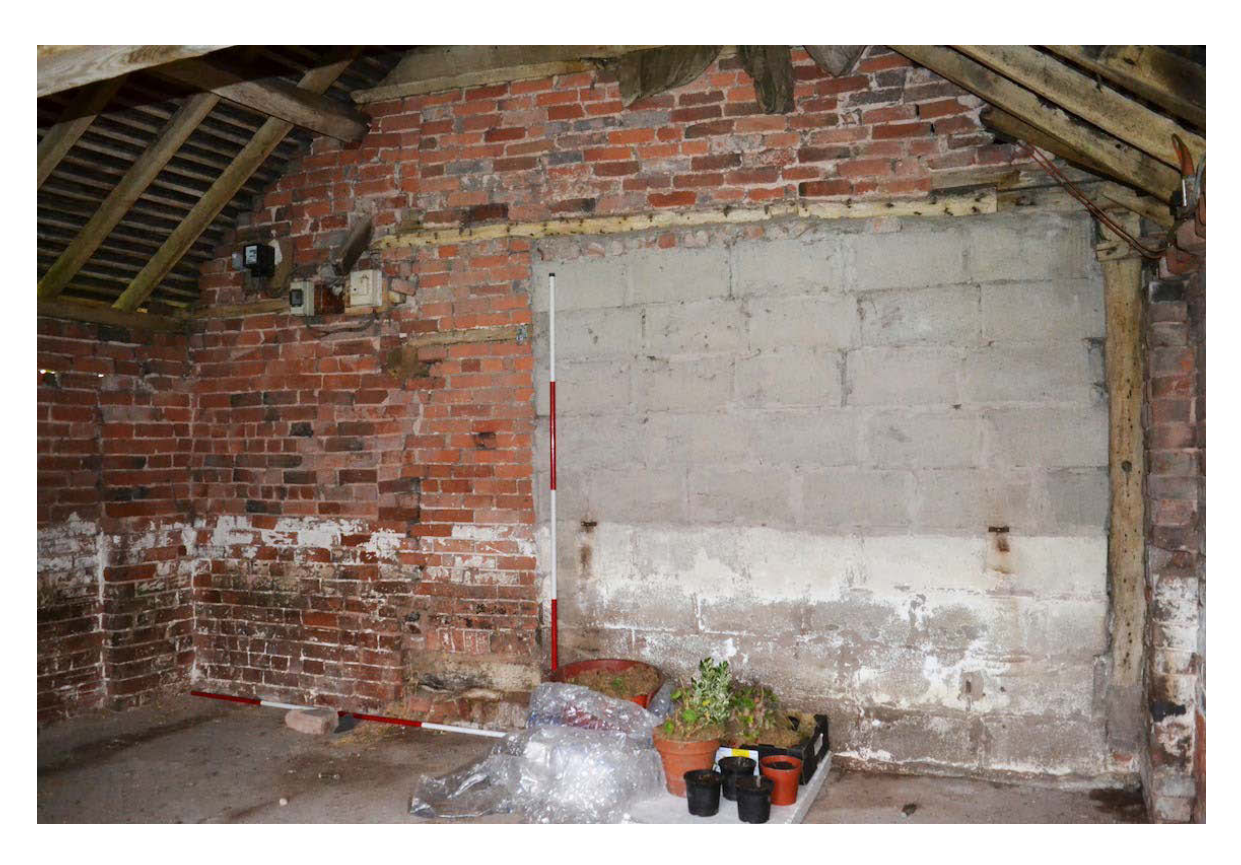
Plate 22: G4, south wall from the north west