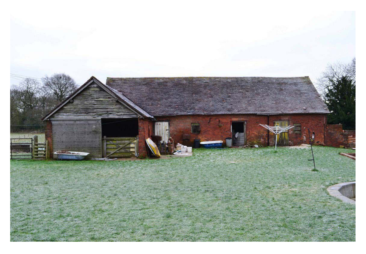
Plate 1: The building from the north