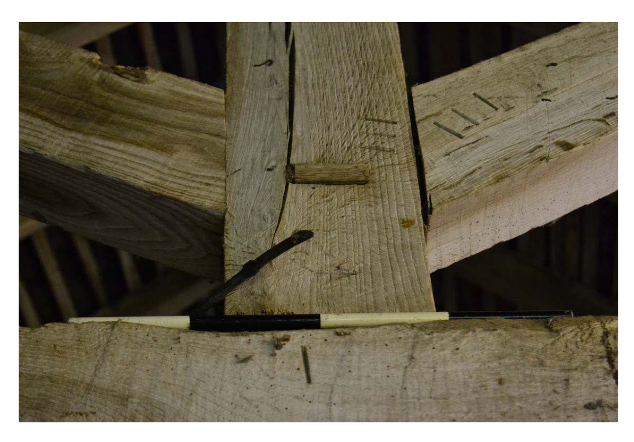
Plate 26: G4, central roof truss, junction of tie beam and king post