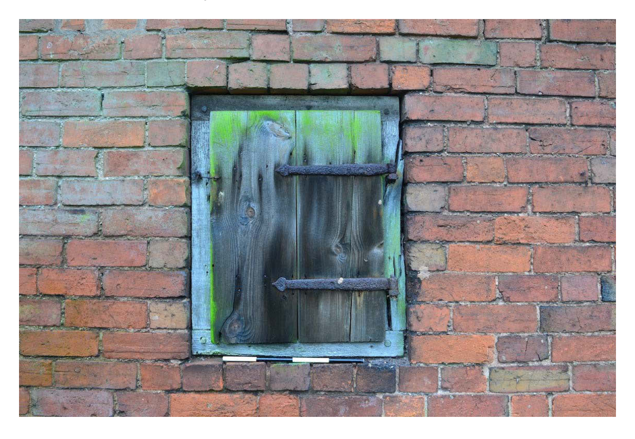
Plate 4: Eastern window from the north