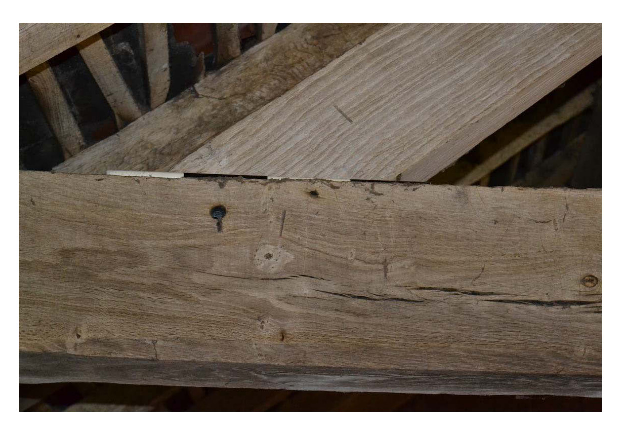
Plate 24: G4, central roof truss, junction of tie beam and eastern principal