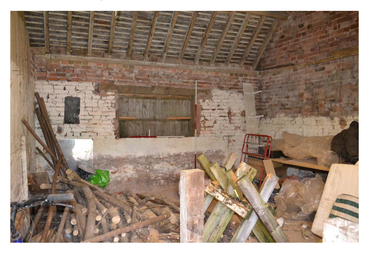
Plate 13: G1 from the north east