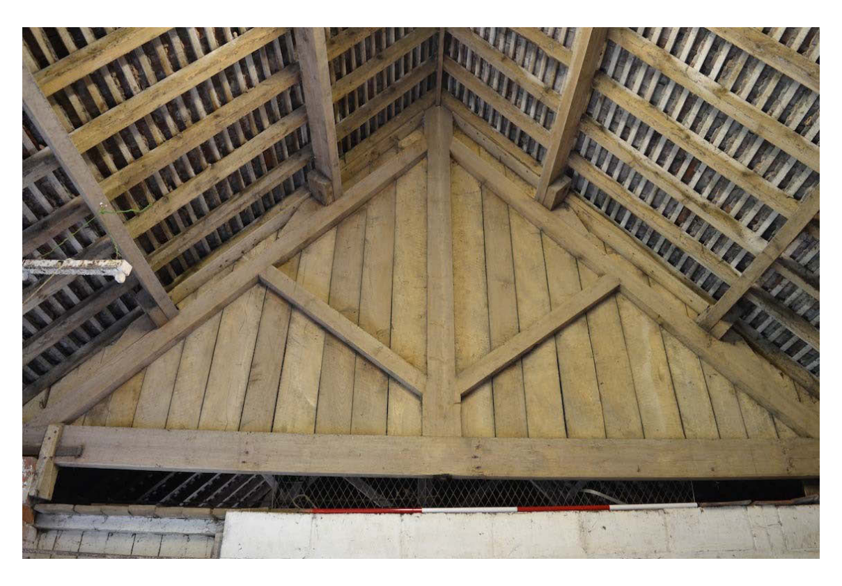
Plate 18: G2, roof truss from the west