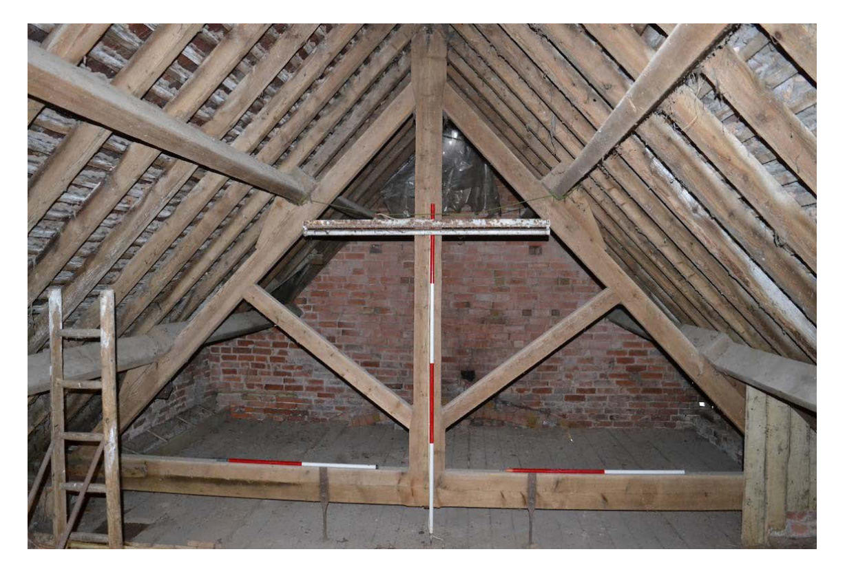
Plate 29: F1, roof truss from the west