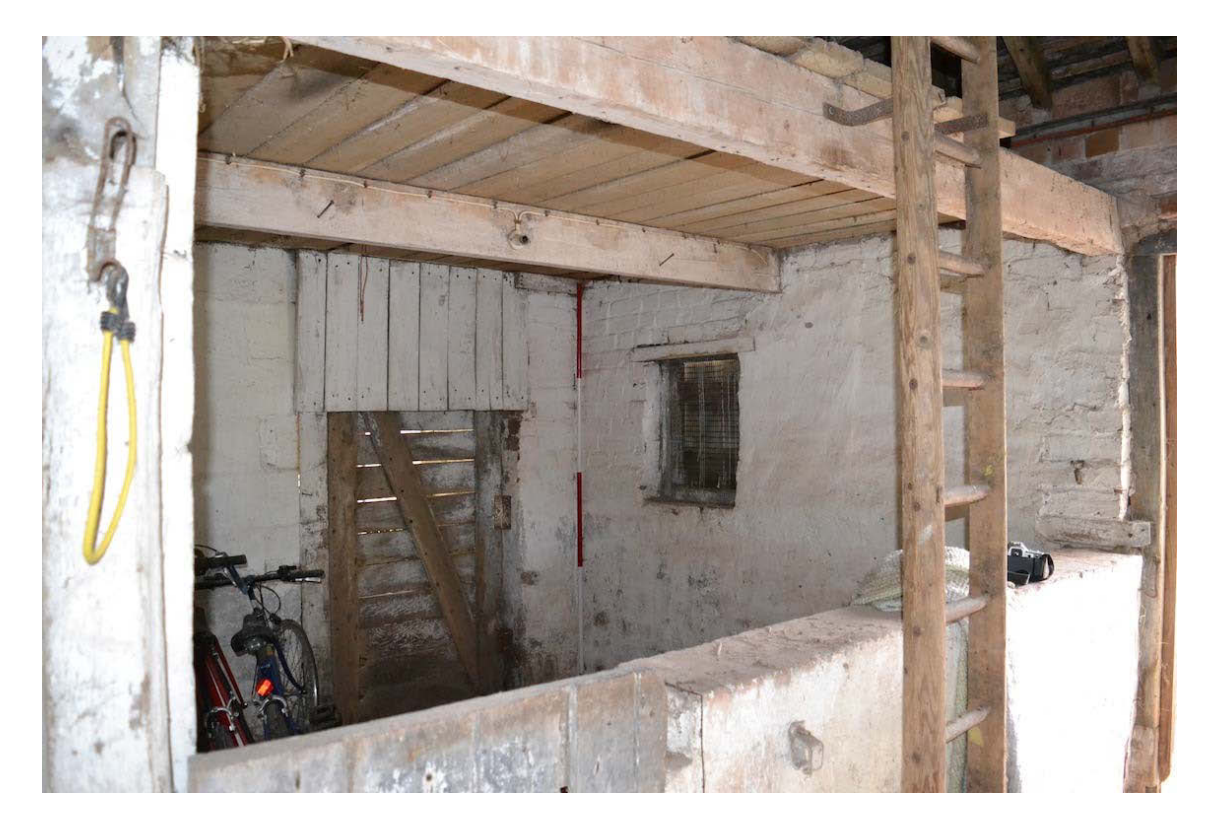
\textbf{Plate 21: G3}, \ doorway\ in\ western\ partition\ from\ the\ south\ east