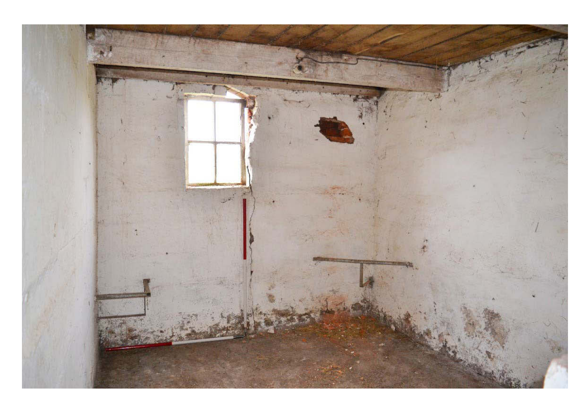
Plate 20: G3, south side of blocked cart entrance from the north west