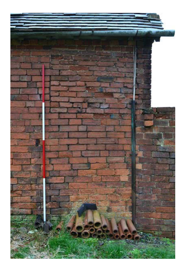
Plate 5: Brickwork joints from the north