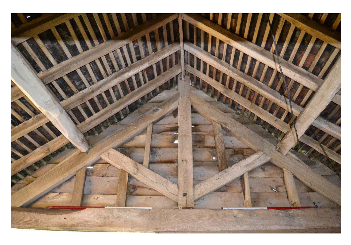
Plate 28: G4, north roof truss from the south