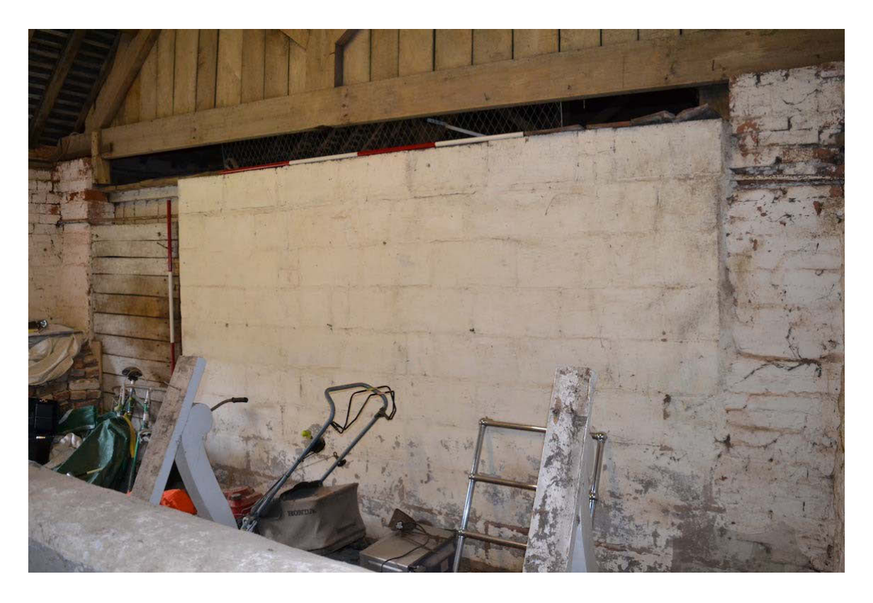
Plate 17: G2, eastern partition from the south east