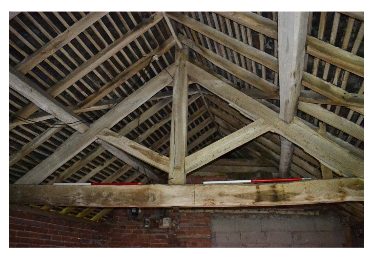
Plate 23: G4, central roof truss from the north