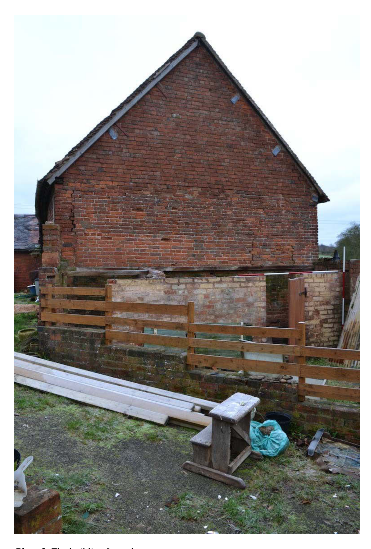
Plate 9: The building from the west