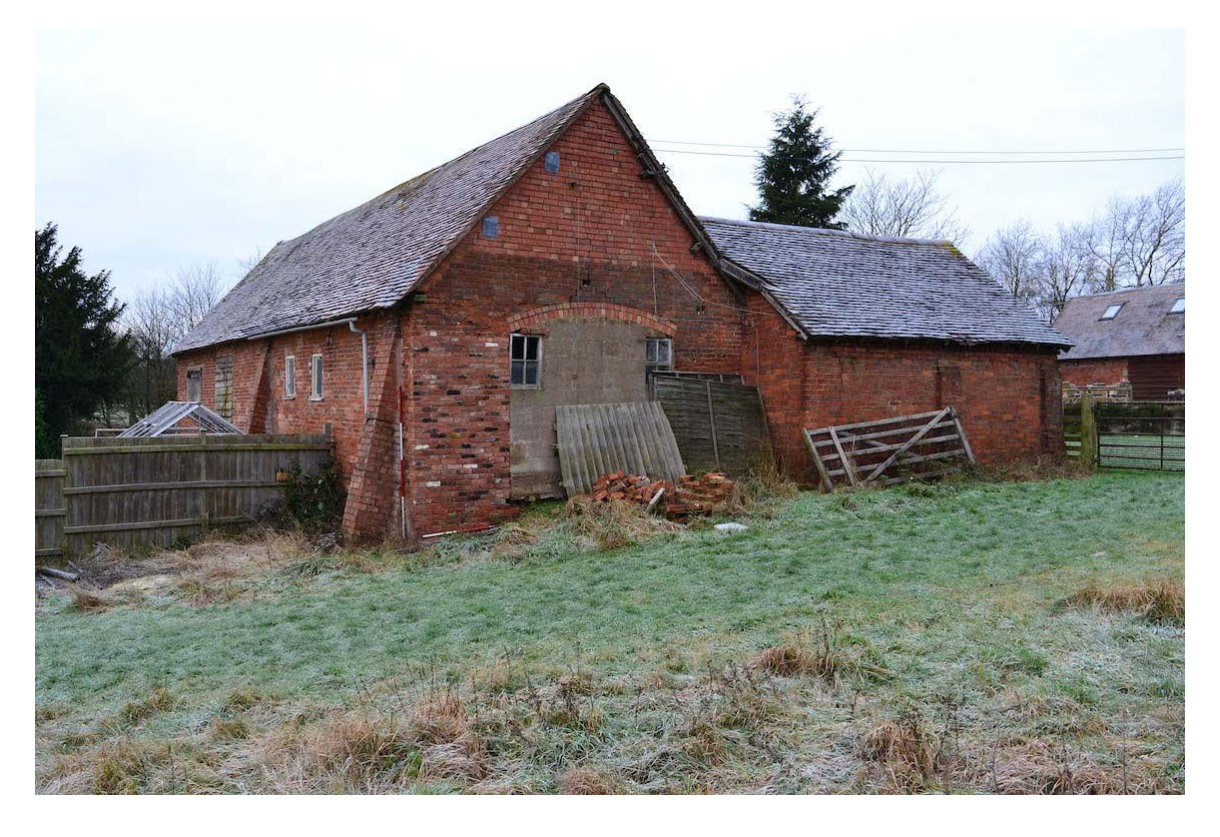
Plate 8: The building from the south east