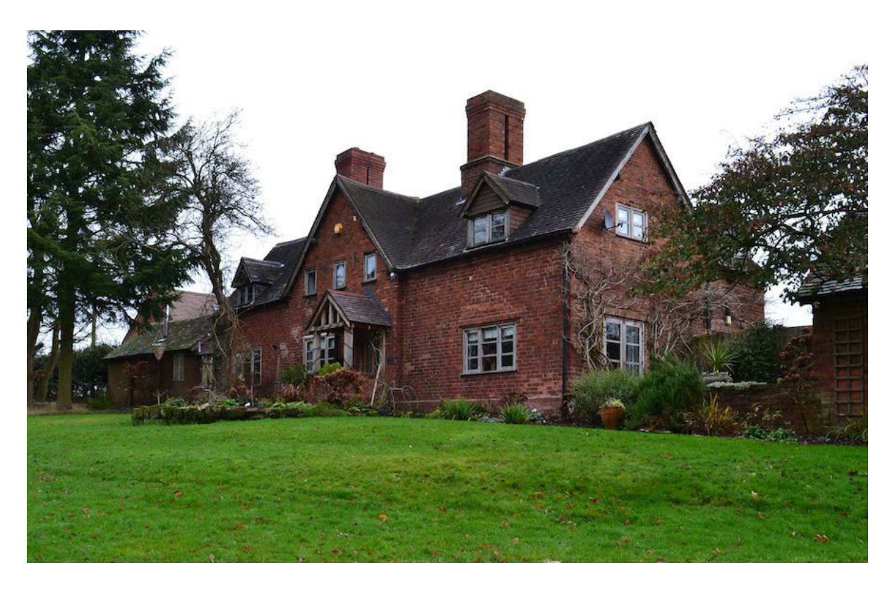
Plate 30: The farmhouse from the south west