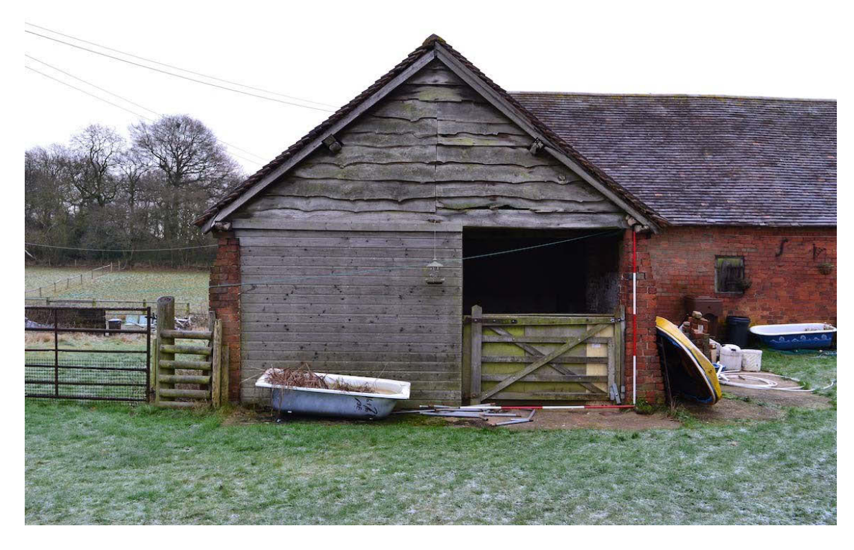
Plate 6: Cart shed from the north