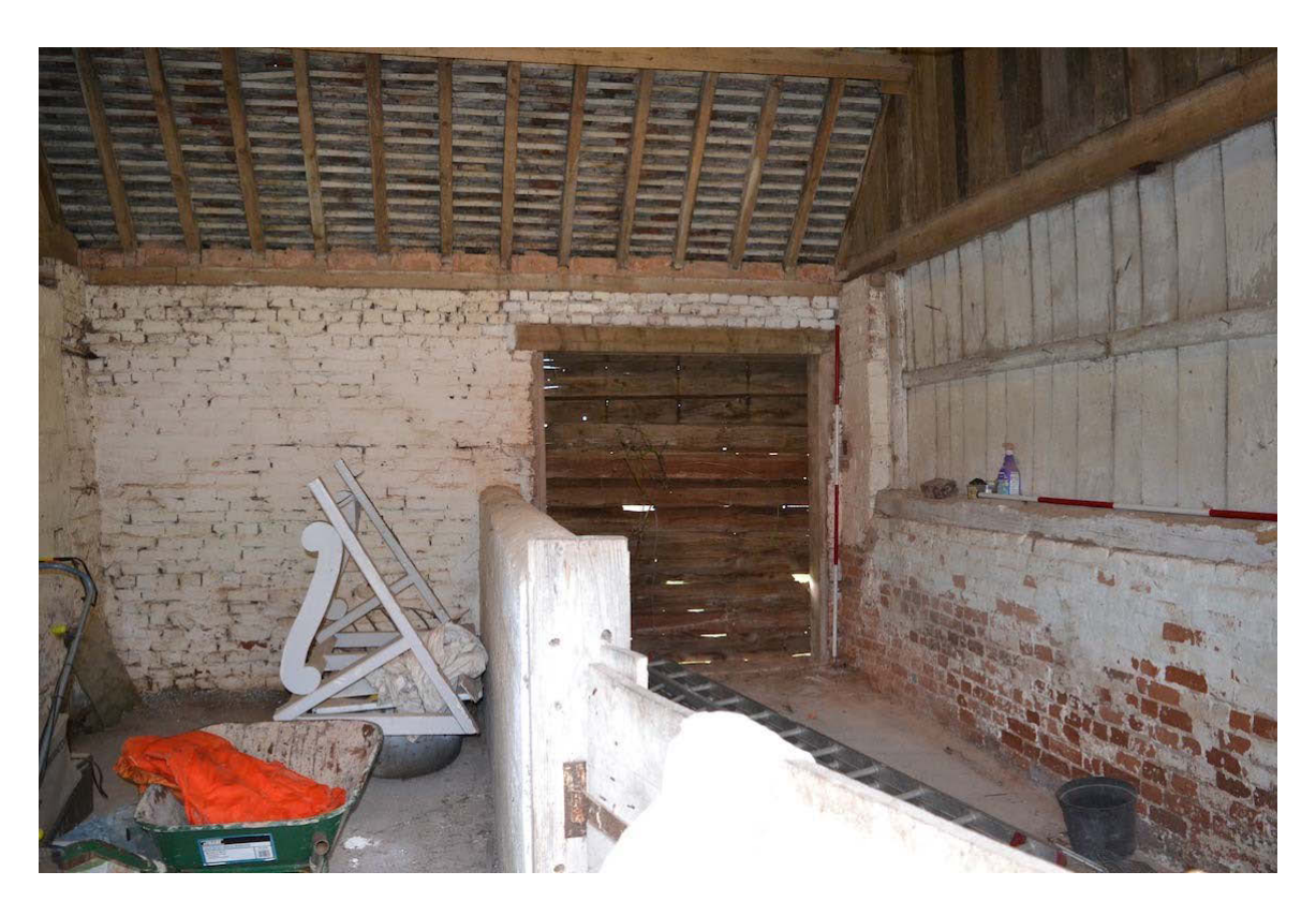
Plate 16: G2 from the north