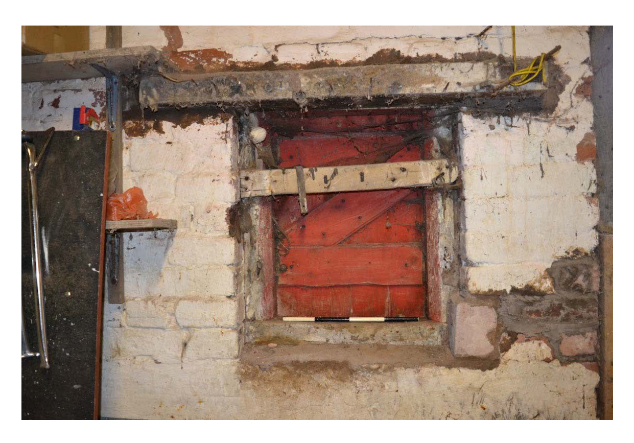
Plate 14: G1, window from the south