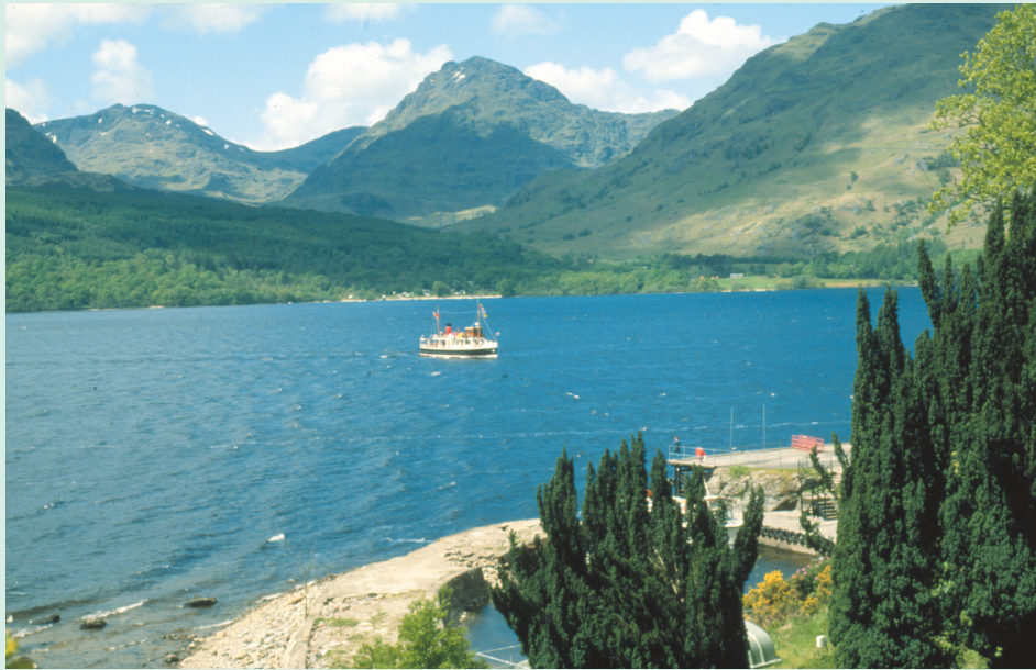
Inversnaid – linking Loch Lomond and the Trossachs.