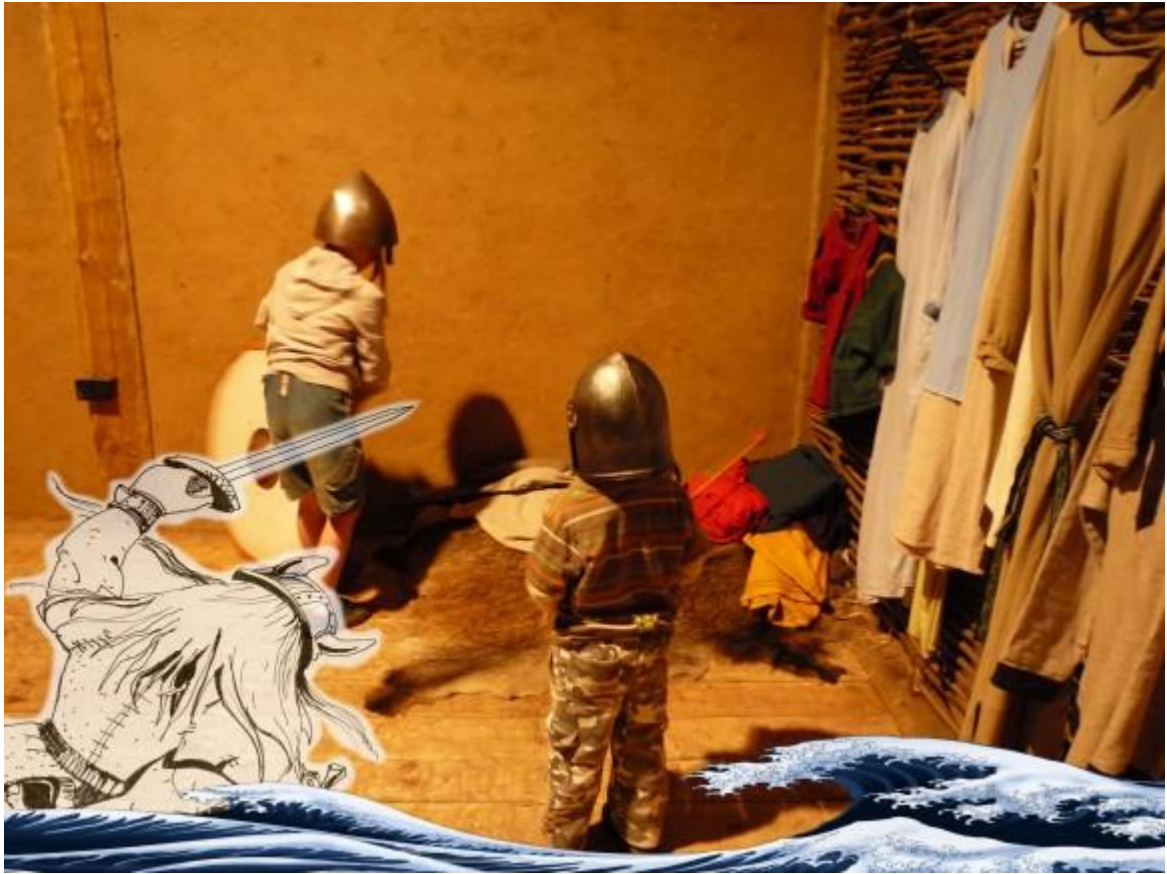
Museum lessons held in reconstruction of long house on Museum yard are very interesting.