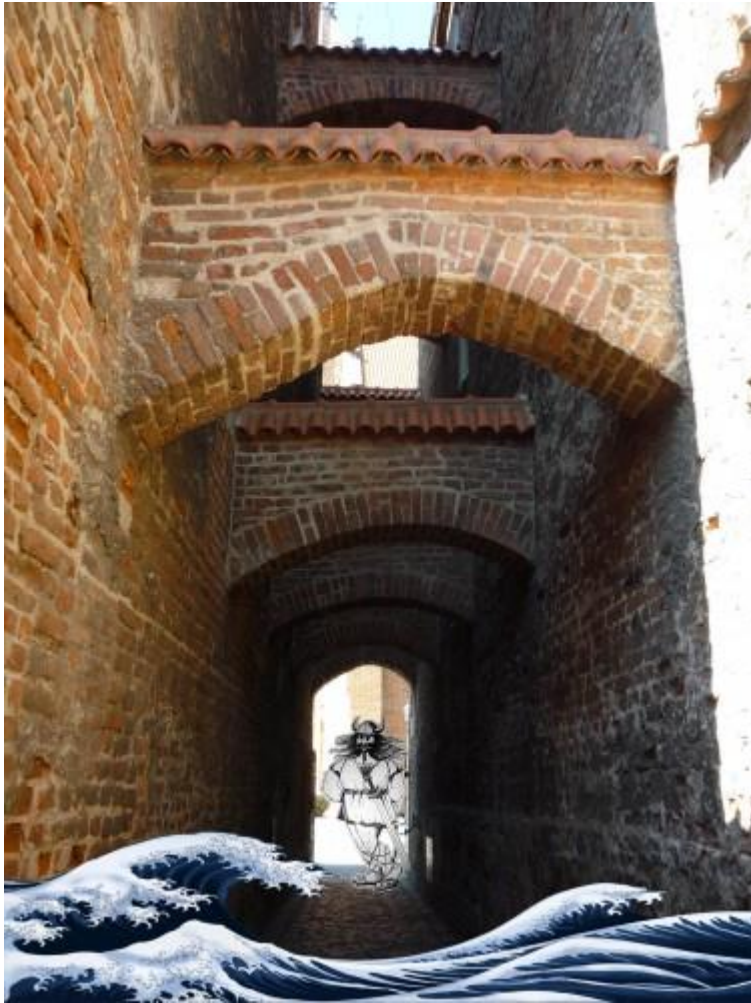
Church path with beautiful arcs makes everyone feel really medieval. I think It is the most charming place.