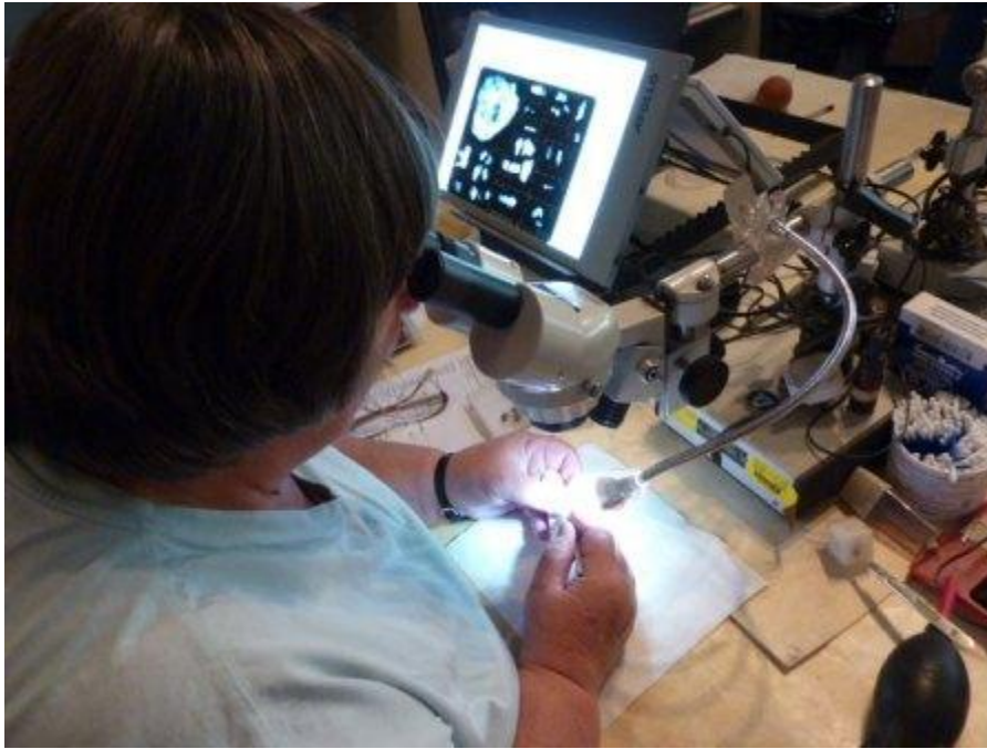
Investigative conservation of Anglo-Saxon grave goods