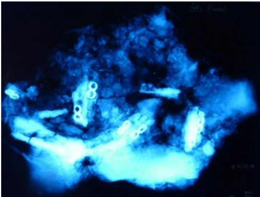
The X-ray radiograph shows copper, iron and bone - decorations sewn onto a tunic perhaps?