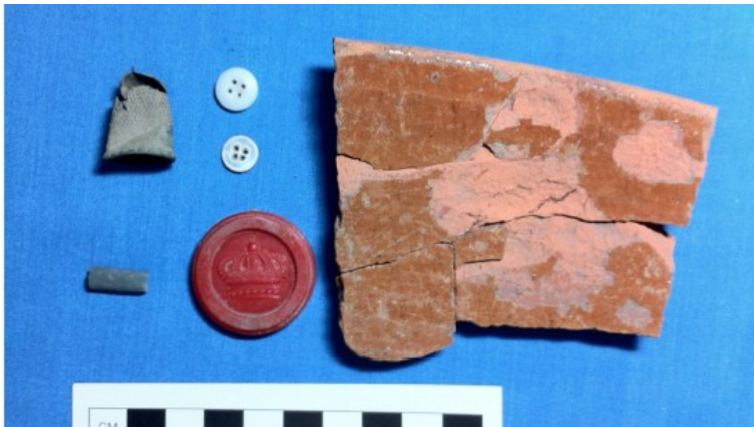
Some of the artifacts recovered from the Octagon House. A metal thimble, two buttons (glass and shell), a fragment of slate pencil, a plastic checker piece, and a fragment of a large milk pan.

Again we uncovered a lot more than anyone imagined, including the remains of a greenhouse that was attached to the octagon around 1900. The artifacts here were very different from those at the Grammes Brown house, which makes sense. Although both houses were built and occupied around the same time, the people living in the Grammes Brown house were wealthier than those who lived at the Octagon.