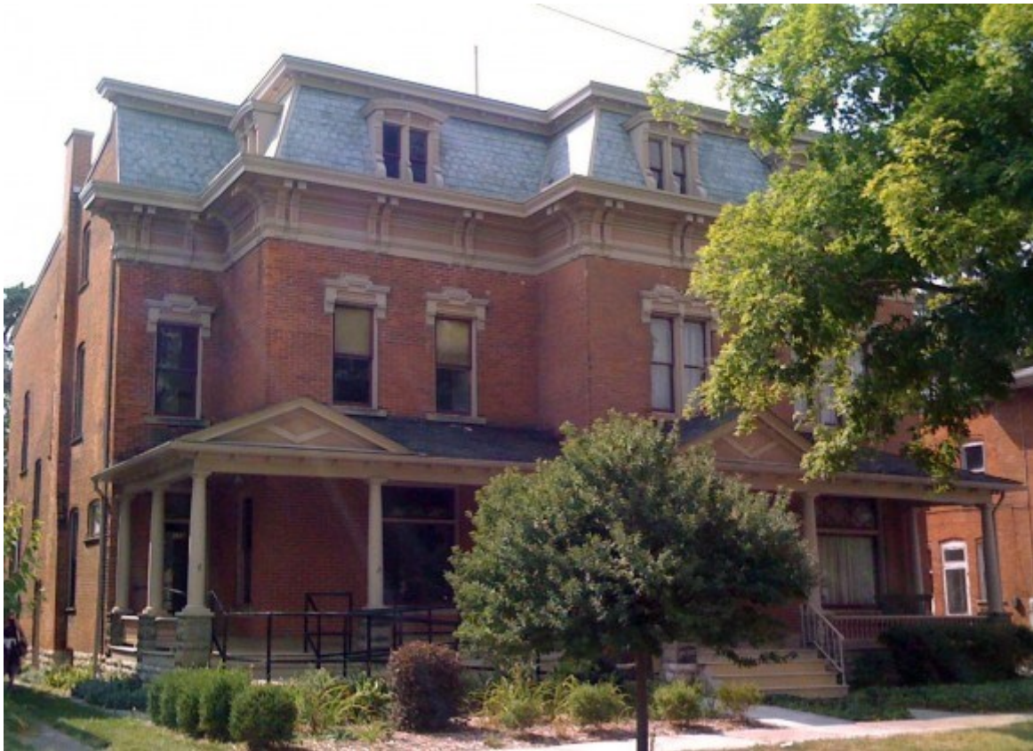
Grammes Brown House in Tiffin, Ohio – Headquarters of the Tiffin Historic Trust

My Day of Archaeology began with a trip to the local historical society. I delivered two boxes of artifacts and a report that detailed the weekend excavation conducted with my Intro Archaeology class right in their back yard.