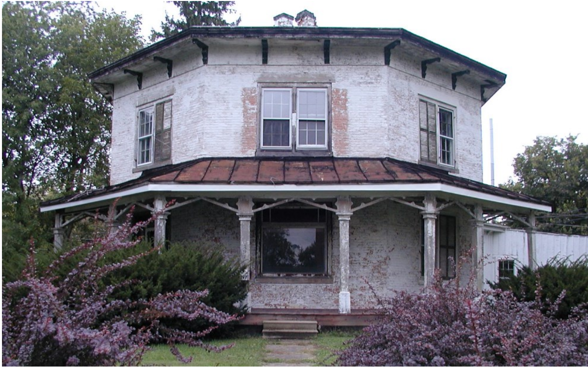
Octagon House – located on the campus of Heidelberg University

Again we uncovered a lot more than anyone imagined, including the remains of a greenhouse that was attached to the octagon around 1900. The artifacts here were very different from those at the Grammes Brown house, which makes sense. Although both houses were built and occupied around the same time, the people living in the Grammes Brown house were wealthier than those who lived at the Octagon.