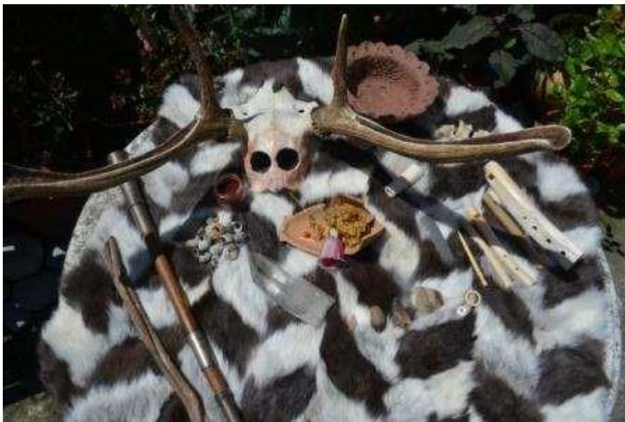
A full view of my shamanic toolkit so far. Includes: shaman's staff on the left; antler headdress with added ochre; pottery; bone flutes and whistles; flint implements; quartz; beads and organic materials; perforated shells; animal skin.