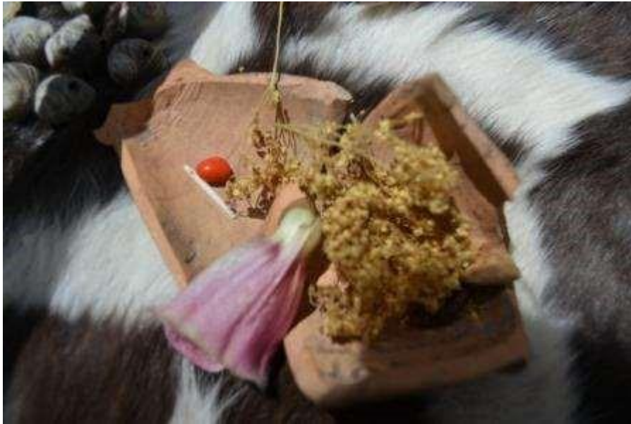
Detail of a shamanic offering, it's interesting to experiment here...