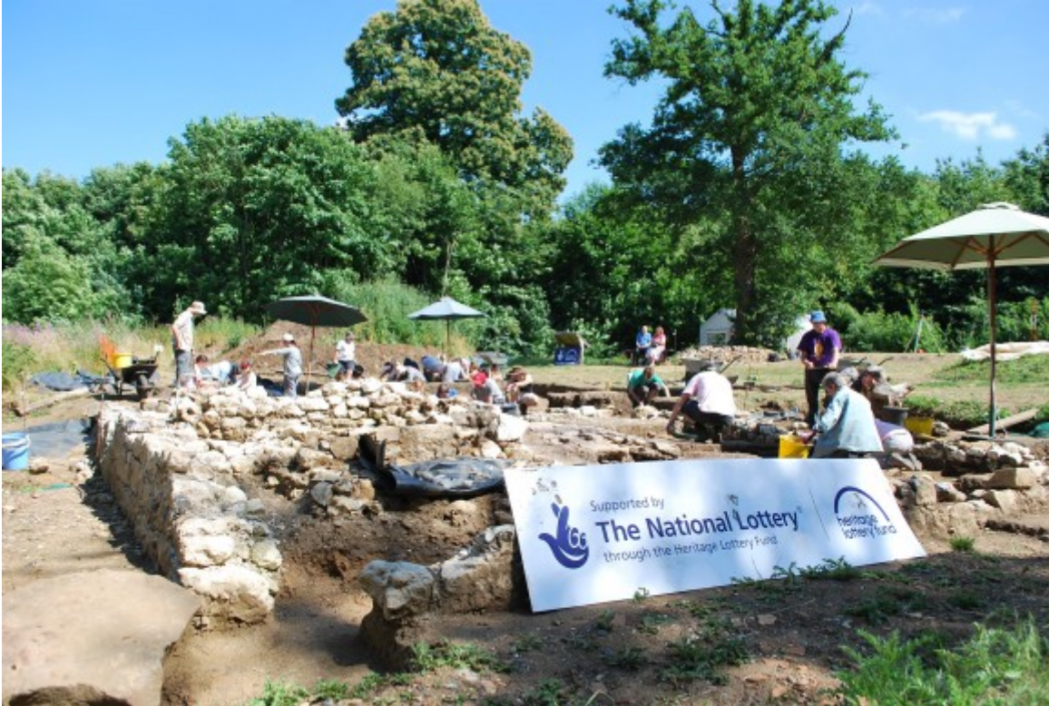
Randall Manor, Kent, 2013