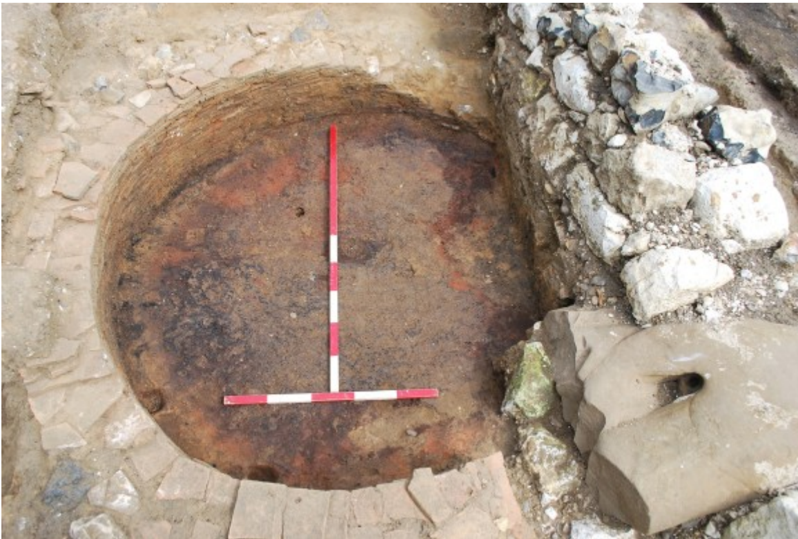
Possible Bread Oven

Lots of pictures at http://www.facebook.com/archaeologyinkent . Contact andrew.mayfield@kent.gov.uk for further info!