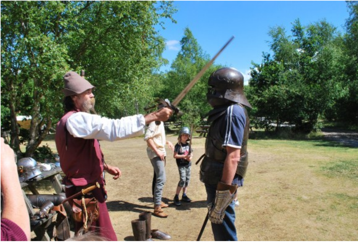
Knighting at Shorne Woods with the Woodvilles