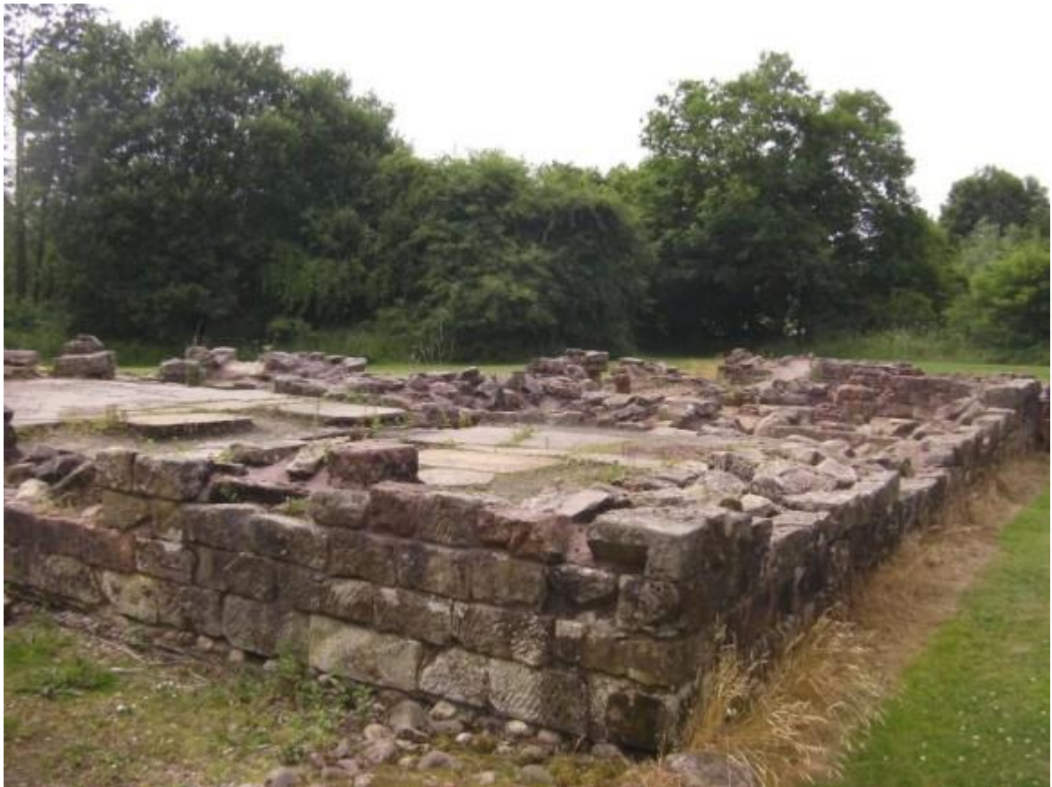
View of Bothwellhaugh Bath House.