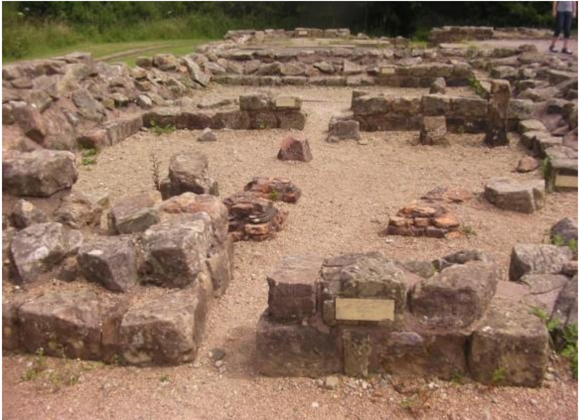
View of Bothwellhaugh Bath House.