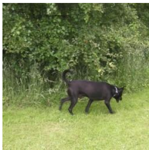
The author's dog, Cosmo, at the site of Bothwellhaugh Bath House.

July 26, 2013 Historic Environment Scotland Archaeological Prospection , Day of Archaeology 2013 #myarchaeology , Bothwellhaugh , Bothwellhaugh Roman Bath House , Bothwellhaugh Roman Fort , RCAHMS , Royal Commission on the Ancient and Historical Monuments of Scotland , Scotland , Scottish Archaeology