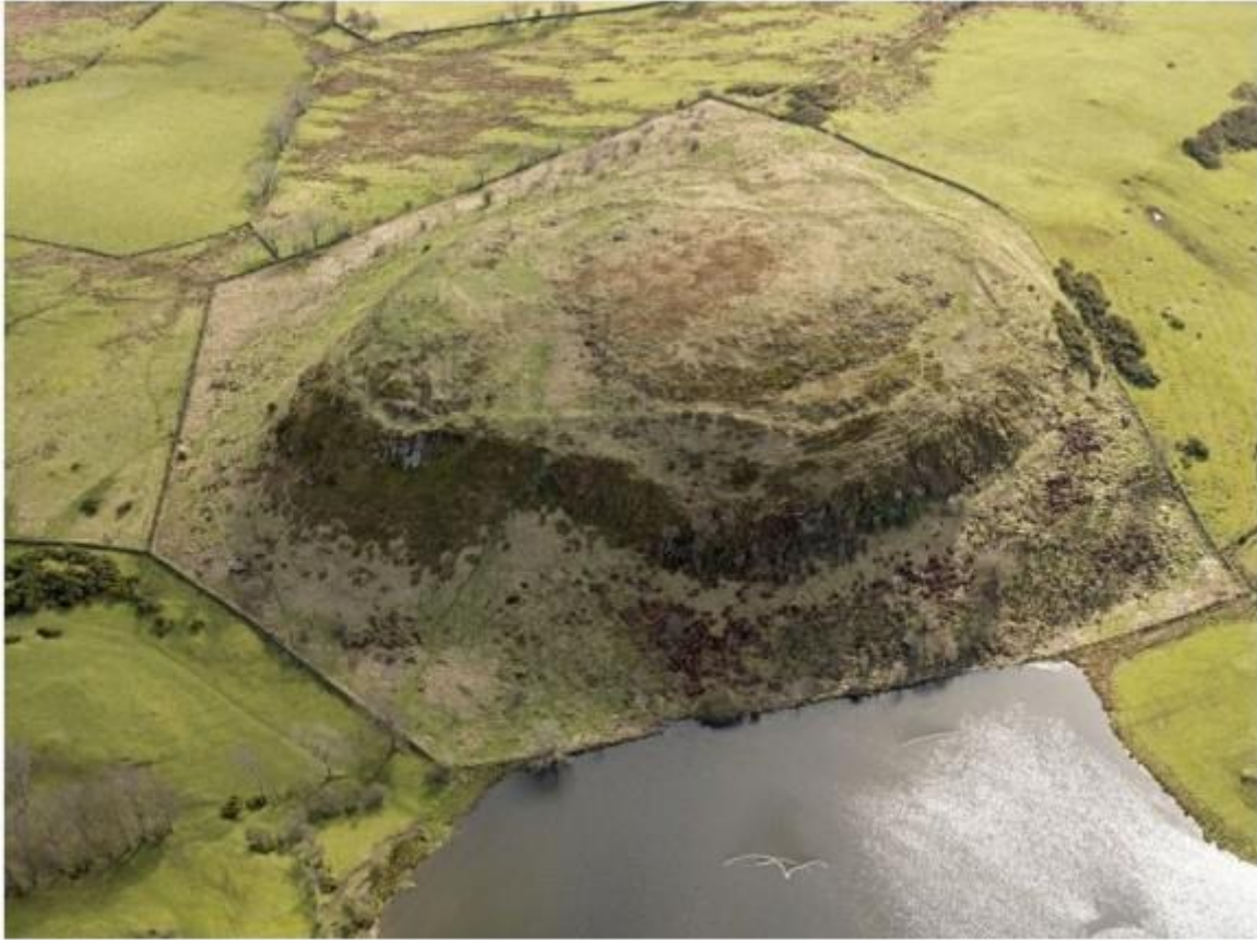
Aerial view centred on the remains of Duncarnock fort, taken from the NW. Copyright RCAHMS (DP04015)

This is what I've chosen for Day of Archaeology, but why not tell us your favourite archaeological sites in Scotland on Twitter using #MyArchaeology .