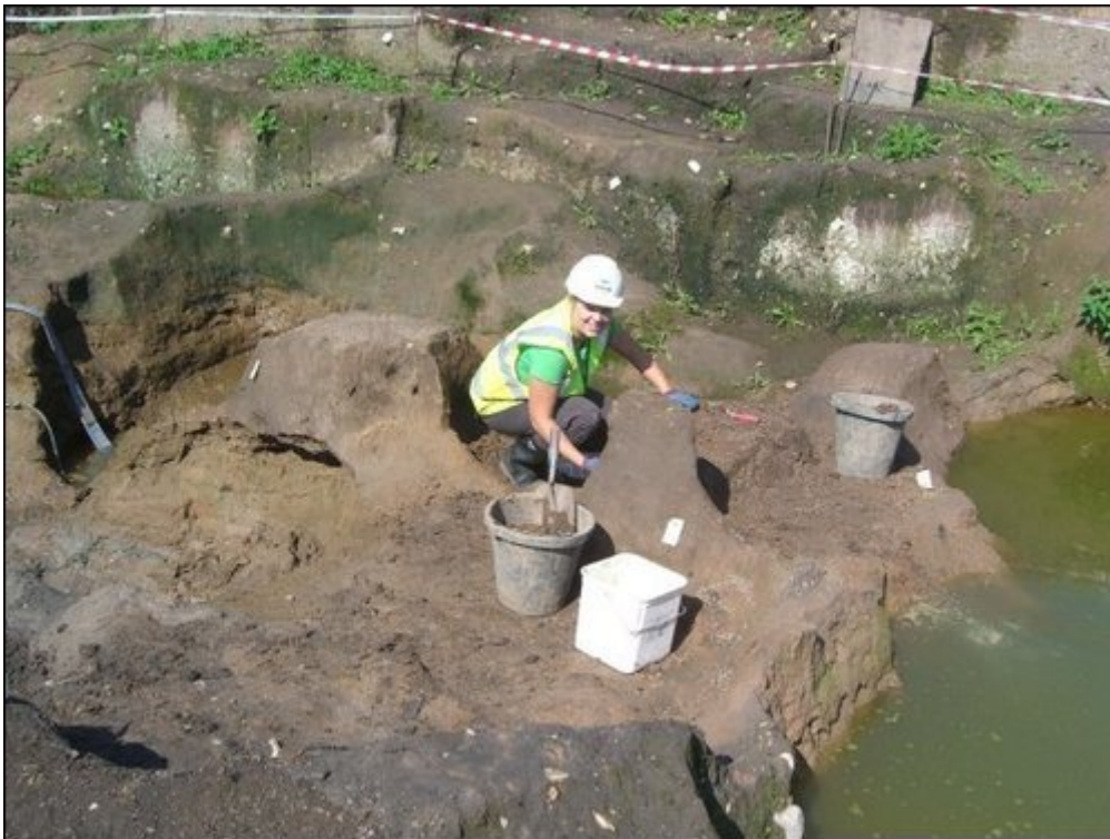
Dangerously close to that murky water!

I studied Archaeology at Glasgow University, and then went on to complete a Masters in Professional Archaeology there as well. As a student, I volunteered as a placement supervisor on the Hungate site in York with York Archaeological Trust. Working with YAT gave me the best crash course in field archaeology I could have asked for. Although I think the biggest thing I took away was that I preferred to work indoors!!