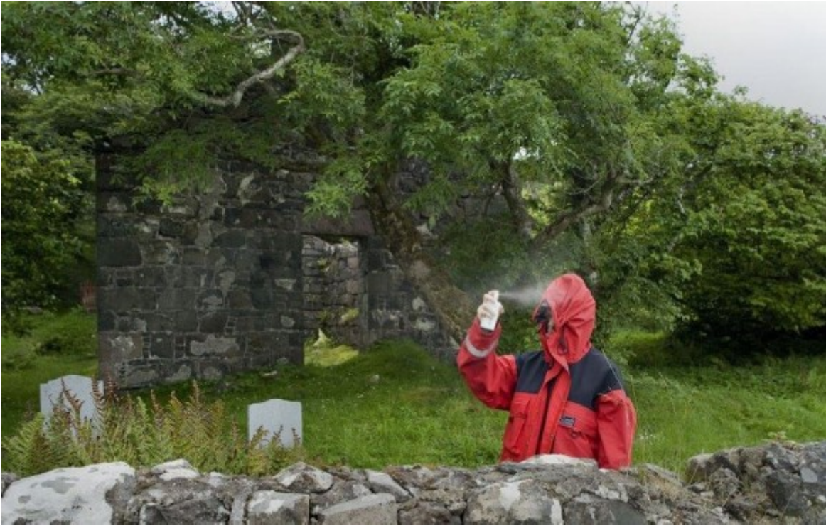
Wish I hadn't said yes here, too many midges!