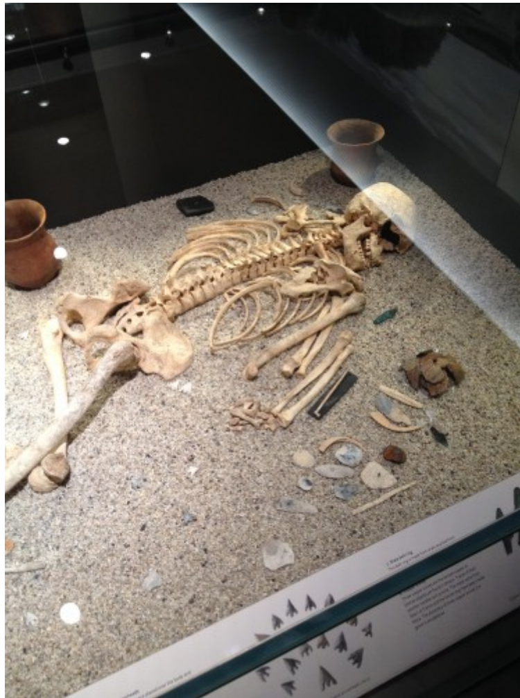
The Amesbury Archer

On to yesterday then. In the morning I had an hour or so of working at home, catching up with e-mails and sorting out payment for one of my suppliers who has been making replica objects for our Neolithic houses at Stonehenge. A surprising amount of my time is taken up with such paperwork. I'm also reviewing the interviews that I took part in yesterday – we interviewed three exhibition design companies for a desperately needed new interpretation project at Tintagel Castle. That's my project for the next year or so – a new exhibition and lots of new interpretation for the castle and island. Of the three companies two were very good, so I created a positives and negatives list for each, coming to my own conclusion about which one to appoint.