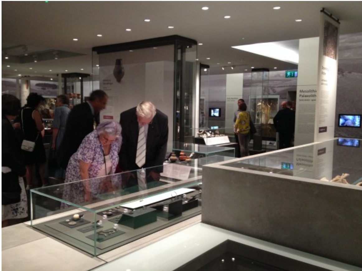
The new Wessex galleries at Salisbury Museum