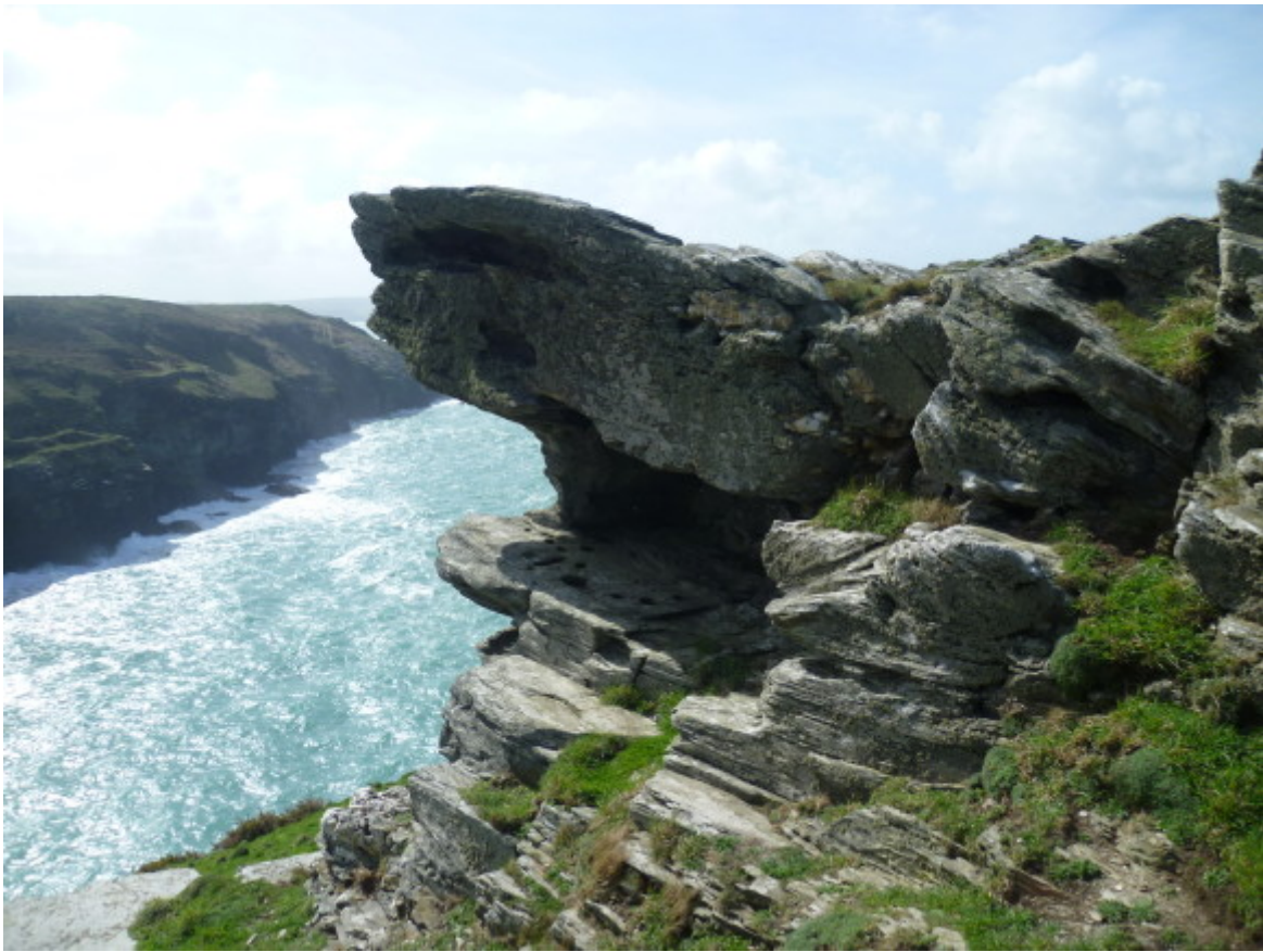
Arthur's Seat, Tintagel (I do get to work at some lovely places!)

At 9.30am I left to drive to Stonehenge, to meet a party of 39 staff from the British Museum – curators, keepers and exhibitions staff. They have organised a team trip to Stonehenge, and I met them, showed them around the exhibition and Neolithic houses, and then left them to walk or take the land train down to Stonehenge.