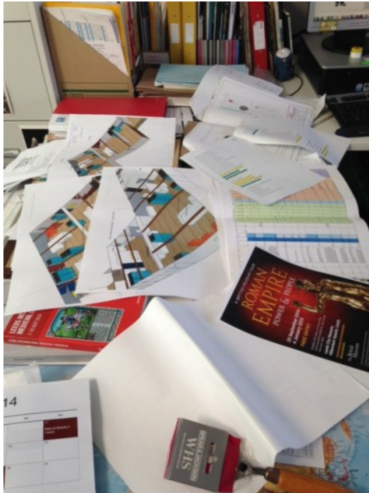
It's not normally this messy!

Even though I'm working on something specific today, there really isn't a 'typical day' being the archaeology curator at Leeds Museums and Galleries. Take my desk for instance – right now it looks like this (it's not normally this untidy):