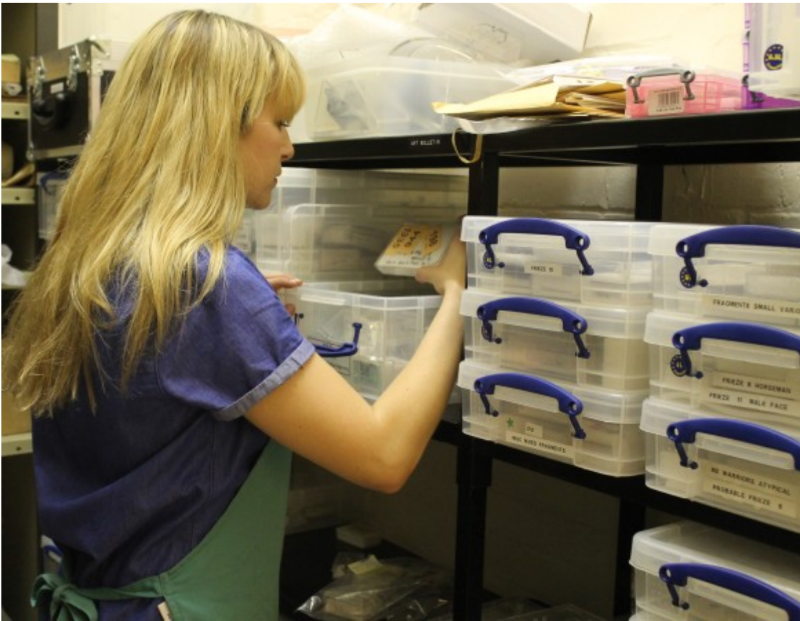
Collecting objects from the safe

We are currently in the process of grouping associated fragments, so we can join and rehouse them together. This ensures the pieces are kept together for future study and has the added benefit of reducing storage space.