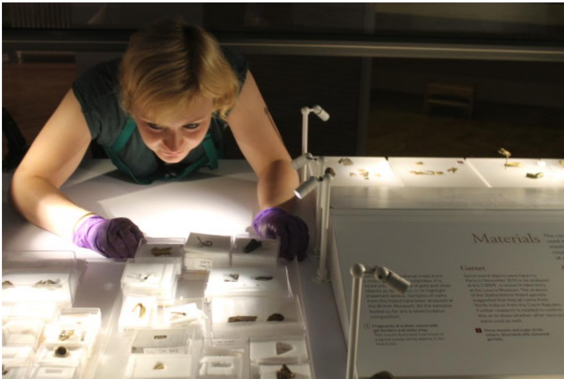
Removing pommels from the display case

Our first task the morning before the museum opened to the public, was to access the cases in the Hoard Gallery and remove some objects we are preparing for catalogue photography.