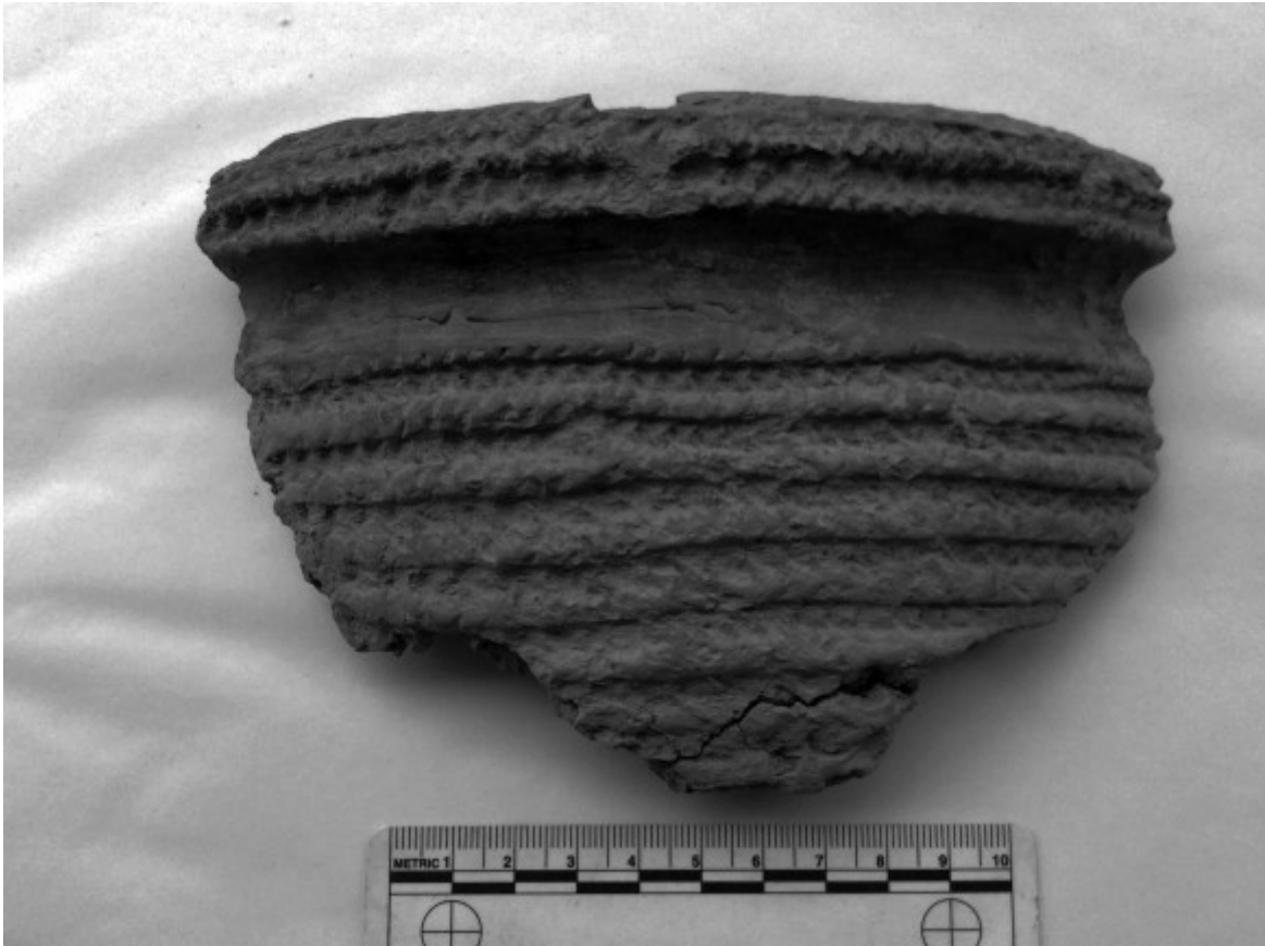
neolithic pottery from a Neolithic settlement site on Anglesey