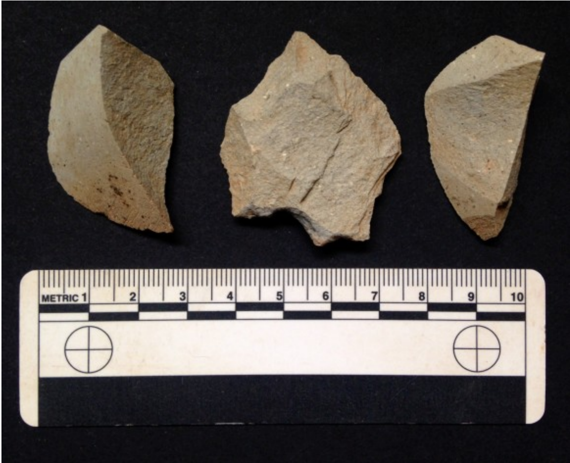
Fragments of broken polished axe reworked in to tools