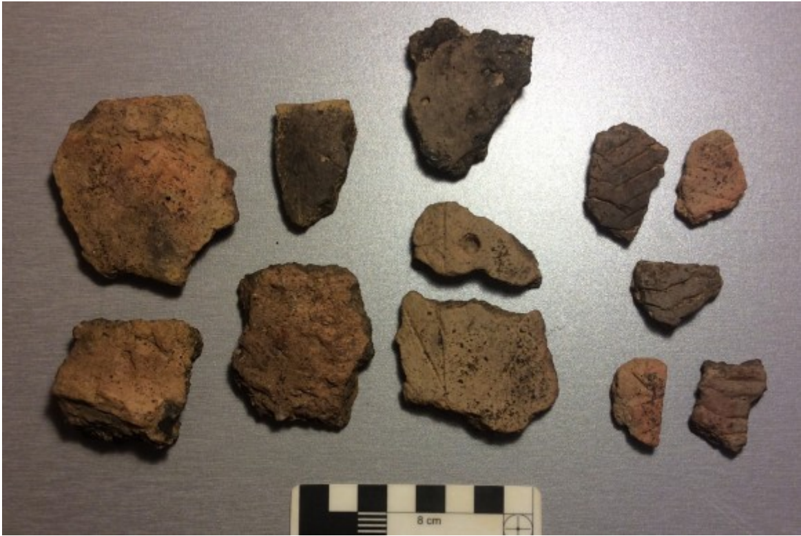
mix of Neolithic pottery from all stages of periods