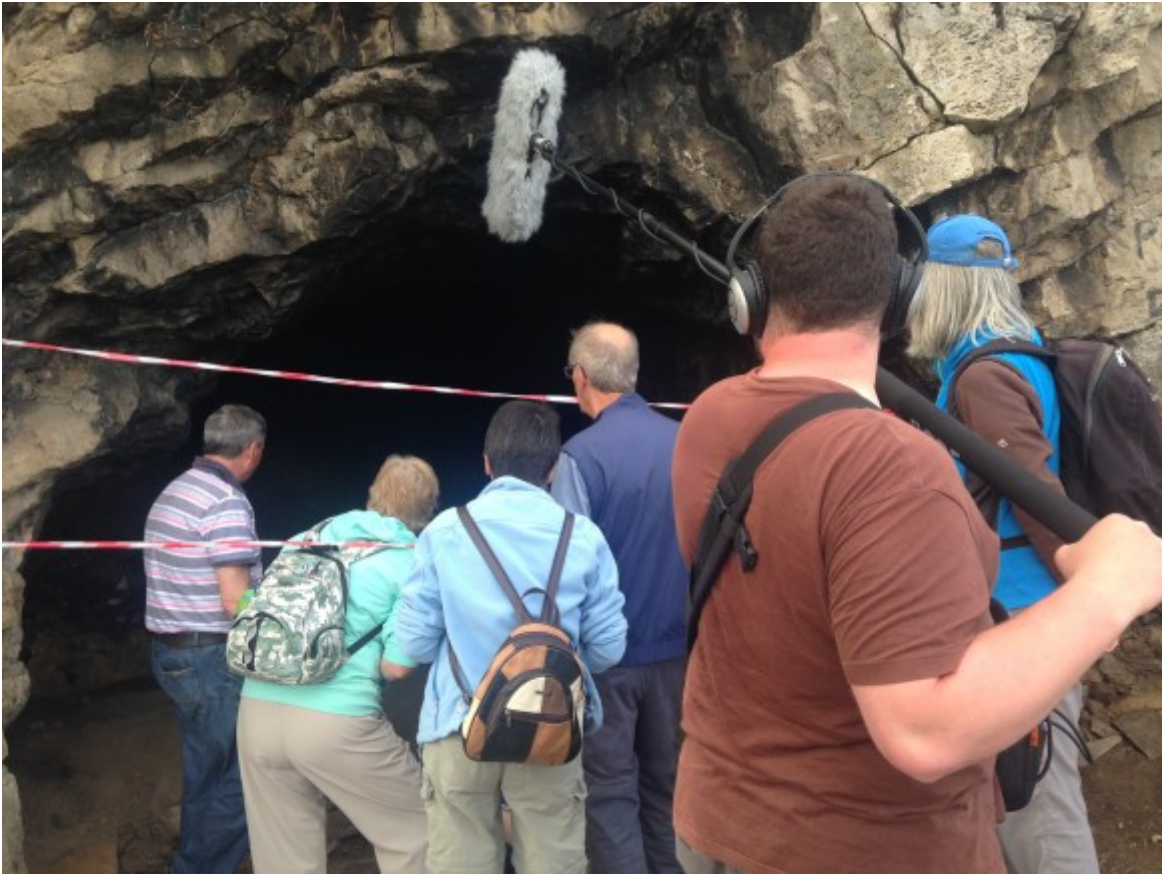
Local history group visit our prehistoric cave excavation