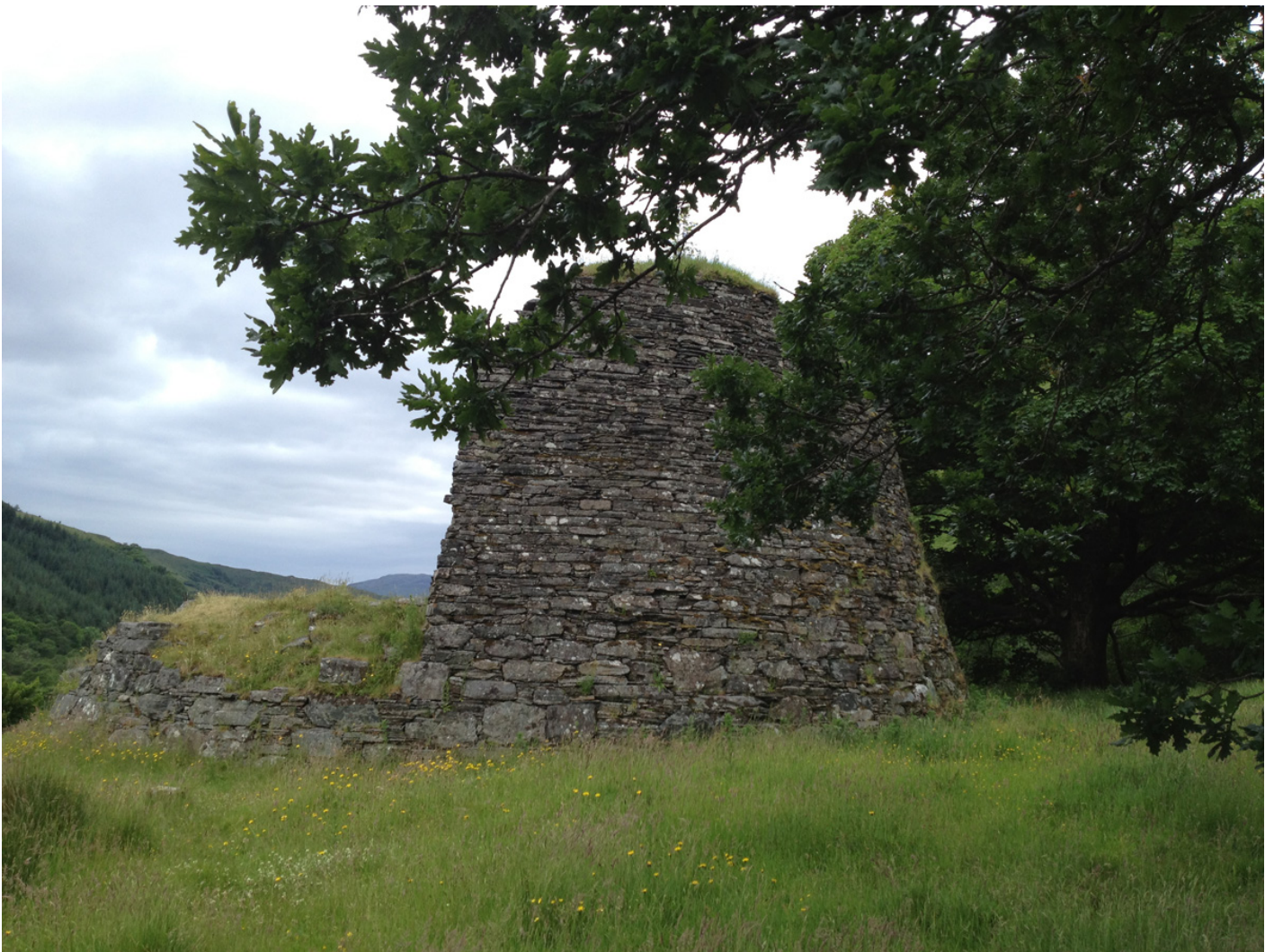
Dun Troddan Broch

We will travel around Scotland with its rich and fascinating heritage to show the students places with a highly interesting landscapes and with sites from the Neolithic to the modern era.