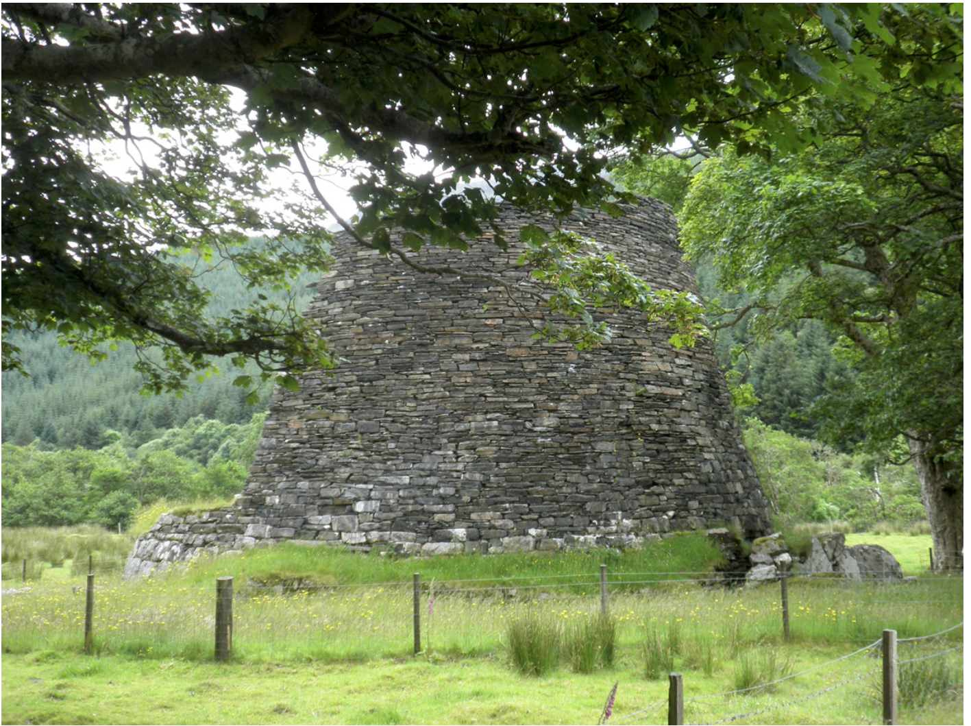
Dun Telve Broch

and the Glenelg Brochs (Dun Telve: https://canmore.org.uk/site/11798/ and Dun Troddan: https://canmore.org.uk/site/11797/ ) – definitely not the worst places to spend one's day!