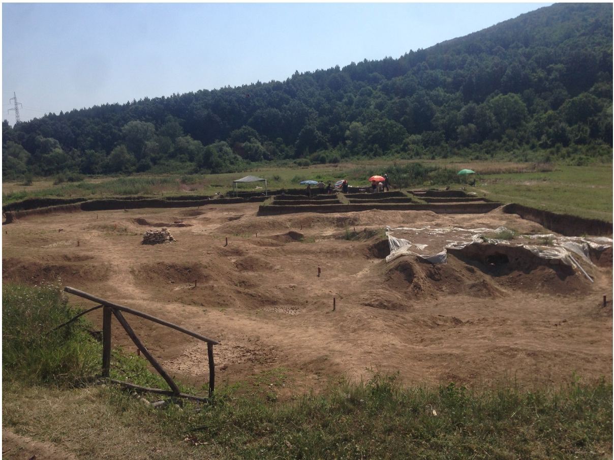
Neolithic Settlement, Bulgaria, 2013

As a student of Archaeology currently at Bournemouth University , I thought I had a fair idea of what being an archaeologist involved – or I thought. Even from two years of education in this field from lecture halls to fieldwork experience this had not truly prepared me for the world of working. When people think of archaeologists they generally think along the lines of Time Team or digging dinosaurs (grh!). They don't tend to think of all the behind scenes and day to day life of an archaeologist which I am still learning about. Since starting my placement year at Oxford Archaeology East two weeks ago I have only just dipped my toe into what it means to be an archaeologist.