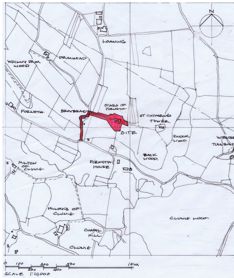
Figure 1 Location Plan

The building is served by the original drive which approaches from the west then runs around the north of the building. The land immediately to the south of the central house portion contains the original garden area to the property which was recorded in outline on the 1866 25" OS map. Detached ancillary buildings are also recorded on the OS maps but have now disappeared with the exception of the current retaining wall to the south east of the property.