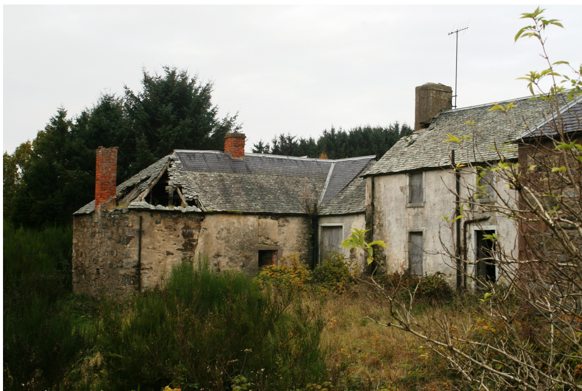
Figure 5 Stars of Forneth looking west

Hannay McLaren consider that the Historic Building Record has been compiled according to the requirements of the archaeological condition on the Planning Consent and Listed Building Consent referred to above. No further work is recommended in connection with the proposed development although the final decision lies with Perth and Kinross Council.