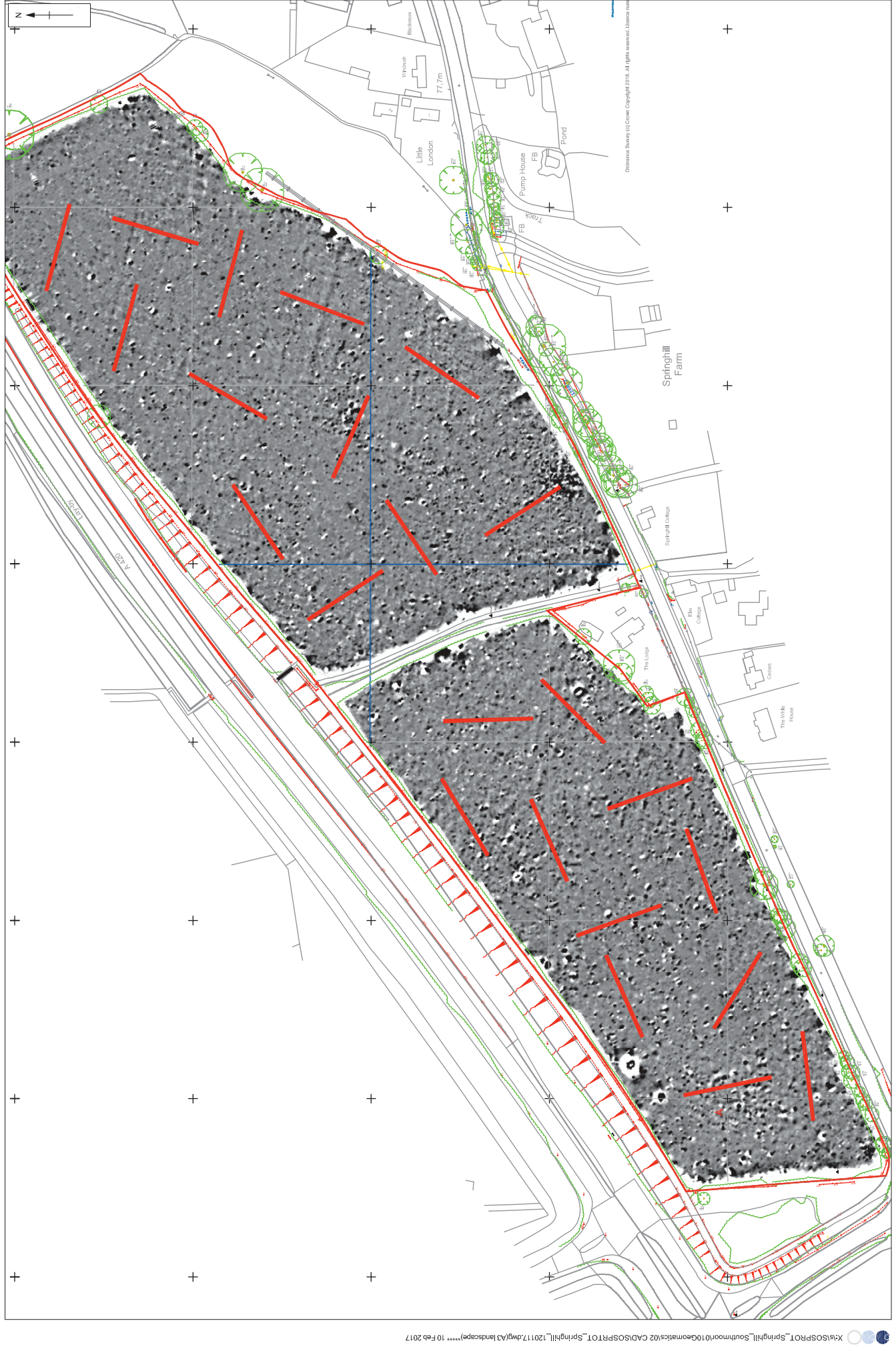
Figure 2: trench layout and geophysical survey grey scale plot