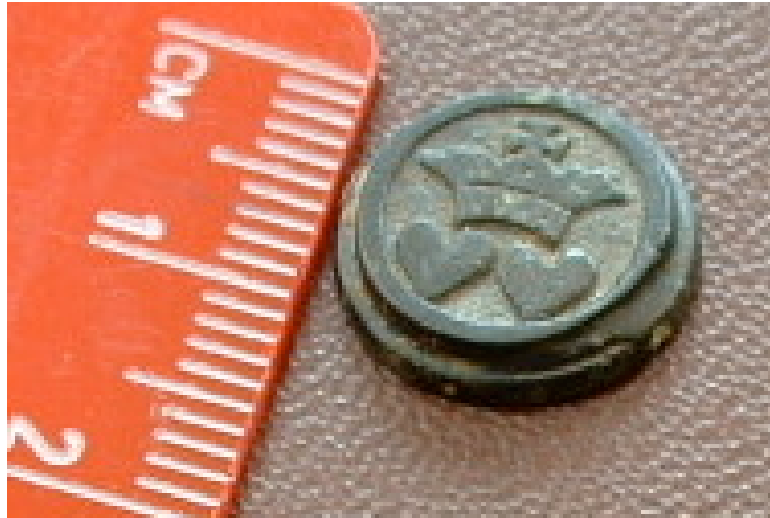
Fig.4 Cuff link button commemorating the Restoration of Charles II mid 17th century - see GBH2011 MD 16SA 3B above.