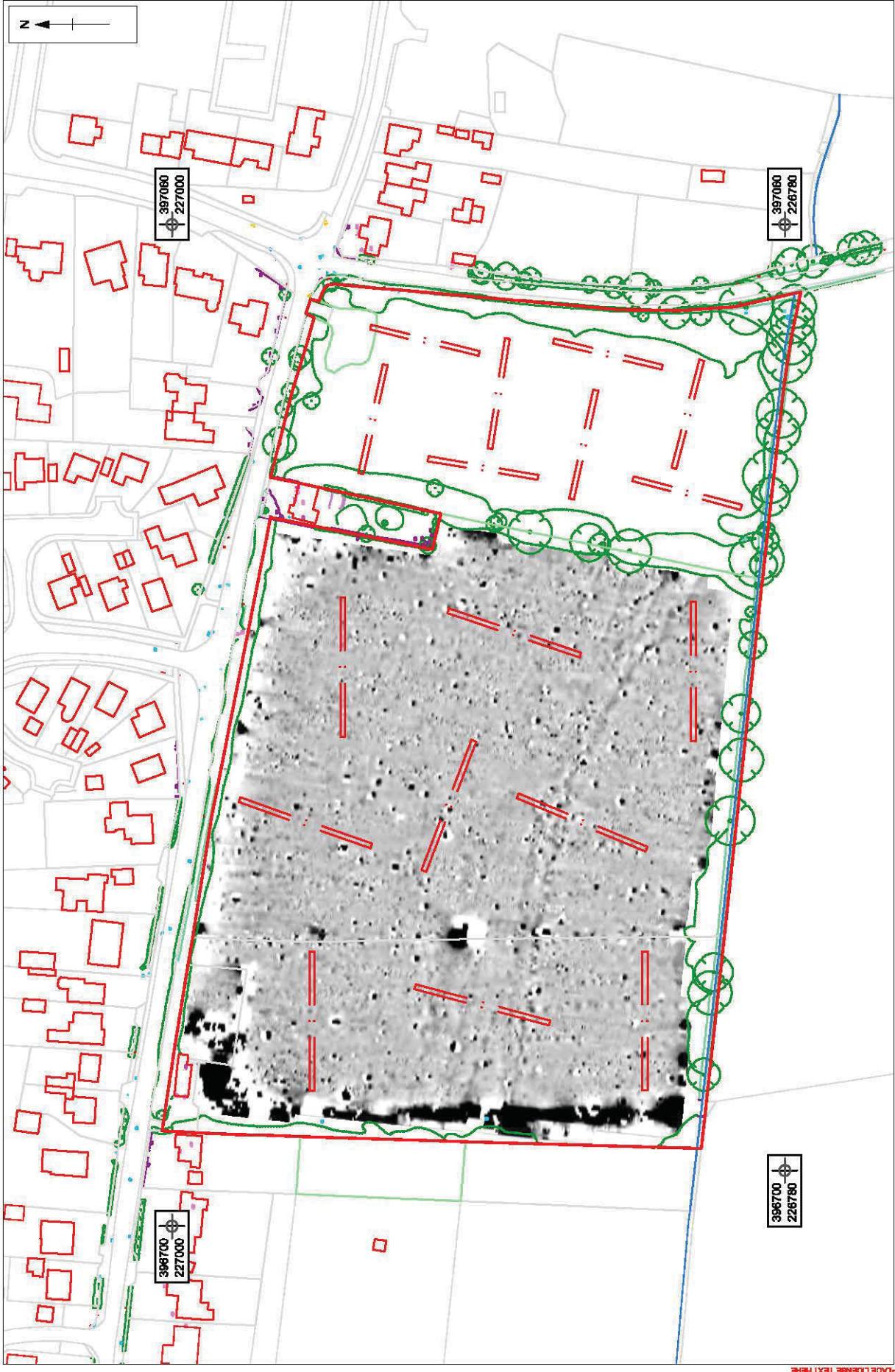
Figure 3: Trench layout with geophysical survey grey scale data

X:\OAWTHEV_Two_Hedges_Road_Woodmancote_Gloes10\Geomatics\02 CAD\OAWTHEV_Woodmancote_150817.dwg[WS_Fig3]code\codes\SUBJECT\stave.lawrence* 15 Sep 2017