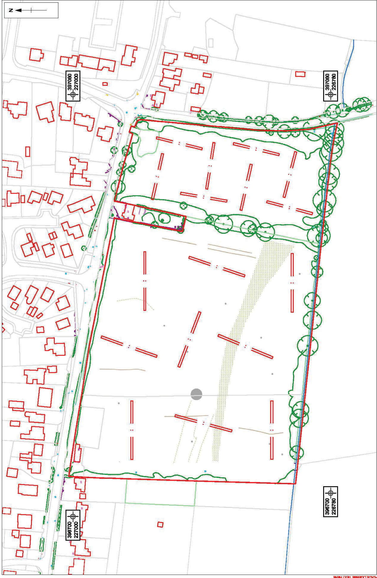
Figure 2: Trench layout with geophysical survey interpretation data