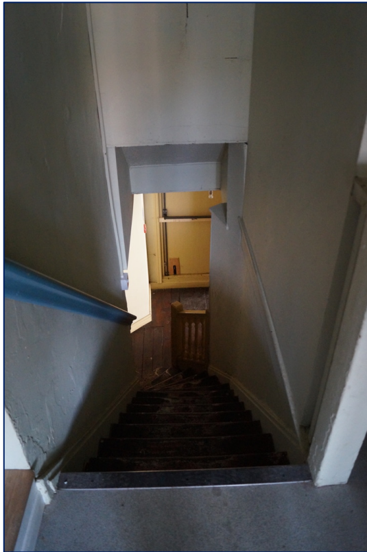
Plate 13. Staircase between first and second floor. Likely original location.