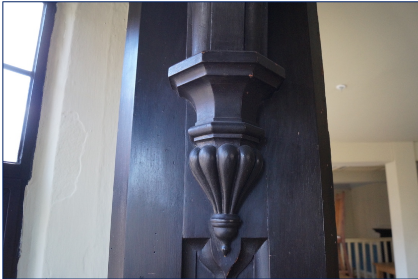
Plate 12. Detail of moulded timber arch.