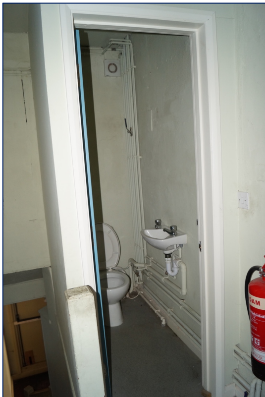
Plate 14. Toilet on second floor.