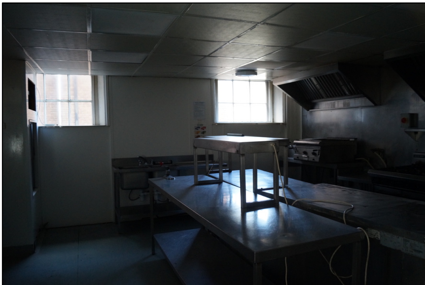
Plate 16. Example of modern alterations to second floor.