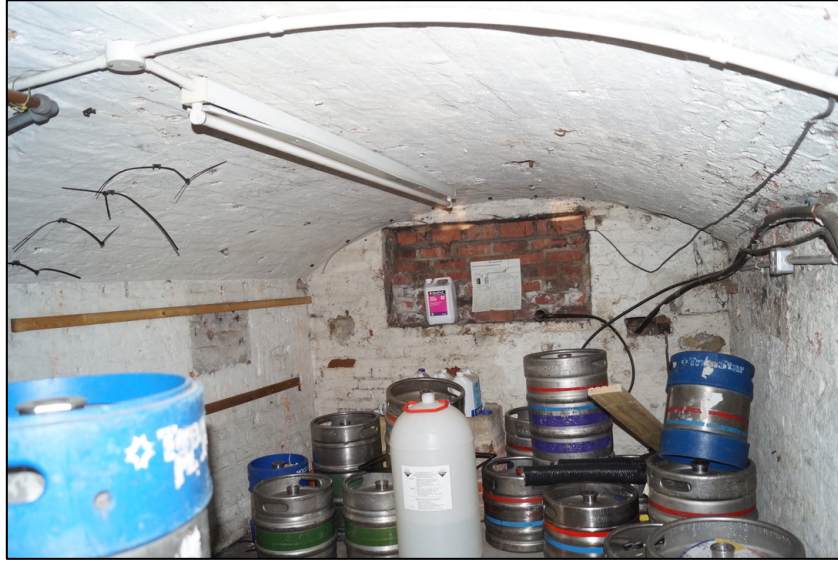
Plate 5. Detail of barrel vaulted cellar.