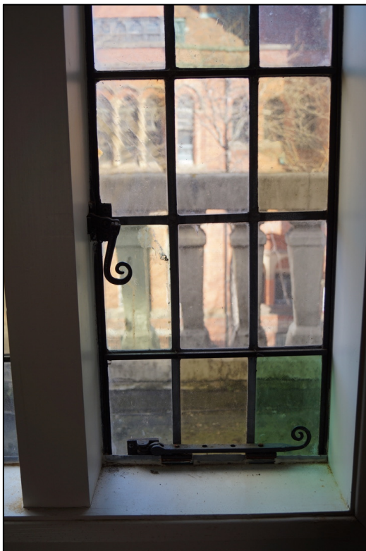
Plate 19. Possible original glazing panes in attic window.