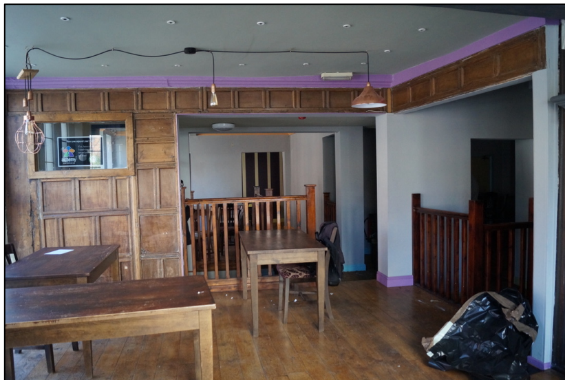
Plate 2. Wall paneling on ground floor looking towards the main front entrance.