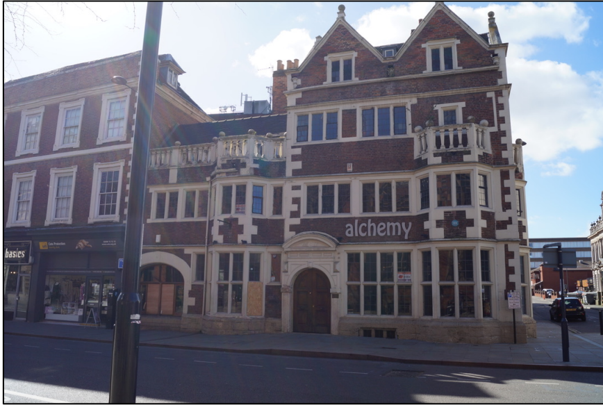
Plate 20. Front elevation of the Jacobean House showing characteristic architectural detailing.