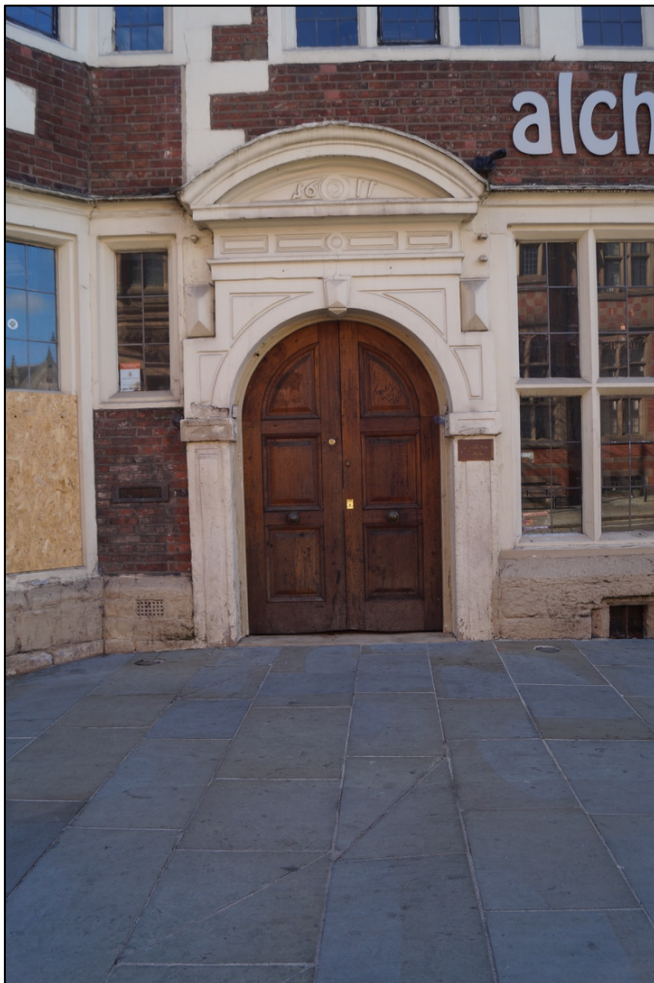
Plate 21. Detail of front entrance. The doors are modern.