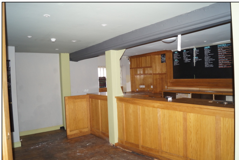
Plate 4. Example of modern additions on the ground floor.