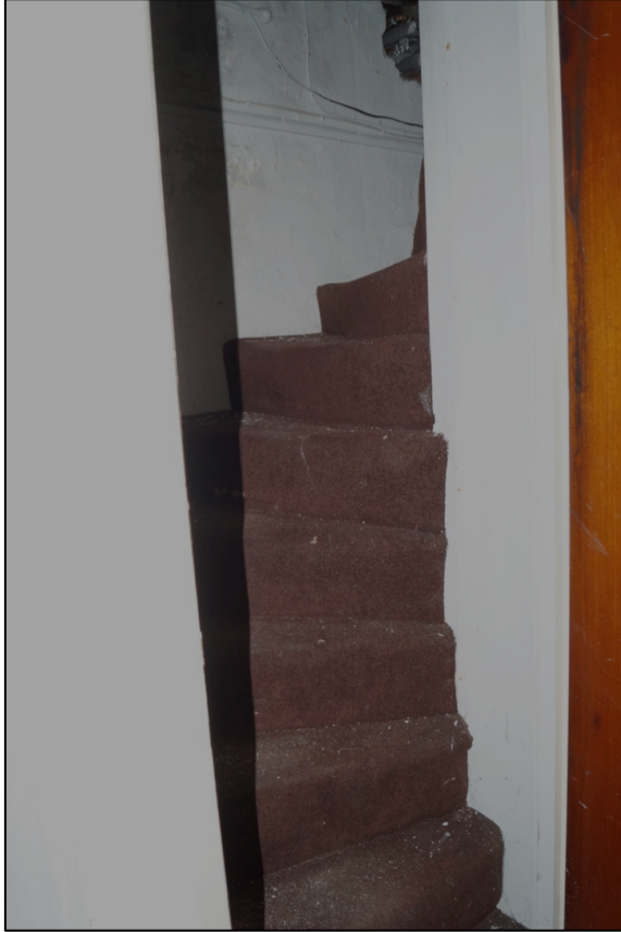
Plate 17. Original winder staircase to attic.