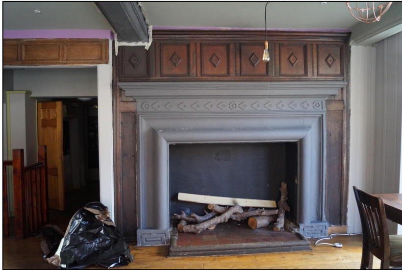
Plate 1. Large fireplace with overmantel. Chamfered main ceiling beam and original paneling at the top left of the photograph.