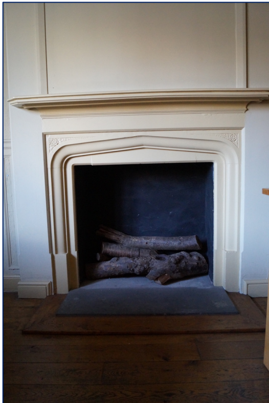
Plate 8. Fireplace with moulded stone surround and mantel.