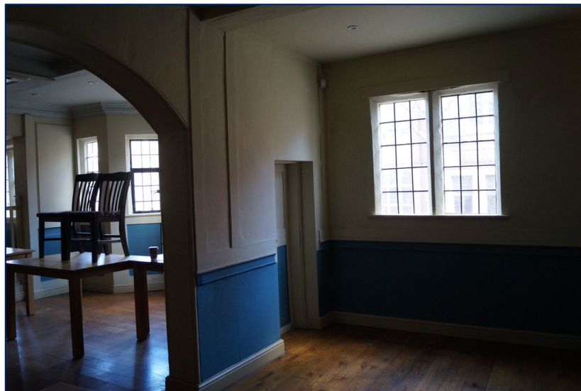
Plate 10. View showing modern alterations to original planform on first floor.