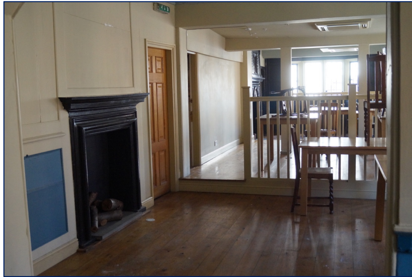
Plate 9. View showing modern changes to planform on first floor.