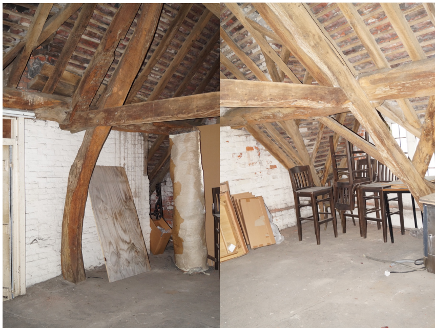
Plate 18. Two sides of a cruck-frame in the attic.