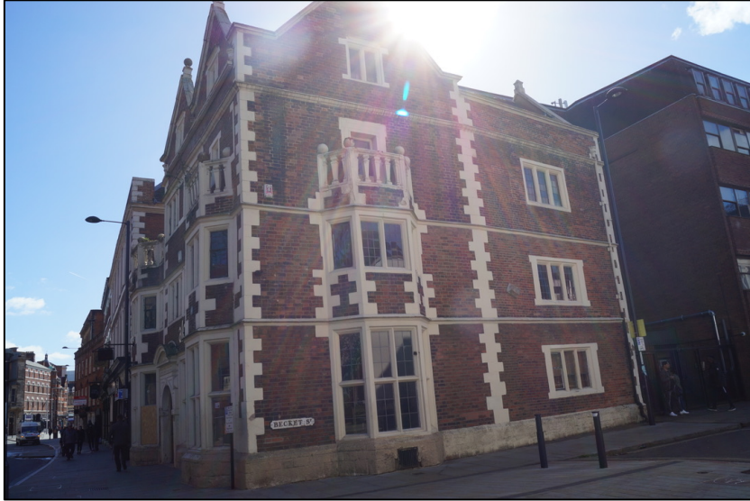
Plate 22. Elevation fronting Beckett Street. This elevation was rebuilt in 1855 when three gables of the original house were removed to make way for Beckett Street.