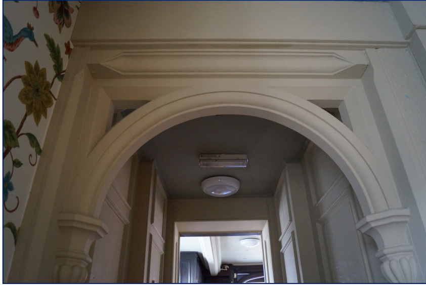
Plate 11. Example of decorated arch and paneling on first floor.