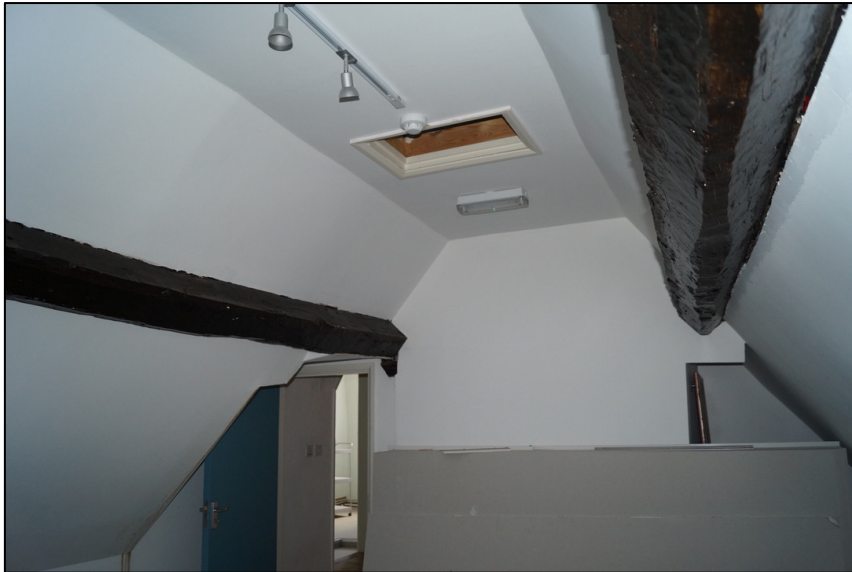
Plate 15. Modern alterations to room on second floor. Only original purlins remain visible.