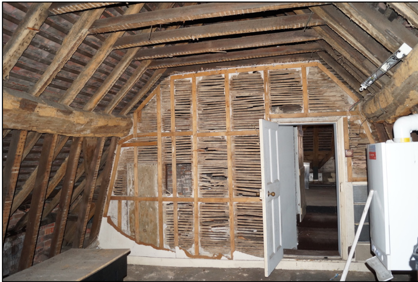
Plate 18. Lath and plaster partition wall to rear of chimney breast.