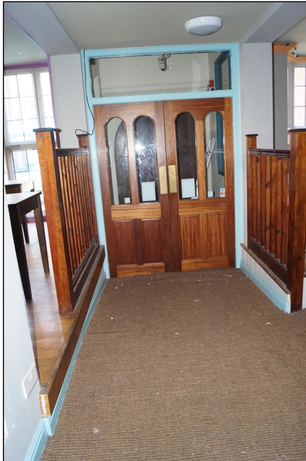
Plate 3. View towards the entrance showing modern intervention.