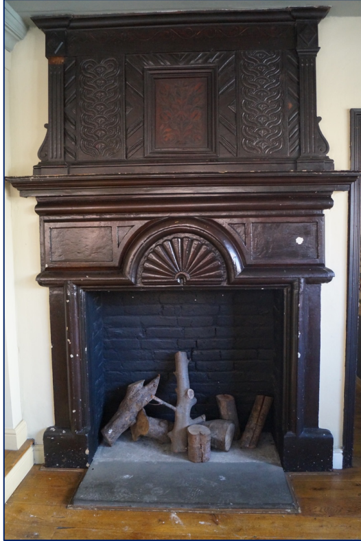
Plate 7. Elaborately decorated fireplace with carved overmantel.