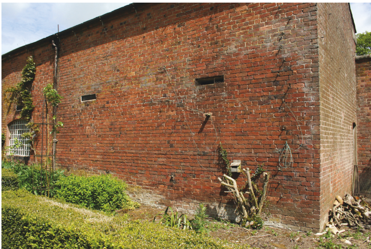
Exterior_010 - South elevation - eastern bay

The plain elevation reflects the original appearance of the stableblock on this elevation, which did not need rear access onto the garden. The doorway in the central bay and end wall may have been used to provide access for barrowing manure out into the garden. The pierced metal ventilators are later 19th century additions.