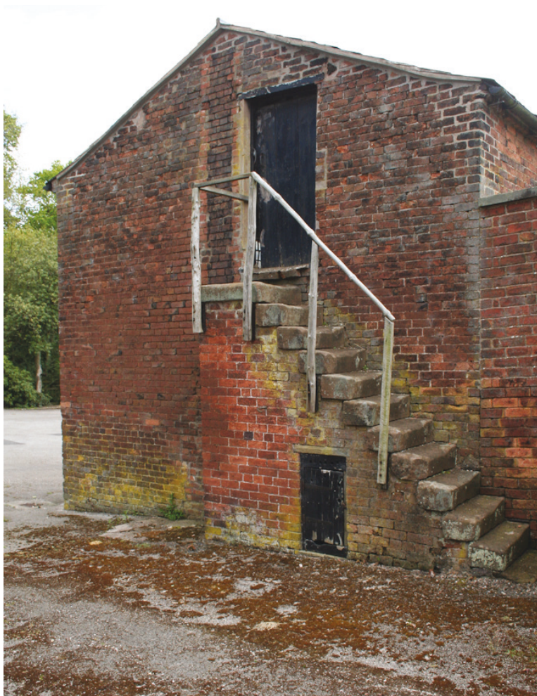
Exterior_012 - gable end of western stable block with external staircase access to hayloft and outline of former, added flue in darker bricks

The plain elevation reflects the original appearance of the stableblock on this elevation, which did not need rear access onto the garden. The doorway in the central bay and end wall may have been used to provide access for barrowing manure out into the garden. The pierced metal ventilators are later 19th century additions.