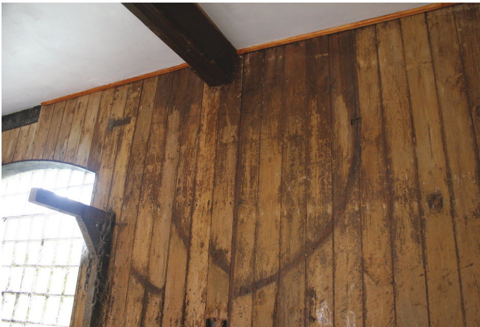
Ground_010 - Impression - left Ghosted impression of both former iron mangers and timber boarded baffles from the c1890 refurbishment within the timber boarded lining to the pair of central stalls - now within the garage