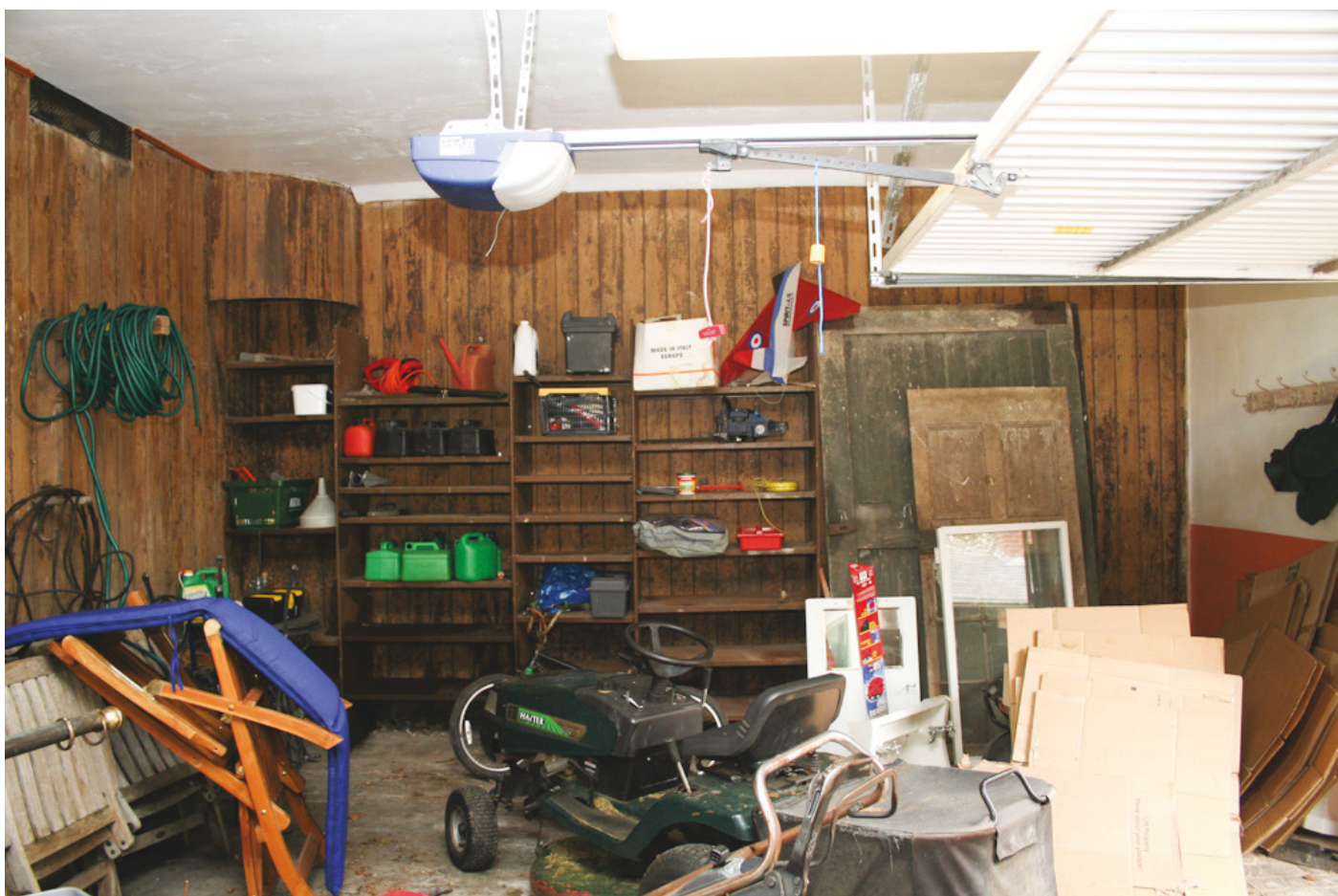
Ground_002 - internal view of garage looking north with panelled lining and hay drop baffle