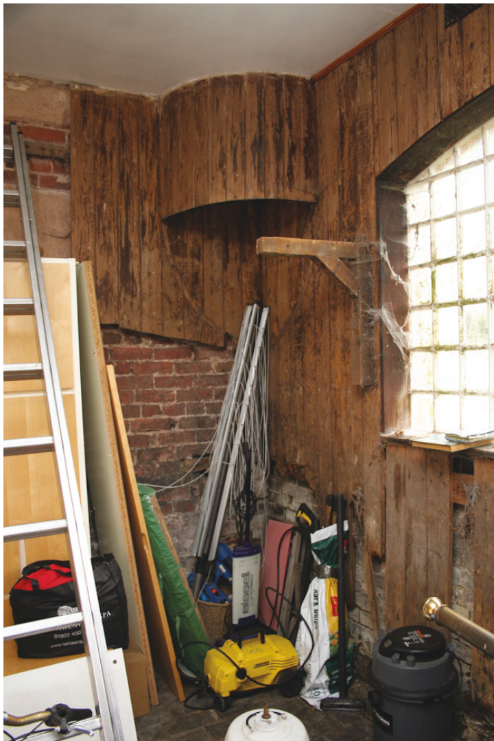
Ground_003 - lining to garage (former stables) with haydrop curved timber baffle, and re-located cast iron window