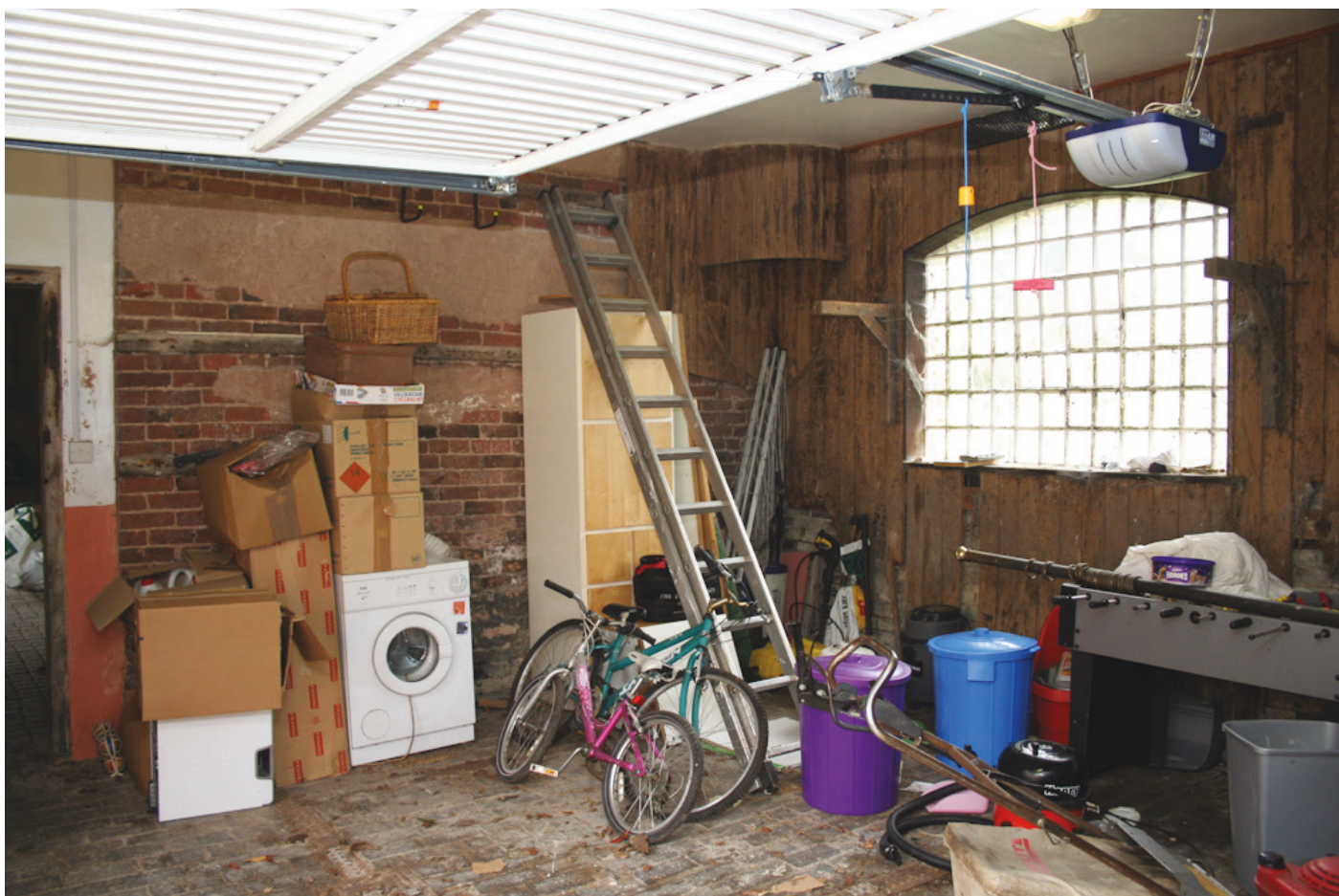
Ground_001 - Internal view of garage (former stables) with timber lining and clay paved block floor