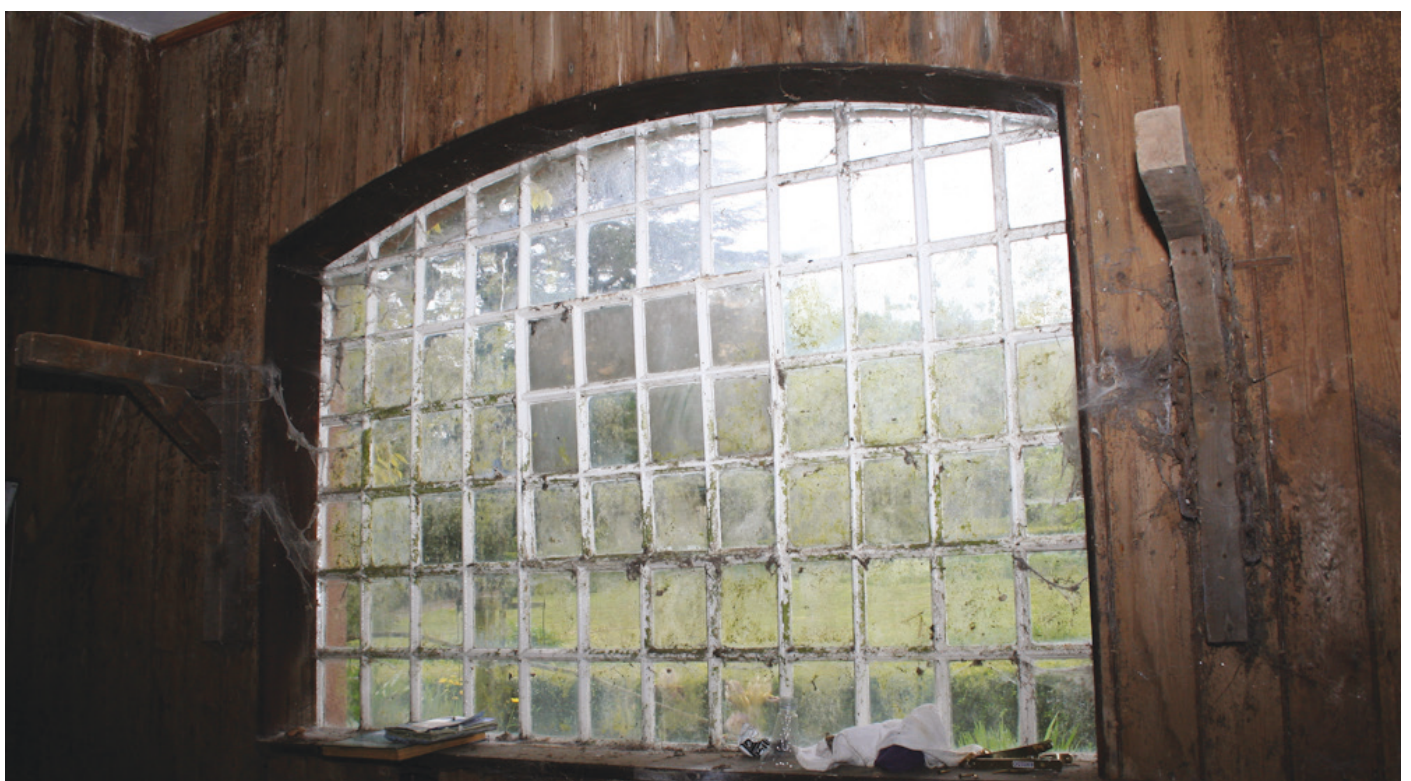
Ground_006 - Cast-iron window relocated into south elevation. This window is the original window from the north, courtyard elevation and was moved here after building was adapted as a garage / workshop. The timber panelling was carefully cut to accommodate the repositioned window. It would not have been used when the building was in use as a stables in the late 19th century.