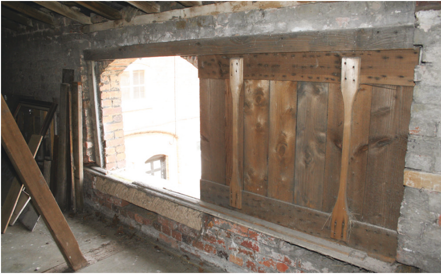
First_002 horizontal sliding shutter to hayloft over garage (late C19 replacement) in original opening