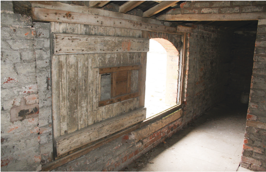
First_003 horizontal sliding shutter - original boarded shutter with opening vent