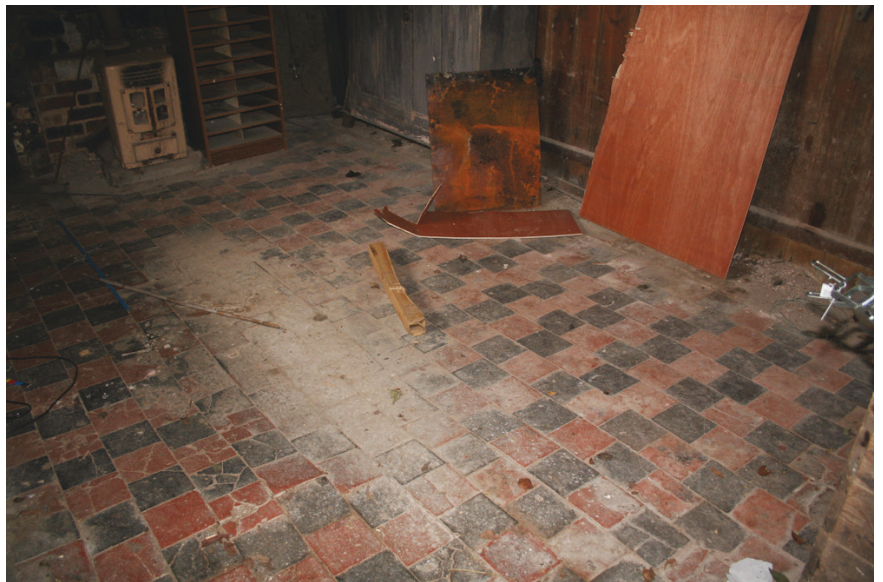
Ground_024 - Right - red and blue tiled floor of the Harness Room, c.1890

The Harness Room dates from c1890 and contains a fireplace to provide heating for the groom and stable hands whilst they worked on maintaining the harnesses and tack. The original stove has been replaced.