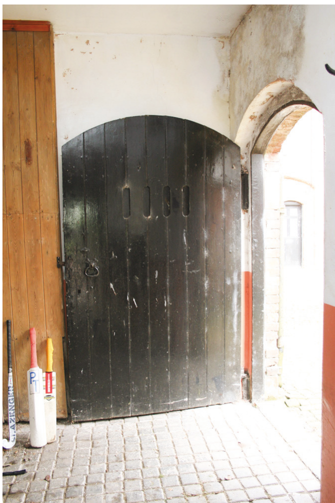
Ground_016 (right) - internal elevation of the same door