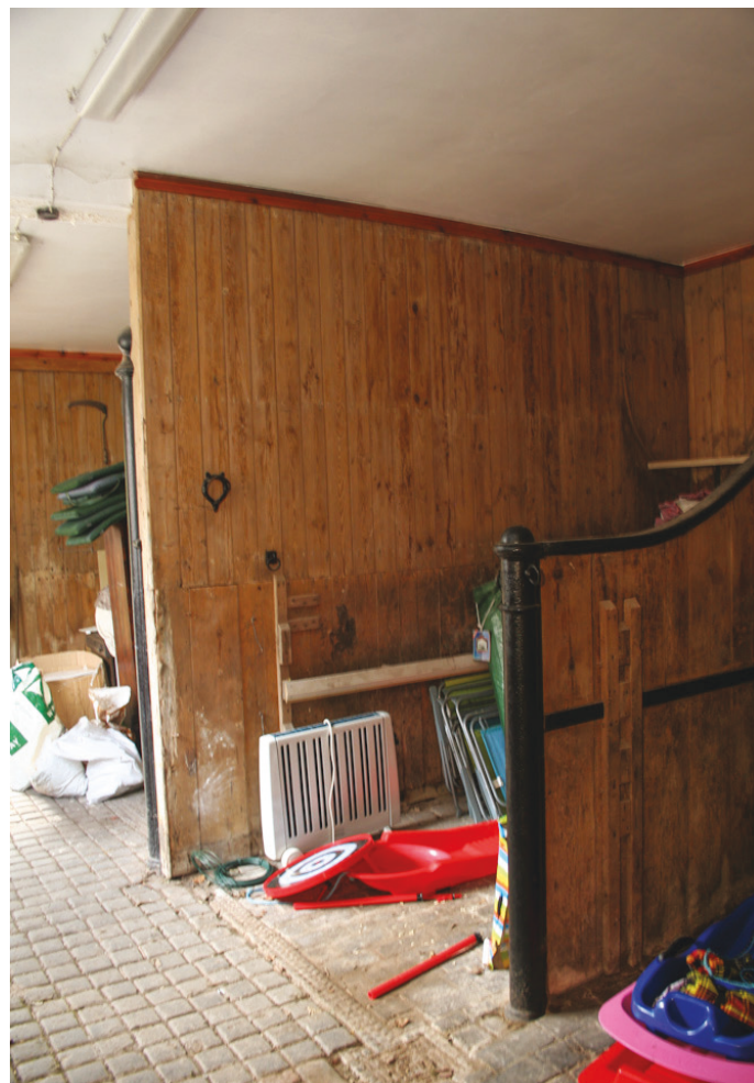
Ground_018 - (above left)