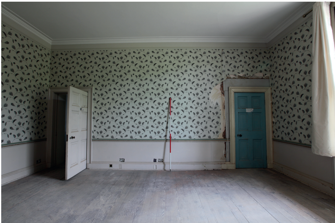
f17_001_14.06.21 - relocated door to right