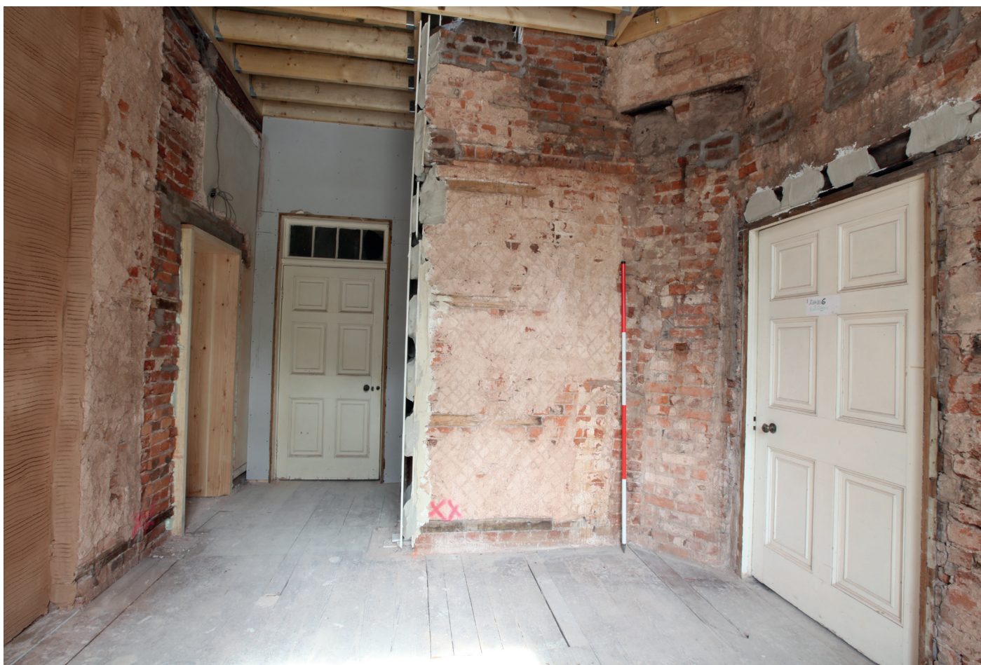
f8_004_14.06.21 - note bricked-up corner flue to this space.