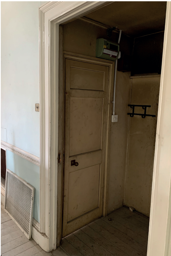
f23_001_14.05.20 - inserted C20 door Ashcombe Park - Historic Building Record