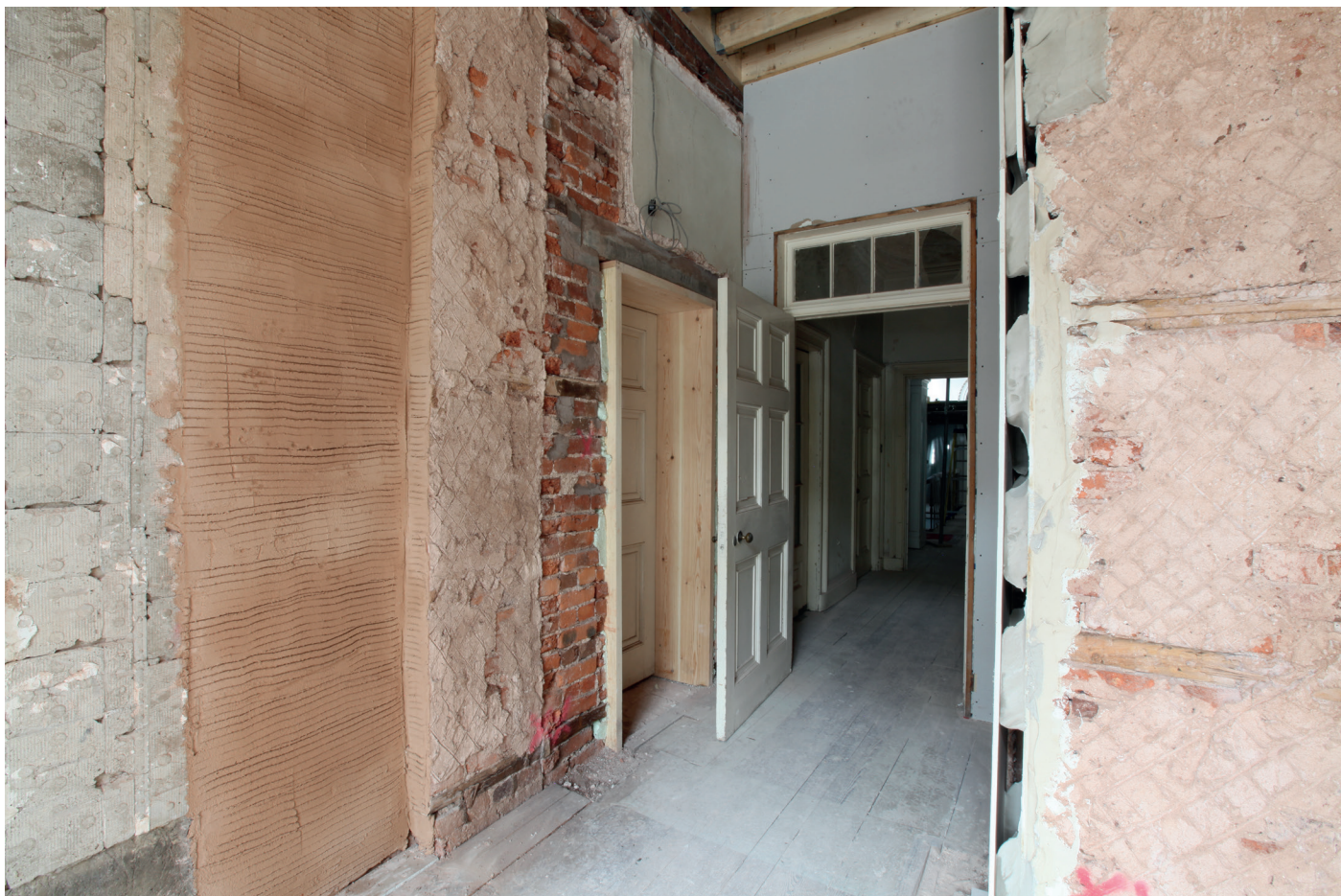
f9_003_14.06.21 - partition with fanlight re-located