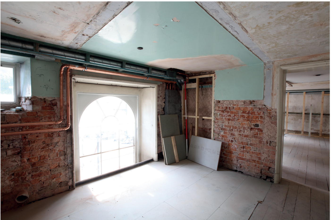
i6_004_14.06.21 - note studwork for former cupboard or blocked door to outer edge of floor plan