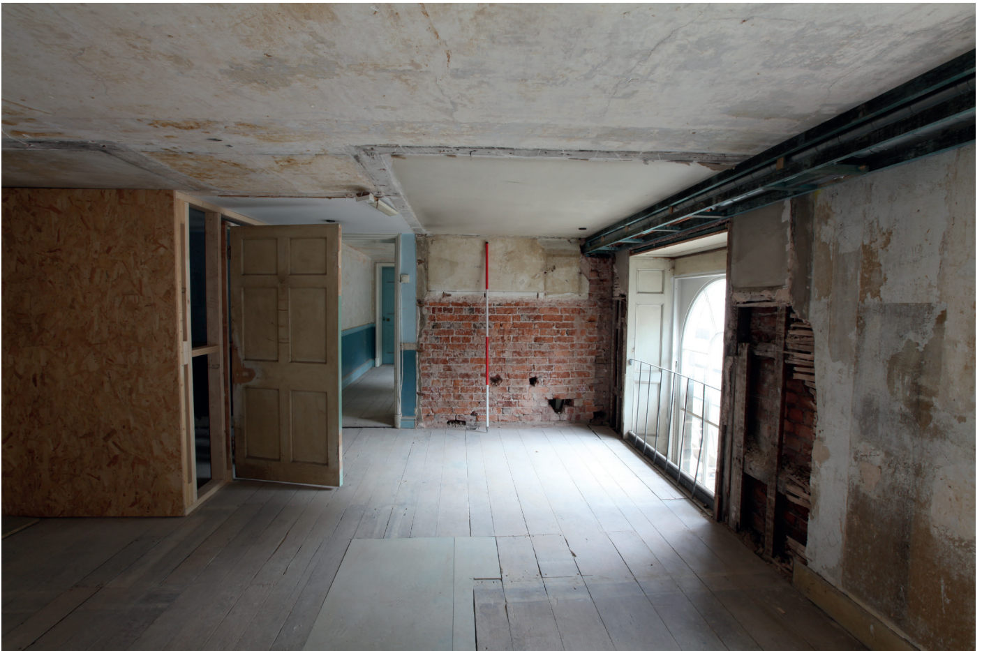
i8_004_14.06.21 new partition to replace linen cupboard to left. Outer wall lined with studwork and lathe-and-plaster.