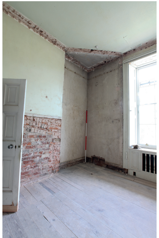
f14_002_14.06.21 - after removal of angled wall