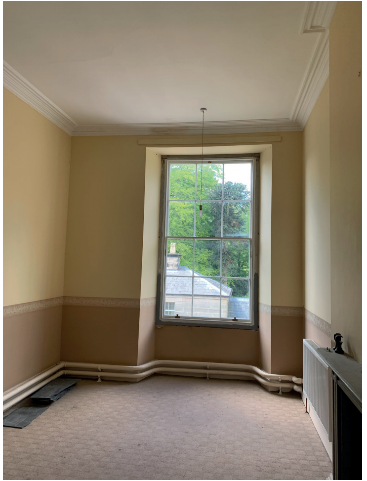
f12_002_14.05.20 Bedroom with small internal window and new partition, probably added in 1851 to light the corridor