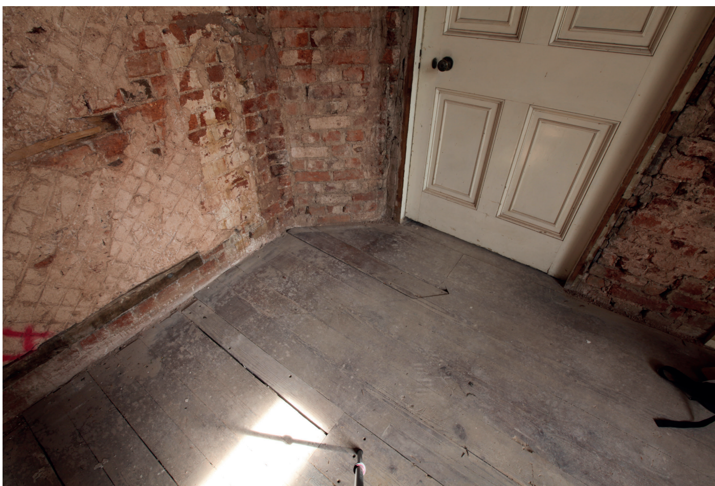
f8_006_14.06.21 - former location of hearth visible in floor by made-up boards replacing stone hearth