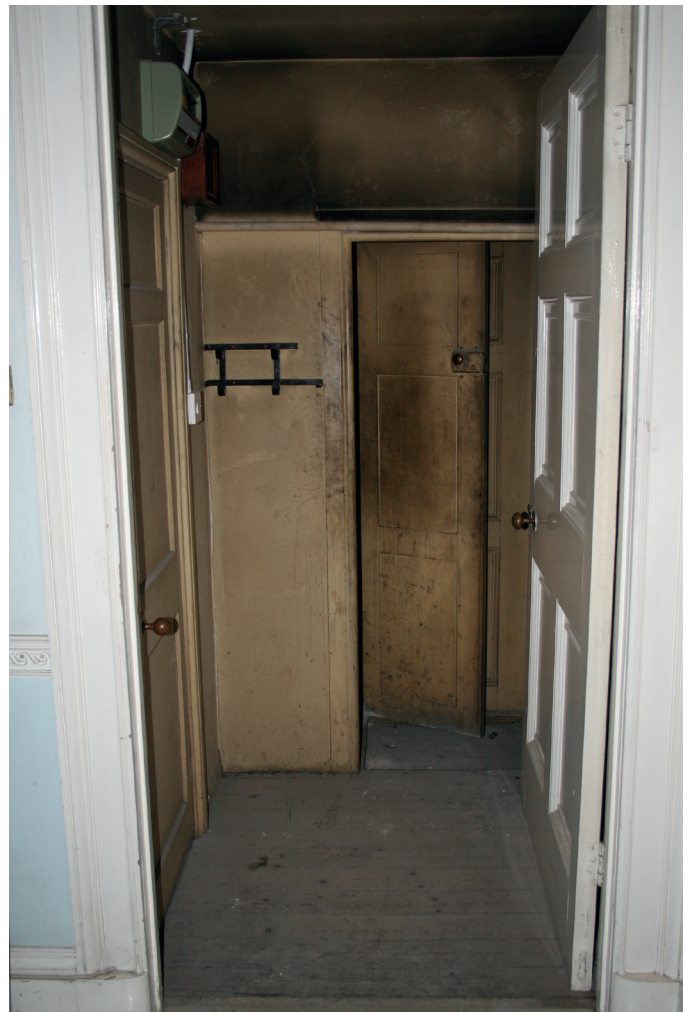
f23_002_22.12.15 - attic access