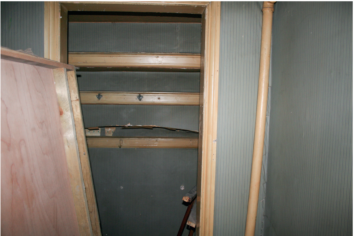
i10_001_22.12.15 - cupboard with rails, hooks and former brick arch - location of former staircase