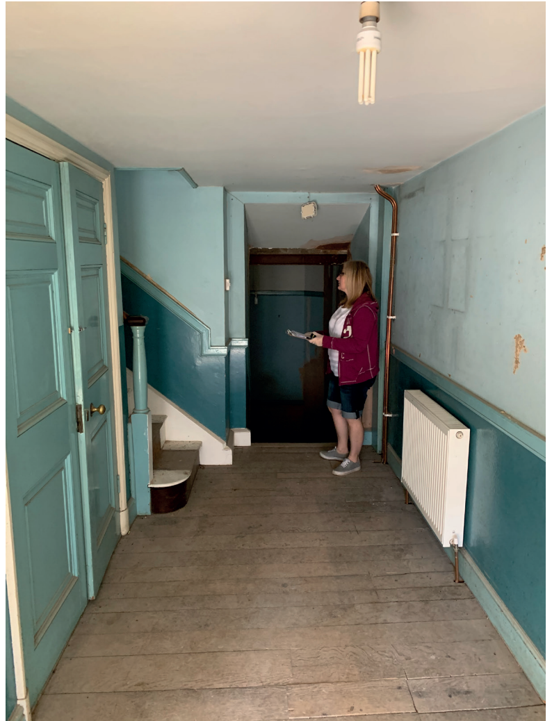
i2_002_14.06.21 linen cupboard removed - new partition