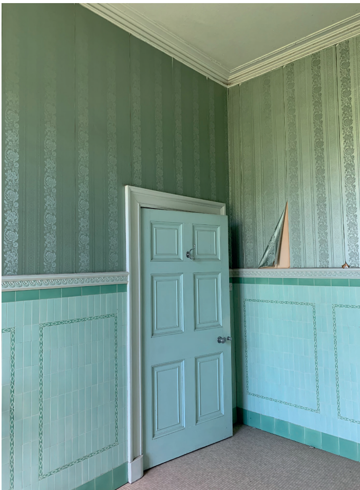
f14_003_14.05.20 Ashcombe Park - Historic Building Record