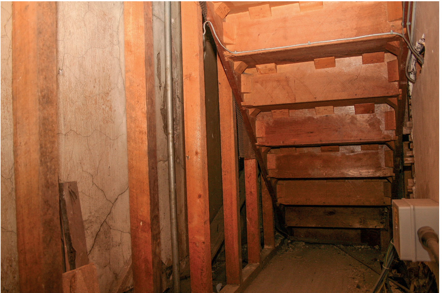
i9_001_05.10.15 - underside of 1851 or C20 staircase