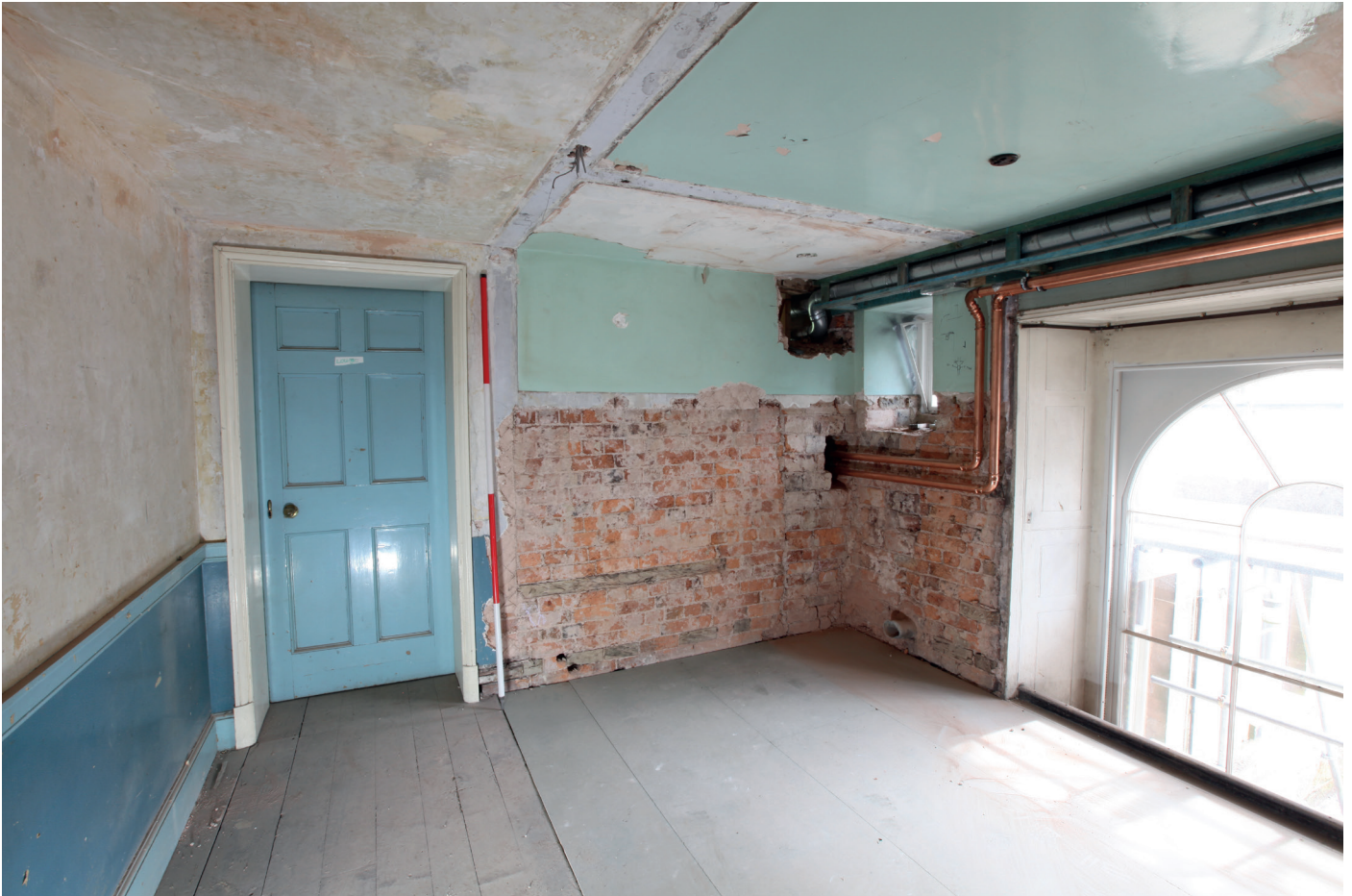
i6_003_14.06.21 - note straight joint, brick repair and lathe-and-plaster ceiling, with part gypsum skim.