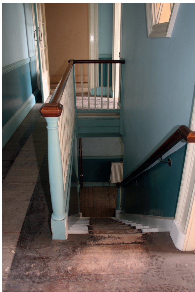
f10_001_15.10.15 - access from first floor to mezzanine