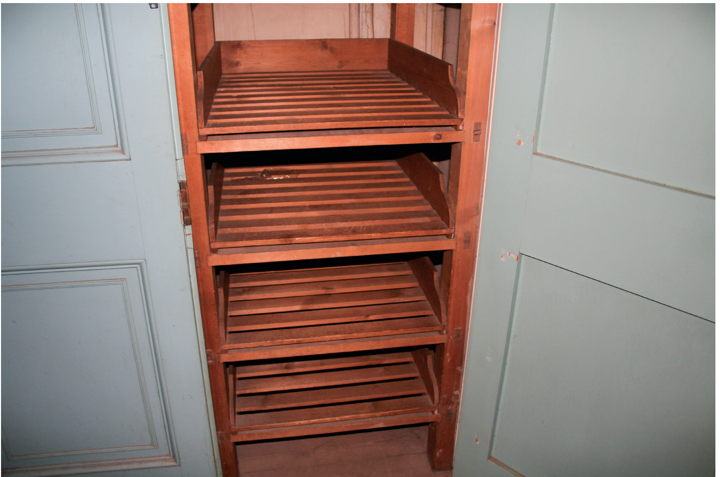
i11_001_22.12.15 - linen cupboard interior