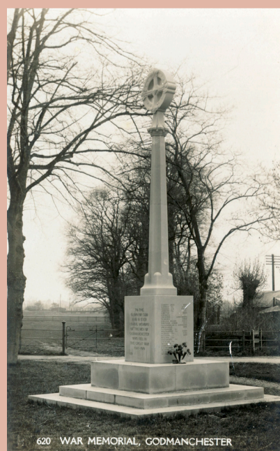
620 WAR MEMORIAL, GODMANCHESTER