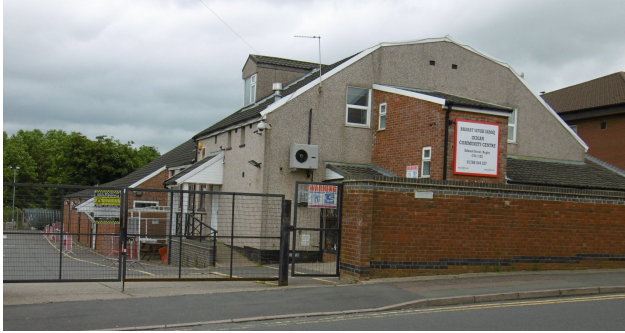
1. The Old Drill Hall from Edward Street.