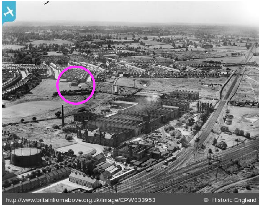
5. Archive photograph from July 1930.