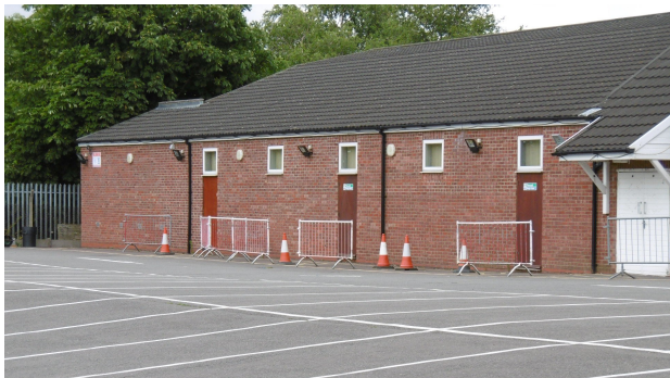
2. The Old Drill Hall from Edward Street.

From 1902 the Territorial Association (TA) leased a small piece of land in New Bilton from the Willans & Robinson Company. In subsequent years they steadily increased their holding by leasing additional adjacent land from the same company (3). On land acquired in 1913 they built a Drill Hall – that hall is now an Indian Community Centre off Edward Street, Rugby. In subsequent years the TA Centre was much enlarged and included several other buildings all now apparently lost. At some time, apparently after 1950, the estate was rationalised with a range of modern buildings being erected to the south east of the old Drill Hall. In 2016 the new buildings are home to a reserve unit of 4 Para.