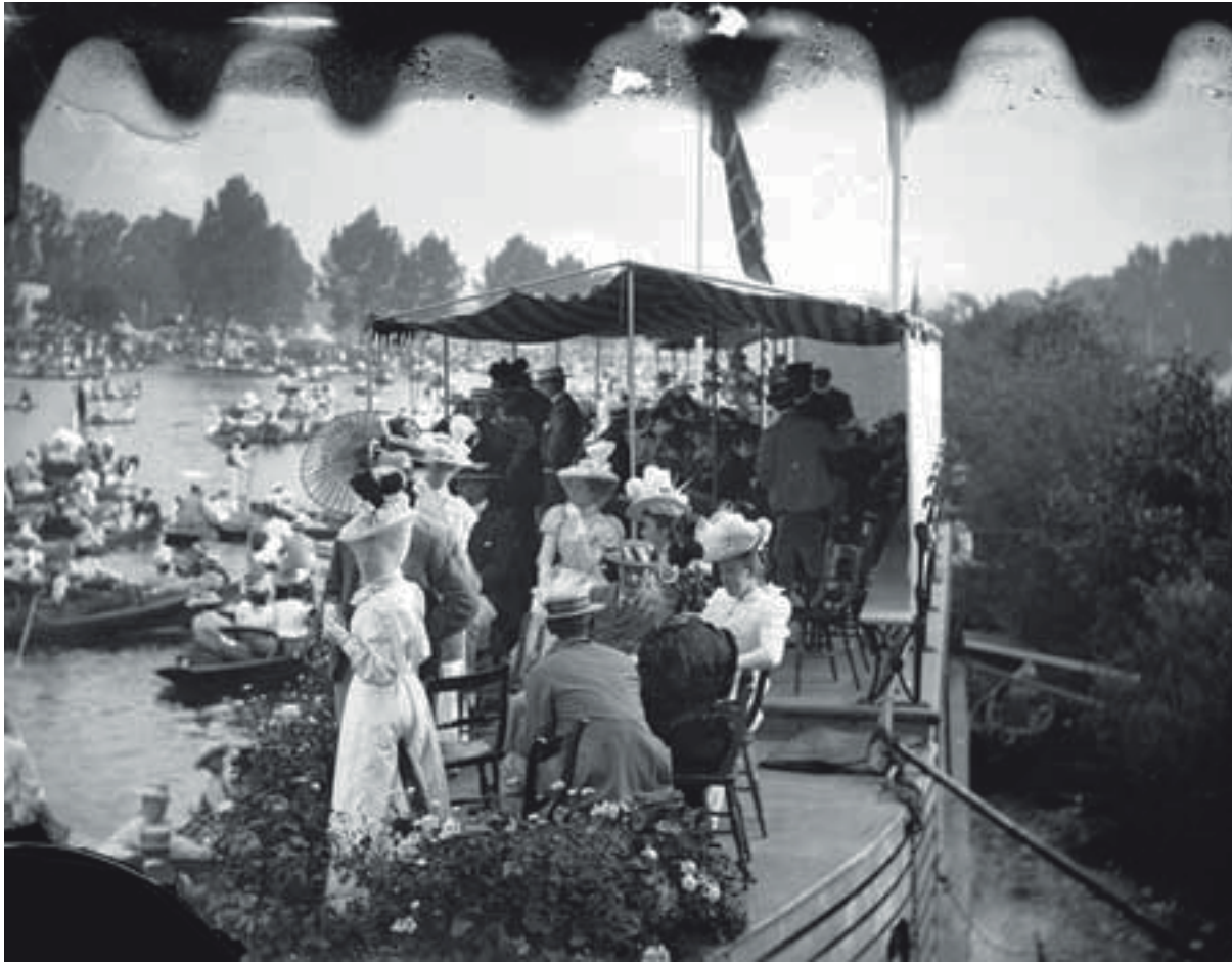
Figure 11: Henley Royal Regatta, Henley-On-Thames, Oxfordshire, 1897

The Archaeology of the Gravel Terraces of the Upper and Middle Thames: The Thames Valley in the Medieval and Post-Medieval Periods AD 1000-2000