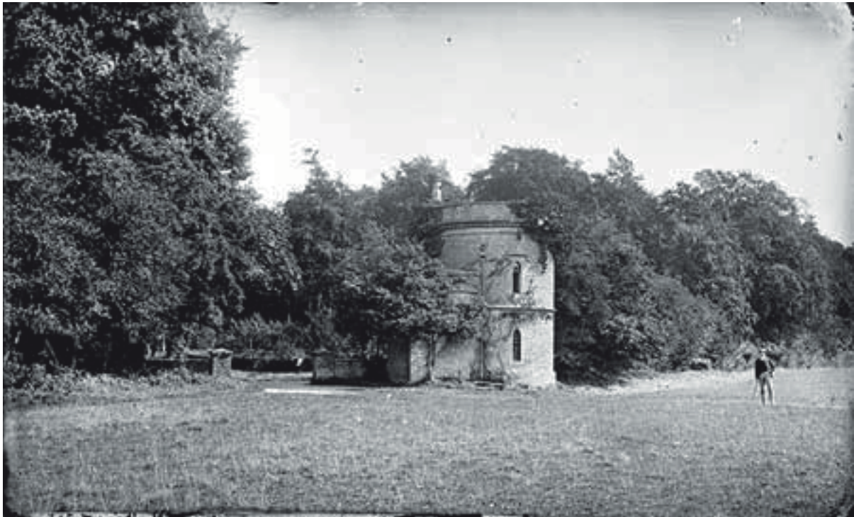
Figure 7: Early 18th-century neo-medieval round tower in Cirencester Park, Gloucestershire, 1875

The Archaeology of the Gravel Terraces of the Upper and Middle Thames: The Thames Valley in the Medieval and Post-Medieval Periods AD 1000-2000