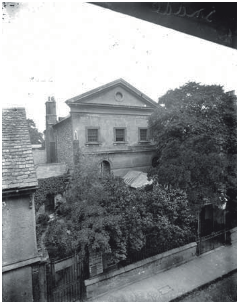
Figure 8: Holywell Music Room, Holywell Street, Oxford, 1908

The Archaeology of the Gravel Terraces of the Upper and Middle Thames: The Thames Valley in the Medieval and Post-Medieval Periods AD 1000-2000