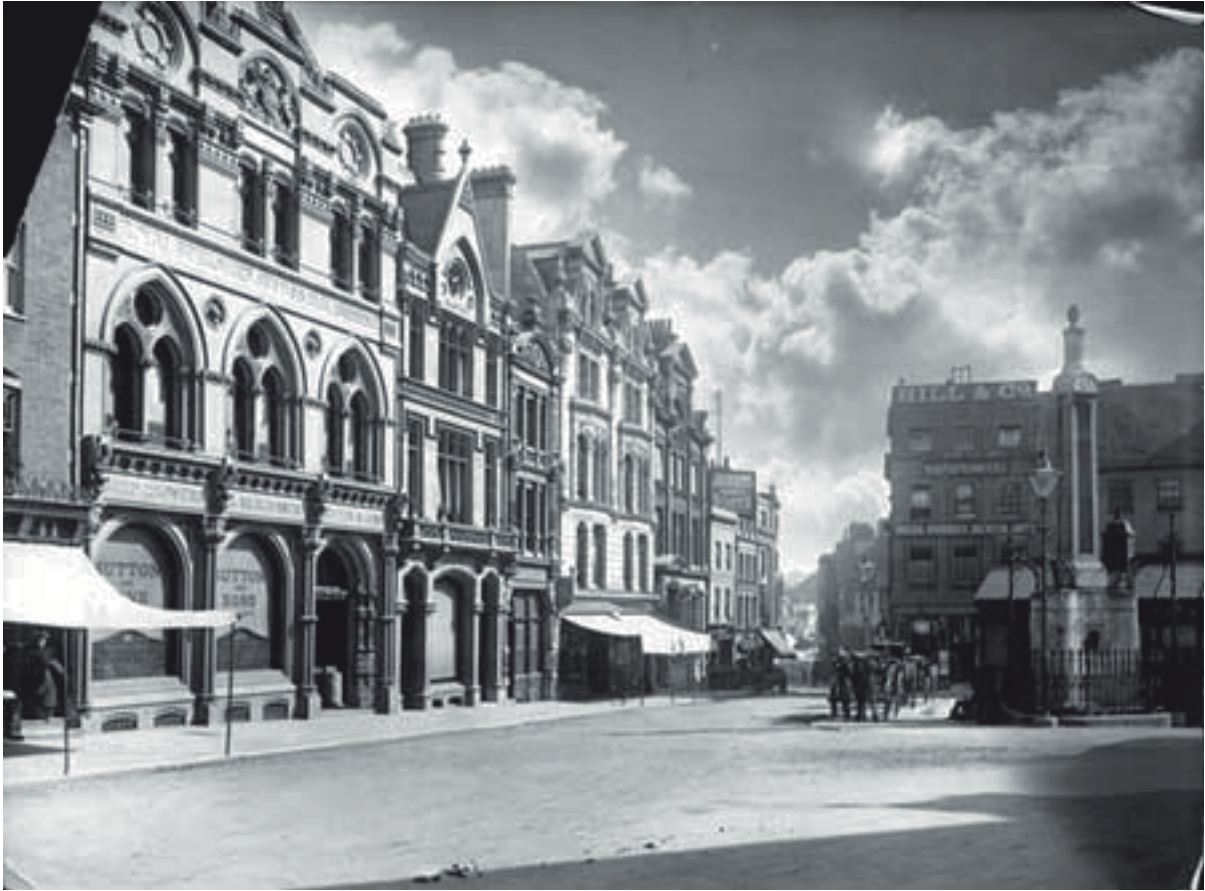
Figure 12: The Sutton Seeds building on Market Place, Reading, Berkshire, 1890

The Archaeology of the Gravel Terraces of the Upper and Middle Thames: The Thames Valley in the Medieval and Post-Medieval Periods AD 1000-2000