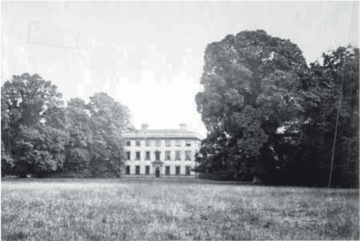
Figure 5: 17th-century mansion in Fairford Park, Gloucestershire, 1875

The Archaeology of the Gravel Terraces of the Upper and Middle Thames: The Thames Valley in the Medieval and Post-Medieval Periods AD 1000-2000