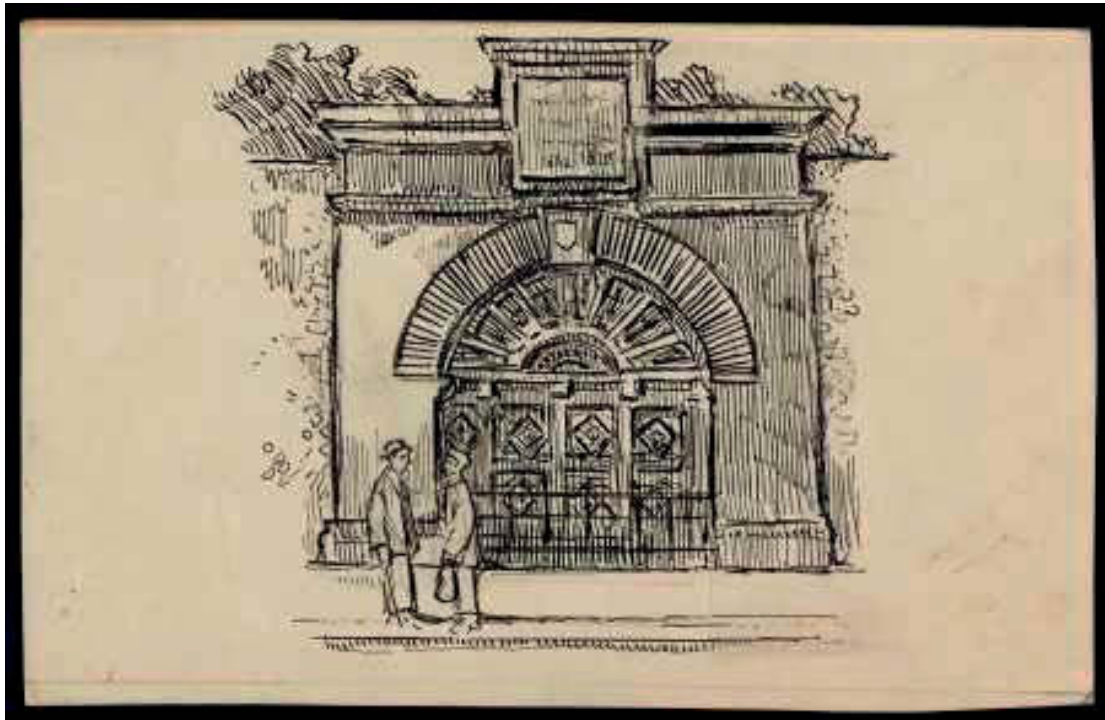
Figure 6: The Oracle Gate at Reading Workhouse, Berkshire, 1982–1933

The Archaeology of the Gravel Terraces of the Upper and Middle Thames: The Thames Valley in the Medieval and Post-Medieval Periods AD 1000-2000