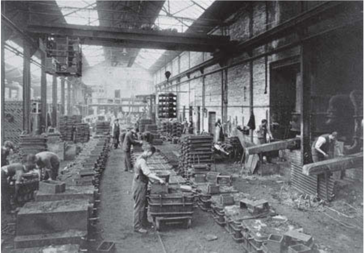
Figure 15: Workers in the foundry of Morris Motor Works, Cowley, Oxfordshire, 1935

The Archaeology of the Gravel Terraces of the Upper and Middle Thames: The Thames Valley in the Medieval and Post-Medieval Periods AD 1000-2000