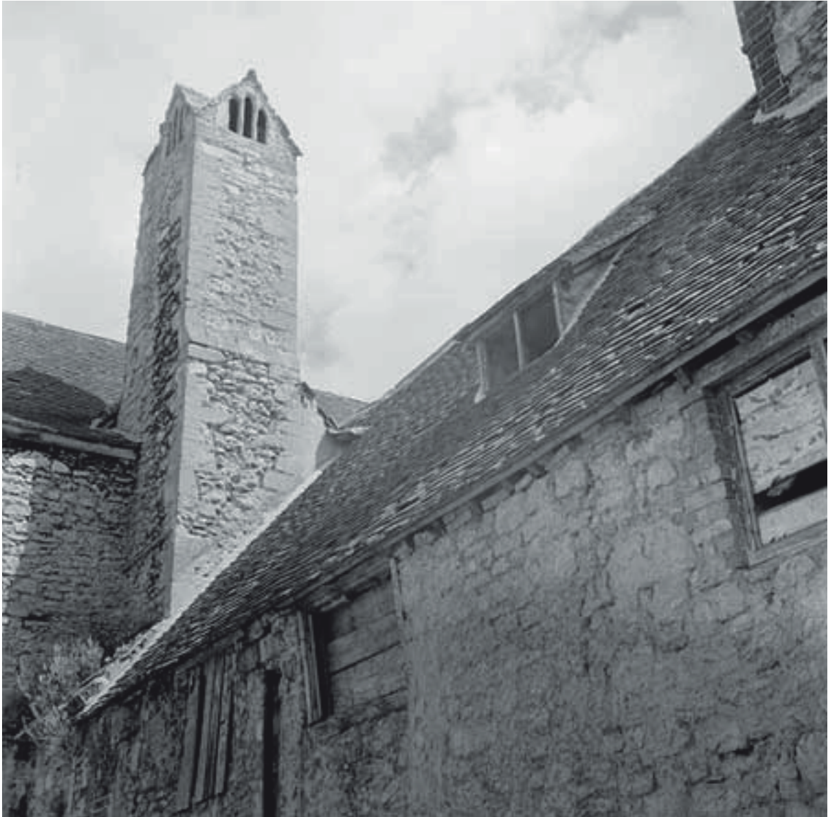
Figure 2: A medieval chimney at Abingdon Abbey, Oxfordshire, post-1945

The Archaeology of the Gravel Terraces of the Upper and Middle Thames: The Thames Valley in the Medieval and Post-Medieval Periods AD 1000-2000