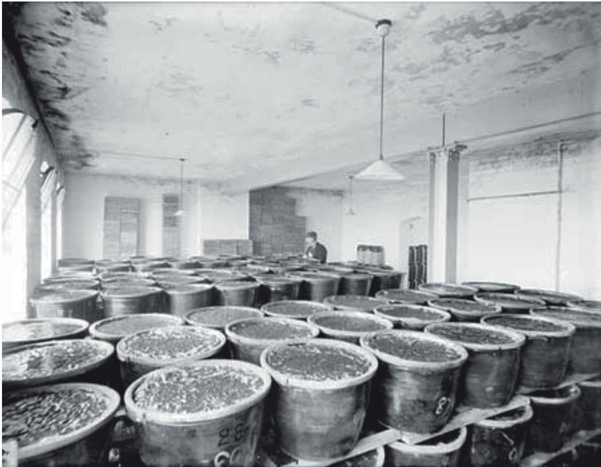
Figure 13: Frank Coopers Marmalade Works, Victoria Buildings, Park End Street, Oxford, 1905

The Archaeology of the Gravel Terraces of the Upper and Middle Thames: The Thames Valley in the Medieval and Post-Medieval Periods AD 1000-2000