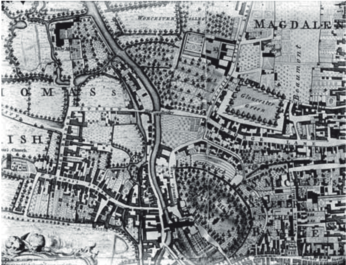
Figure 3: Taylors map dating to 1750 showing the west side of Oxford including Rewley Abbey, the castle precinct and Gloucester Green

The Archaeology of the Gravel Terraces of the Upper and Middle Thames: The Thames Valley in the Medieval and Post-Medieval Periods AD 1000-2000