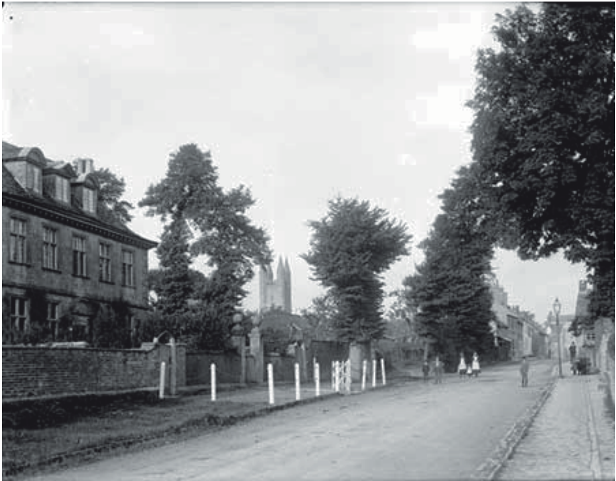
Figure 9: Cricklade Manor House on Calcutt Street with St Samson's Church in the background, Wiltshire, 1860–1922 (©Historic England)

The Archaeology of the Gravel Terraces of the Upper and Middle Thames: The Thames Valley in the Medieval and Post-Medieval Periods AD 1000-2000