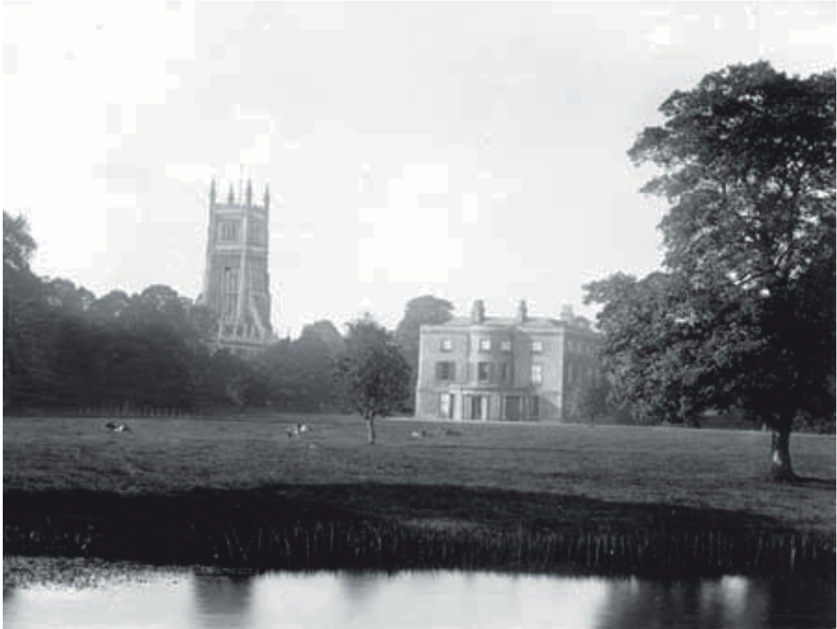
Figure 1: Abbey House in 1883 on the site of Cirencester Abbey, Gloucestershire

The Archaeology of the Gravel Terraces of the Upper and Middle Thames: The Thames Valley in the Medieval and Post-Medieval Periods AD 1000-2000