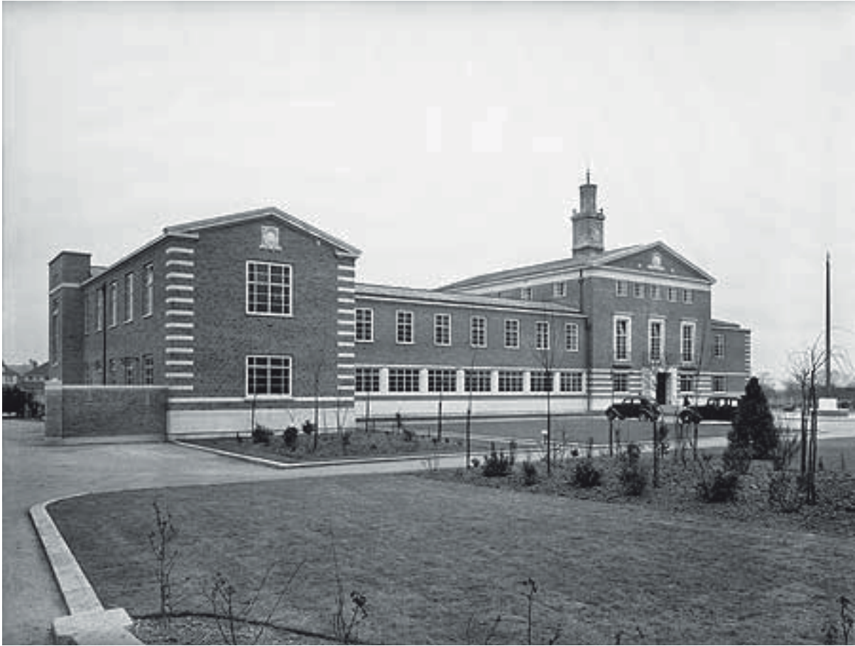
Figure 14: Slough Town Hall built in 1933, Bath Road, Slough, Berkshire, 1933–45

The Archaeology of the Gravel Terraces of the Upper and Middle Thames: The Thames Valley in the Medieval and Post-Medieval Periods AD 1000-2000