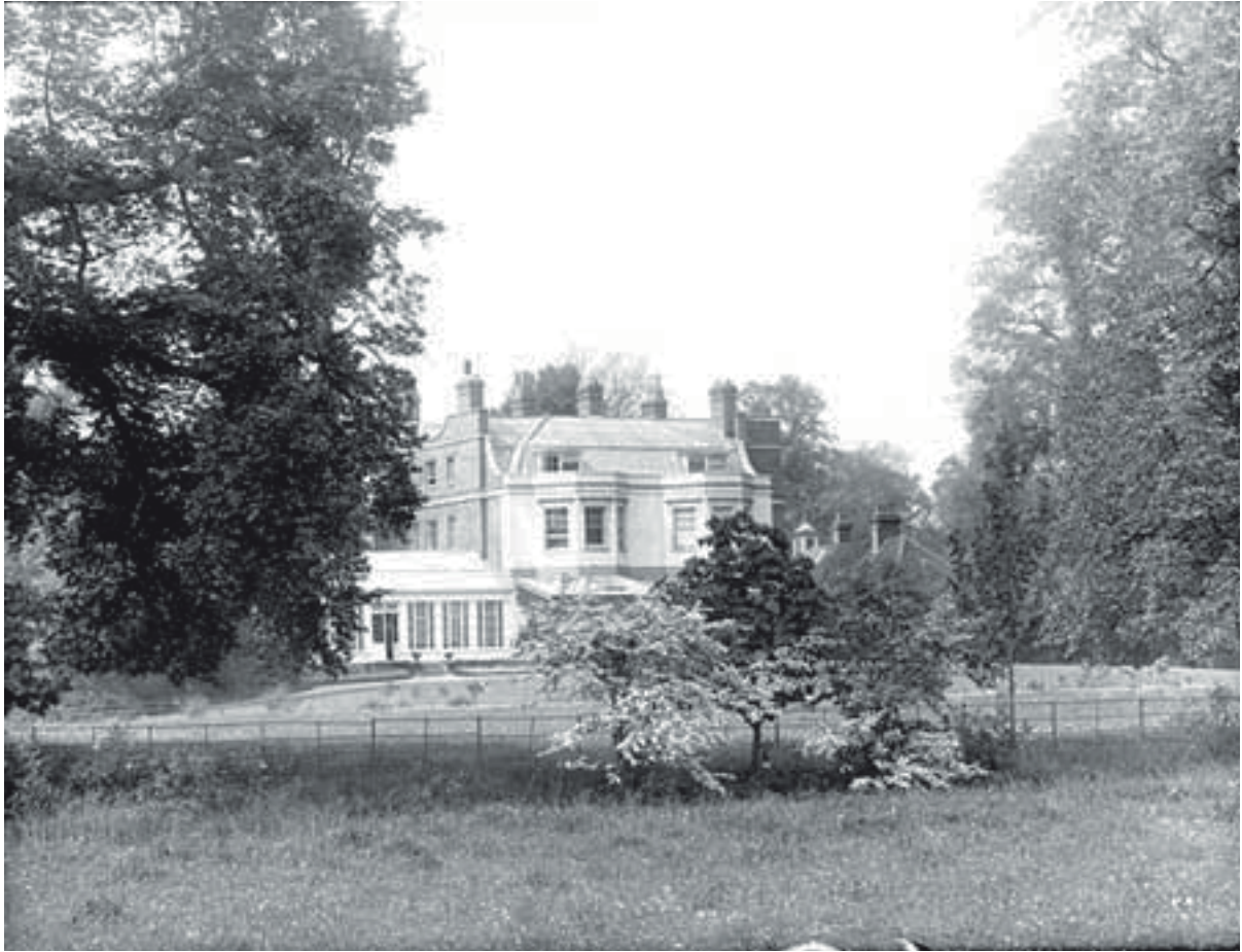
Figure 10: Court Garden, Marlow, Buckinghamshire (1860–1922)

The Archaeology of the Gravel Terraces of the Upper and Middle Thames: The Thames Valley in the Medieval and Post-Medieval Periods AD 1000-2000