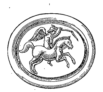
Intaglio from South Shields (Enlarged). (See page 264.)