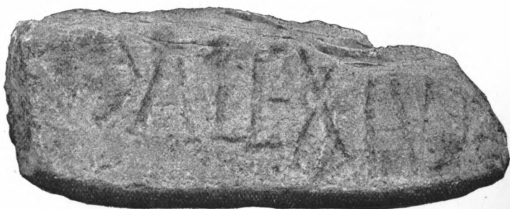
ROMAN INSCRIPTION FROM PROCOLITIA , now in Chesters Museum.