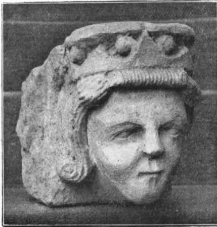
CORBEL FROM PILGRIM STREET, NEWCASTLE. (See p. xvii.)