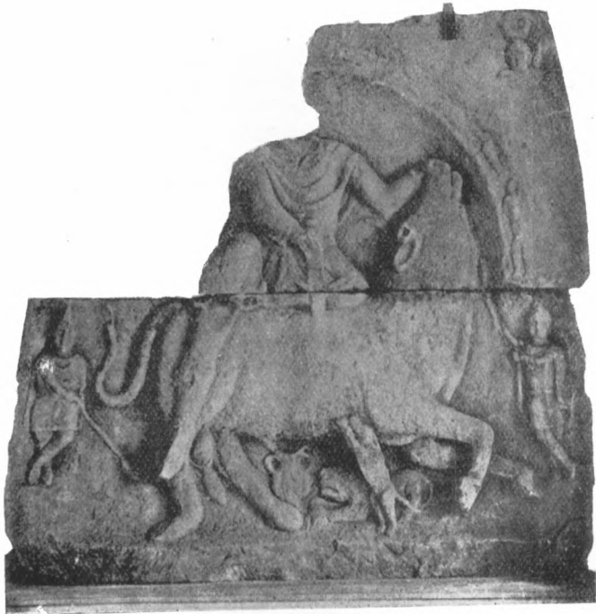
MITHRAIC SLAB FROM KASTELL KROTZENBURG. (See pp. iv. and 255 et seq. )