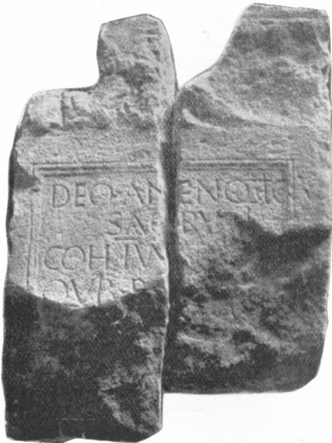
ROMAN INSCRIPTION TO ANTENOCITICUS FROM BENWELL.

The walls on plate XIX., are indicated in the same way as on plate X., where a key is given:—Solid black denotes early work; hatching, later work; cross-hatching, traces of foundations; and dotted lines, inferred line of wall.