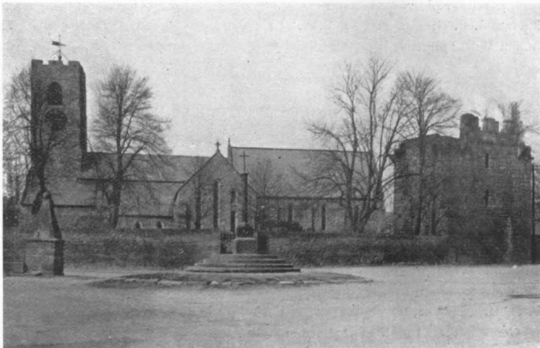
CORBRIDGE CHURCH AND VICAR'S PELE FROM SOUTH.