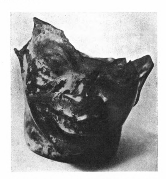
BLUE GLASS OF ROMAN DATE FROM POMPEII (ABOUT \frac{1}{4} ). In the Blackgate Museum.

The various serials and publications of learned societies which the Society receives in exchange for its own, or by subscription have been received regularly during the year. For list of societies see p. xxxv.