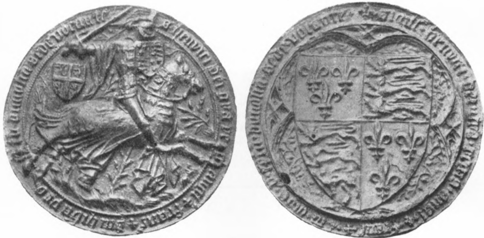
DURHAM BISHOPRIC ( sede vacante ): SEAL OF HENRY VI.