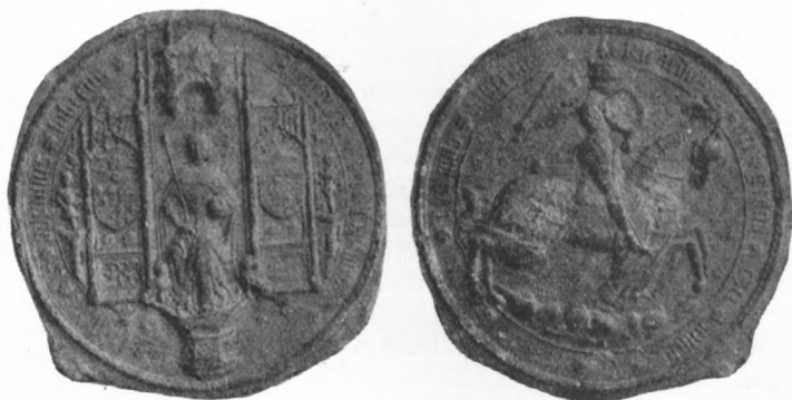
DURHAM SEALS: NO. 3049.